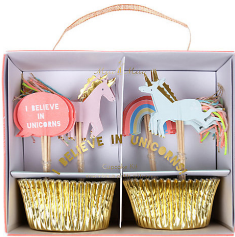
Meri Meri Cupcake kit, Peter Jones, £10