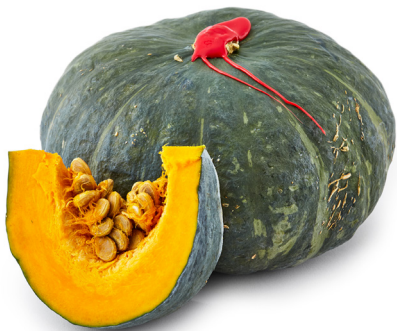
Delica Pumpkin, Natoora, £5 per kg