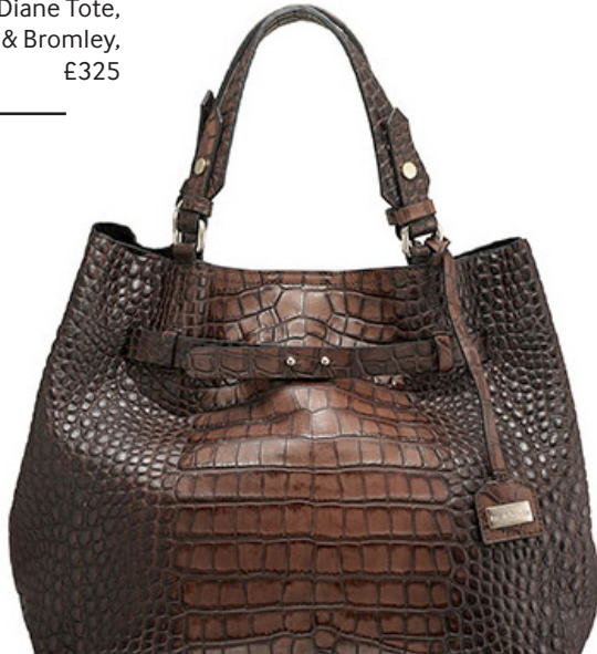
Chocolate Diane Tote, Russell & Bromley, £325