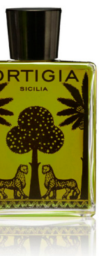
Bergamot Bath Oil, Ortigia, £36