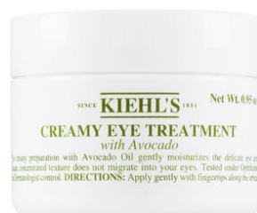
Creamy Eye Treatment with Avocado, Kiehl's, £34