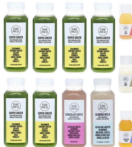
Clean Conscience Cleanse, Raw Press, from £70