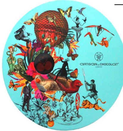
Colossal Melange De Chocolat, Artisan du Chocolat, £37.50