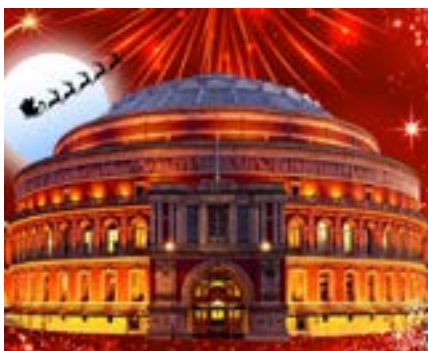
THE FASHION AWARDS 2017 4 Dec – Royal Albert Hall www.royalalberthall.com

Christmas at Kew brings illuminations to light up the buildings and plants. The mile-long, twinkling trail will lead visitors past singing trees, a flickering Fire Garden, kaleidoscopic projections and giant flora-inspired lights.