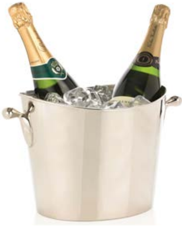
Champagne Trug, The White Company £95