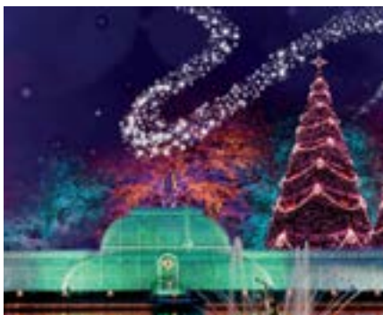
CHRISTMAS AT KEW 22 Nov to 1 Jan – Kew Gardens www.kew.org