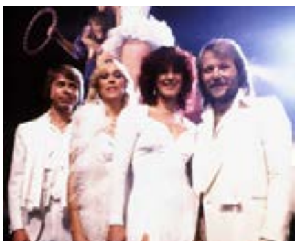
ABBA – SUPER TROOPERS 14 Dec to 29 Apr – Southbank Centre

Get festive with some of music's biggest names performing your favourite Christmas hits at London's Royal Albert Hall. Sing-along to some true classics both old and new as this iconic venue transforms into a rock 'n' roll winter wonderland for one very special evening. New acts announced include special guest and host Jason Manford, Chrissie Hynde and The Vamps.