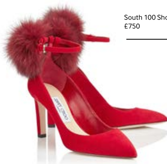
South 100 Shoes, JimmyChoo £750