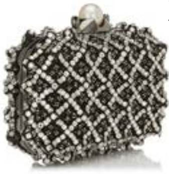
Cloud Bag, Jimmy Choo £2495