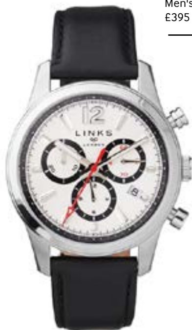
Greenwich Noon Men's Watch, Links £395