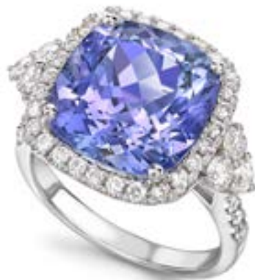
Zanite & Diamond Ring, Kiki McDonough £5900