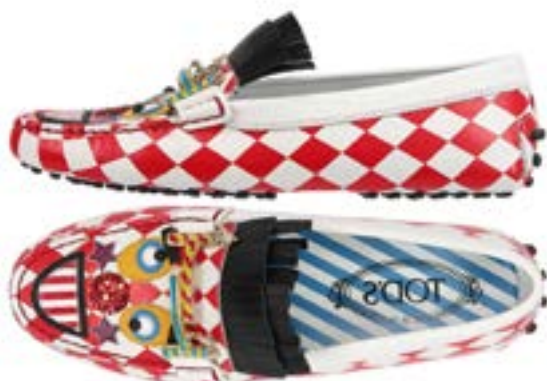
Circus Shoe, Tod's £635