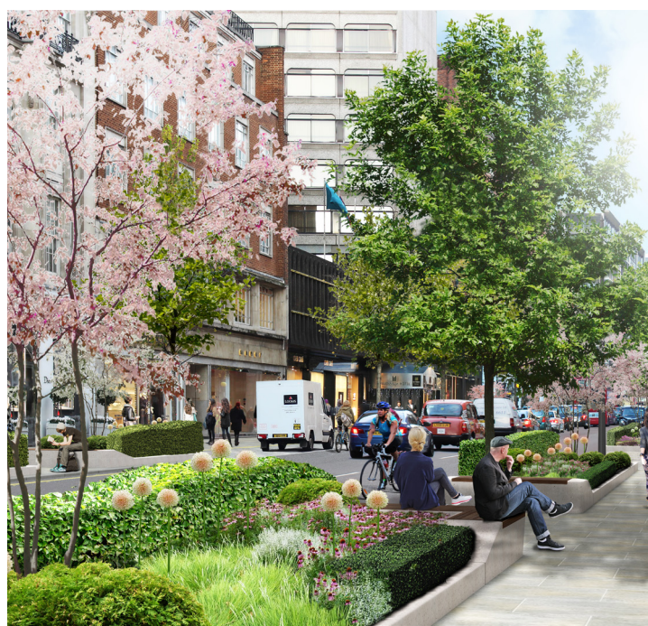
Indicative view of north Sloane Street