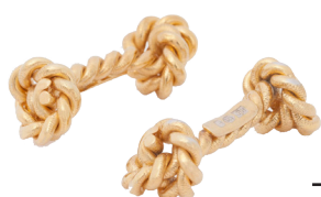
Knotted Rope Cufflinks, Hackett £150