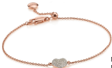
Nura Mini Heart Necklace, Monica Vinader £275