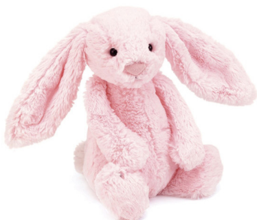
Jellycat Medium Bashful Bunny, Trotters £17