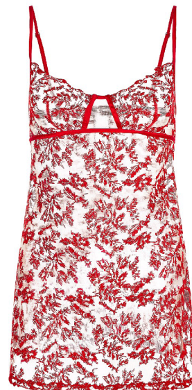
Autografo Baby Doll, La Perla £730