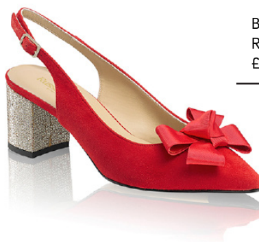
Bow Trim Slingback, Russell & Bromley £175