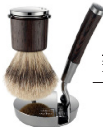
Acqua Di Parma Shaving Stand, Space NK £389