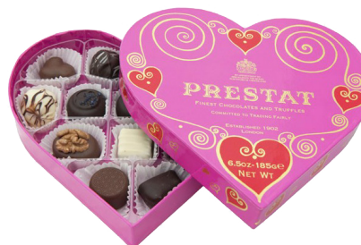
Heart Assorted Chocolate Box, Prestat £19.50