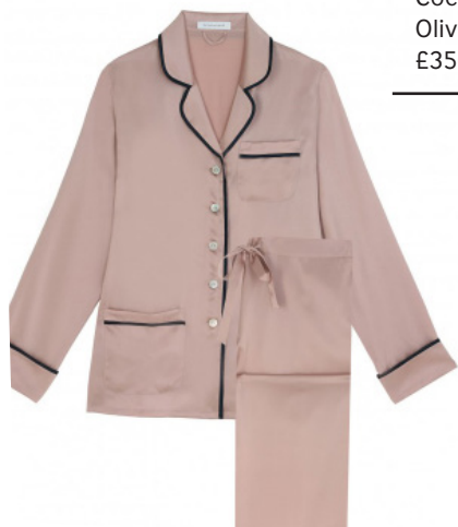
Coco Oyster Silk Pyjamas, Olivia Von Halle £350