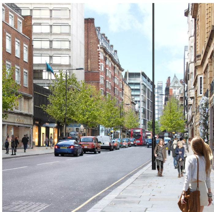
Existing view of north Sloane Street