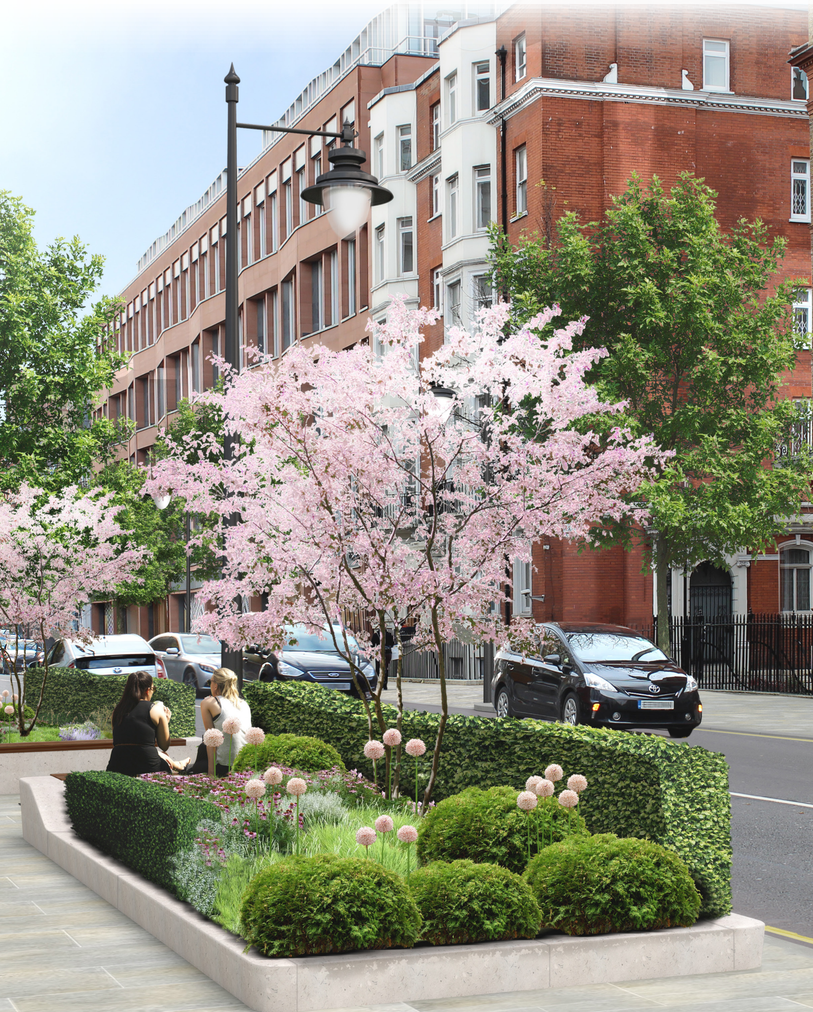
Indicative view of the southern part of Sloane Street between Cadogan Place and Ellis Street