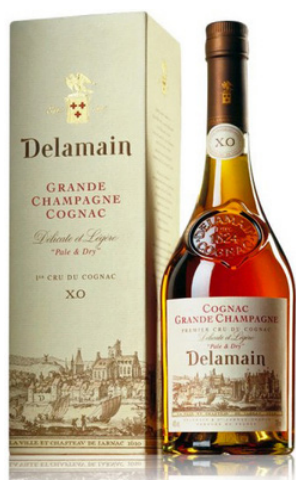
Delamain Grande Champagne Cognac, Partridges £79.99