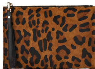
Leopard Wristlet, Whistles £65