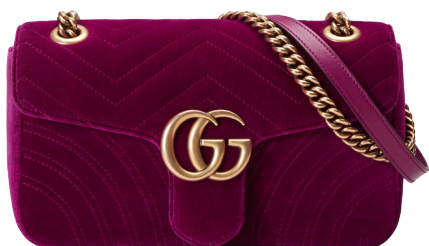
GG Marmont Velvet Shoulder Bag, Gucci £1,050