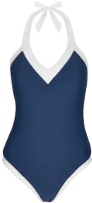
Cape Cod One Piece, Heidi Klein £210