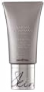
Skin Insurance SPF 30, Sarah Chapman £49