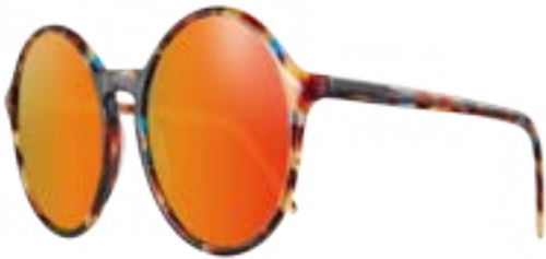
Sunglasses, Tom Davies £295