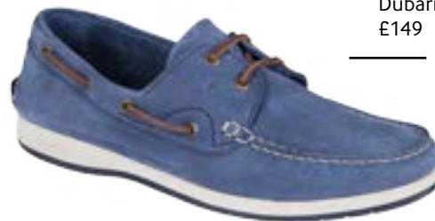
Men's Deck Shoe, Dubarry £149