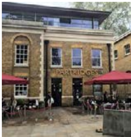
PARTRIDGES, CHELSEA www.partridges.co.uk

Partridges has been a Chelsea institution since 1972 and now stands as one of the only few family run food shops in Central London. Selling an array of fine goods, fresh produce and environmentally friendly products, as well as being home to a charming wine bar and cafe. Partridges is also proud holder of a Royal Warrant, as grocer to Her Majesty the Queen.