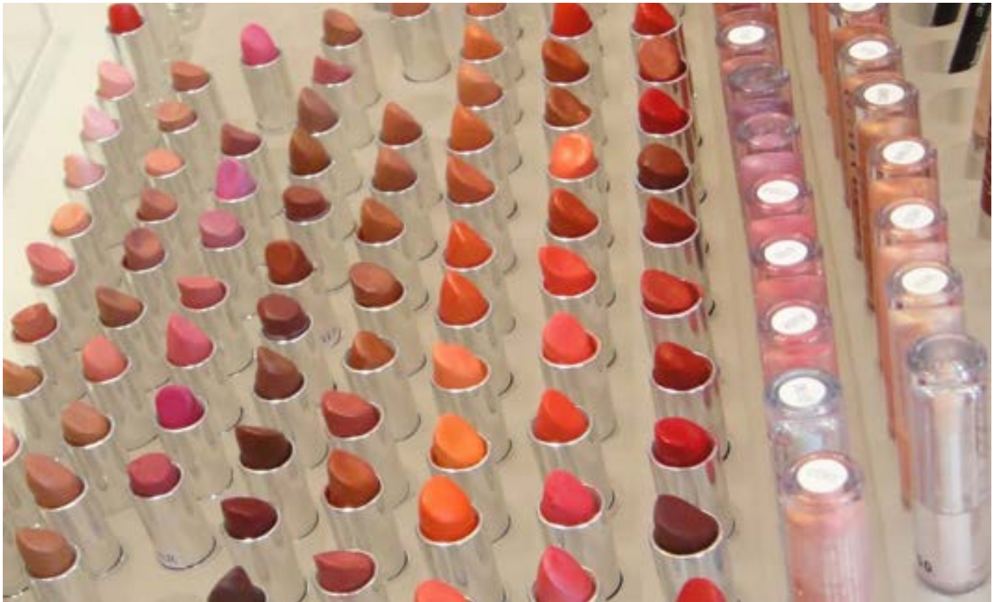
COSMETICS A LA CARTE, CHELSEA www.cosmeticsalacarte.com

Dedicated to natural beauty and empowerment, Cosmetics a la Carte is located on Chelsea's chic Pavilion Road. Their bespoke blending facility develops makeup, from foundations to eyeshadows, unique to your skin tone. This highly-personalised service goes above and beyond (including recreating discontinued favourites, such as lipstick shades), with anti-ageing skincare fundamental to the brand.