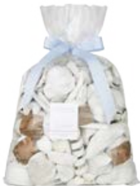
Seychelles Pot Pourri, The White Company £20