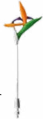
Bird of Paradise Pin Tateossian £89