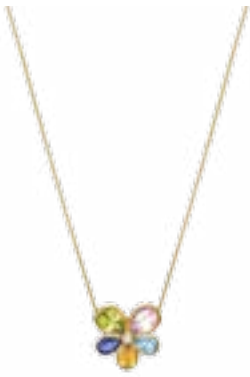
Mixed Gemstone Viola Pendant Cassandra Goad From £975