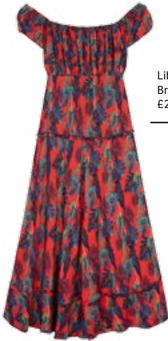
Liberty Print Sundress Brora £245