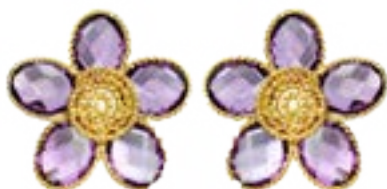
Amethyst Flower Stud Earrings Kiki McDonough £1,100