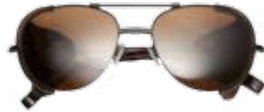
Titanium & Leather Sunglasses Tom Davies £495