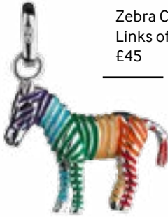
Zebra Charm Links of London £45