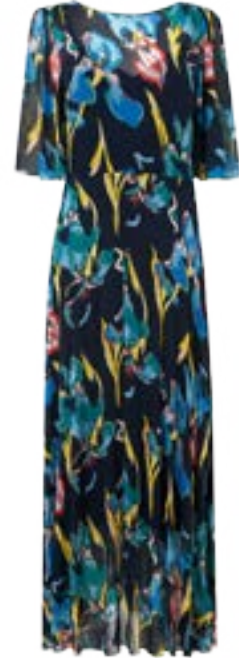
Desiree Dress LK Bennett £450