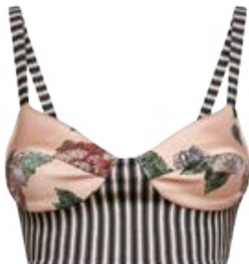
Floral Silk Bralet La Perla £540