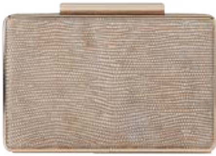
Metallic Lizard Clutch LK Bennett £195