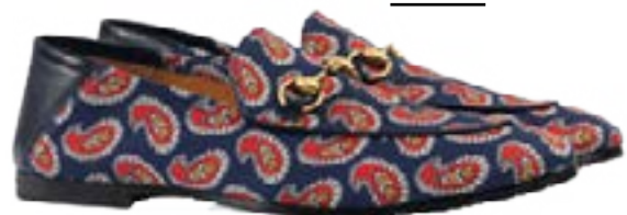
Men's Paisley Print Loafer Shoes Gucci £405