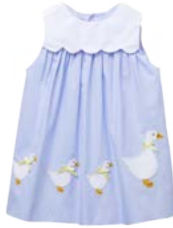
Little Bluebell Duck Dress Trotters £40