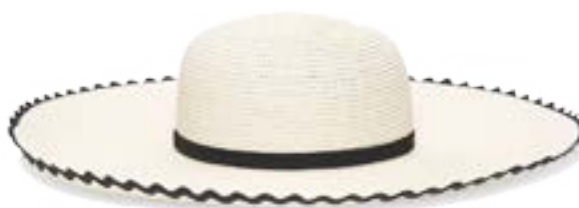
Anree Scallop Hat Club Monaco £123.71