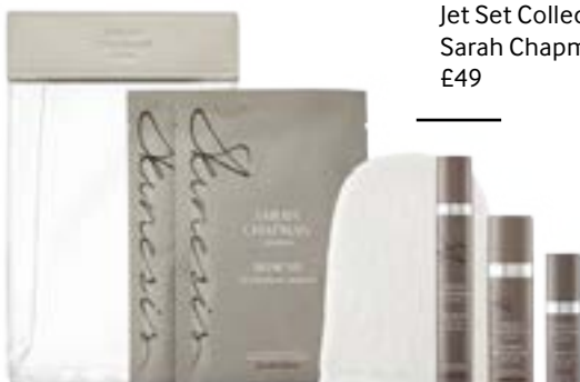
Jet Set Collection Sarah Chapman £49