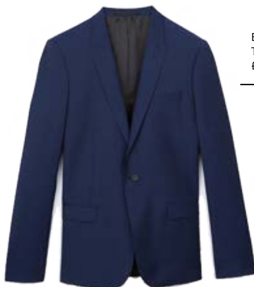
Blue Suit Jacket The Kooples £425