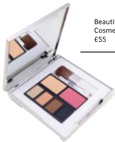
Beautifully British Palette Cosmetics a la Carte £55