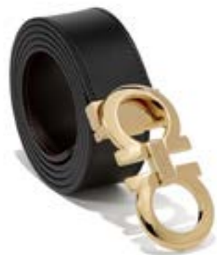
Men's Reversible and Adjustable Belt Salvatore Ferragamo £265