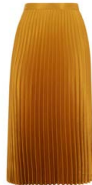
Satin Pleated Skirt Whistles £139