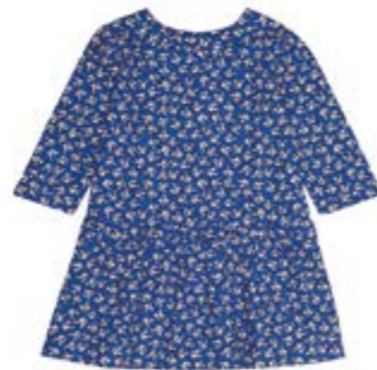
Bright Blue Squirrel Print Dress Bonpoint £107