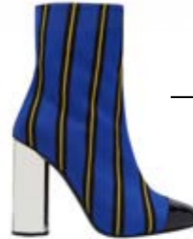
Marco De Vincenzo Boots Boutique 1 £580