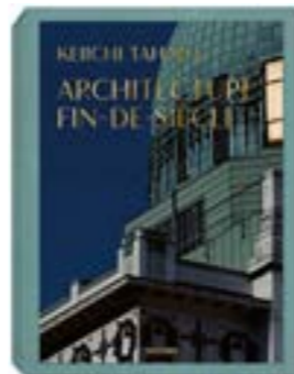
Architecture Fin-de-Siècle Taschen £250