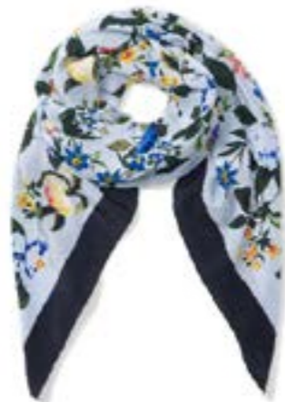
Silk Scarf Club Monaco £96.21