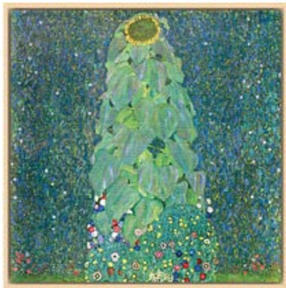
Gustav Klimt Framed Canvas Peter Jones £200