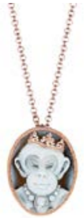
Royal Monkey Necklace Amedeo £8,150