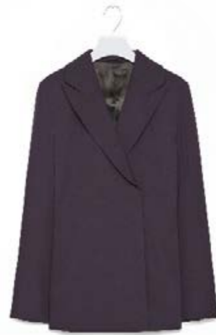
Waisted Wool Blazer COS £135