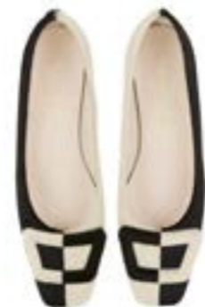
Camille Shoes French Sole £190