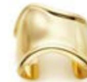
Elsa Peretti Cuff Tiffany & Co. £14,000