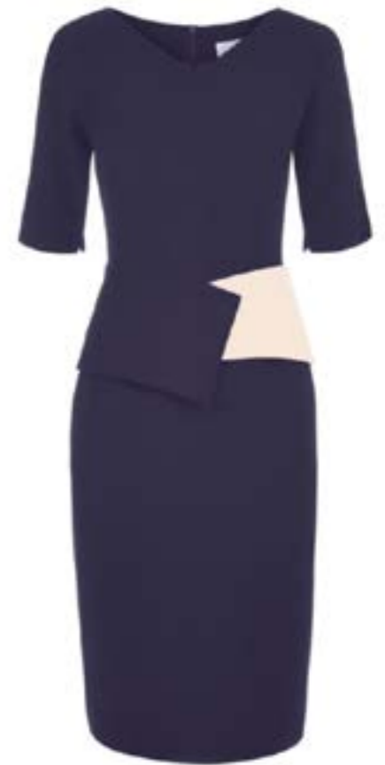
Sydney Dress Libby London £198