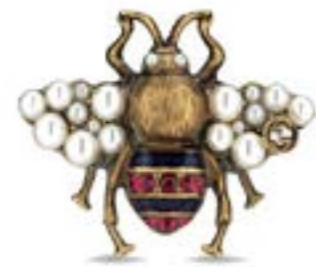
Bee Ring Gucci £390