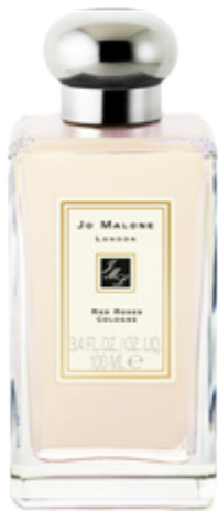
Jo Malone London Red Roses Cologne £90