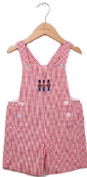
Trotters Red Gingham Dungarees £42