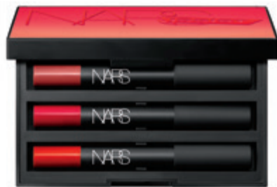
Nars Lip Pencil Set £48