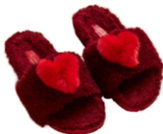
Anya Hindmarch Heart Slides £495