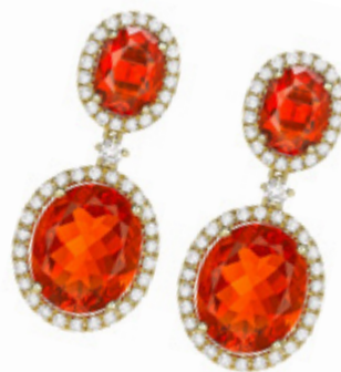
Kiki McDonough Fire Opal & Diamond Double Drop Earrings £4500