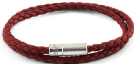
Tateossian Double Wrap Pop Rigato Leather Bracelet £145