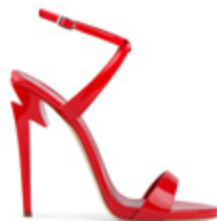
Giuseppe Zanotti G Heel £640