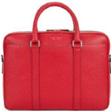
Hugo Boss Signature Collection Made In Italy Bag £575