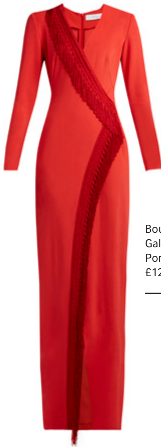
Boutique 1 Galvan Tunqui Fringe Ponte Dress £1295