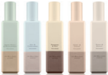
Jo Malone London English Fields Collection Bottles £47 each