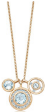
Kiki McDonough Forget Me Not Blue Topaz Triple Necklace £2500