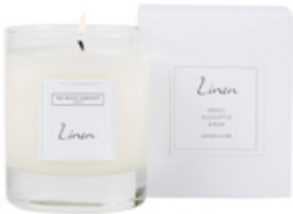
The White Company Linen Candle £20