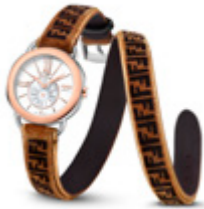
Fendi Rose Gold Interchangeable Watch Face £1200