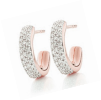
Monica Vinader Fiji Mini Hoop Earrings with Diamonds £425