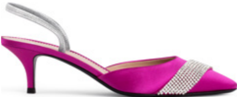
Giuseppe Zanotti Dorothy Shoe £640