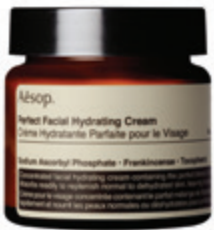
Aesop Perfect Facial Hydrating Cream £81