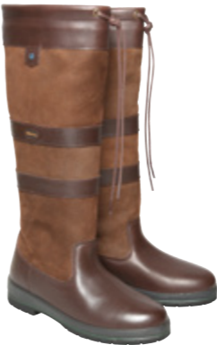
Dubarry Galway Boot £320