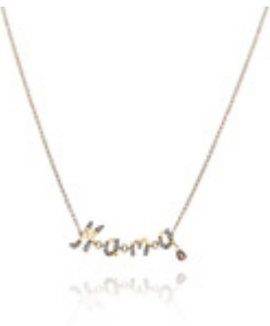
Annoushka 18ct Yellow Gold & Diamond Chain Letters Bespoke Necklace from £800