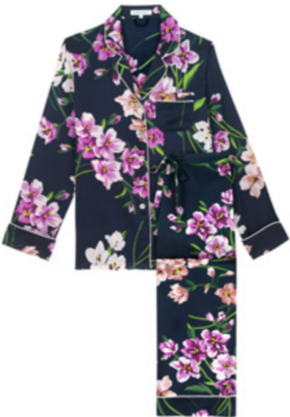
Olivia Von Halle Lila Betty Pyjamas £380