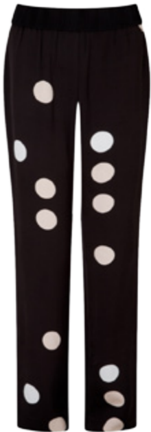
Jigsaw Oversized Spot Trouser, £140