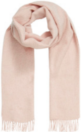
Brora Cashmere Scarf £98