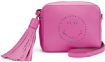
Anya Hindmarch Crossbody Smiley in Bubblegum Circus £550