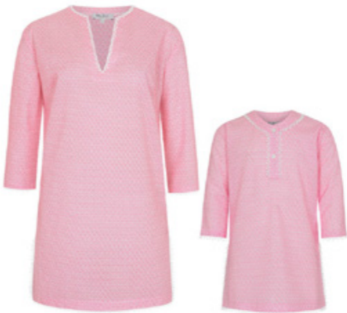
Trotters Kaftans Mother (£80) and Daughter (£50)