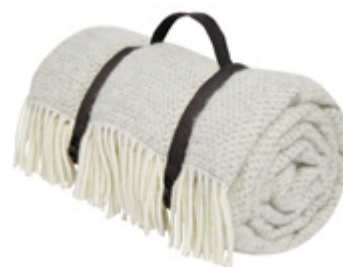
The White Company Picnic Blanket £90