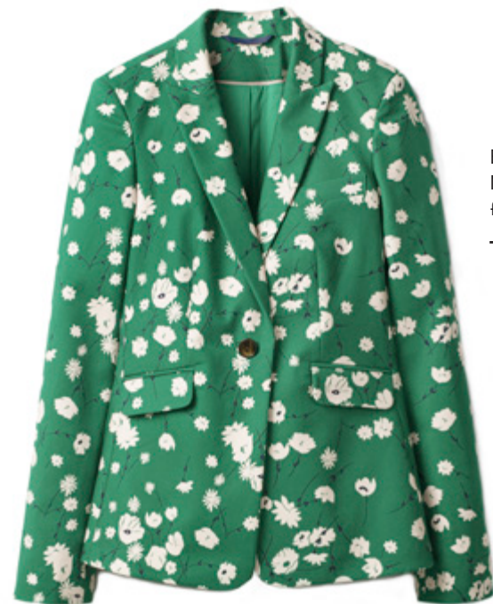
Boden Mallory Blazer £140