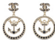
Chanel Earrings £860