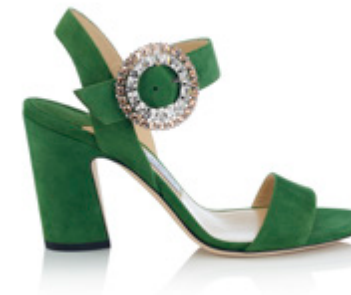
Jimmy Choo Mischa 85 Shoe £695