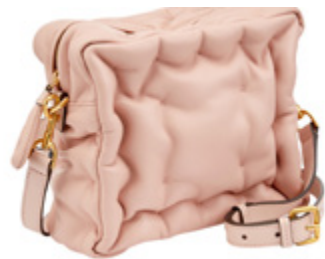
Anya Hindmarch Chubby Cube Crossbody in Light Rose £495