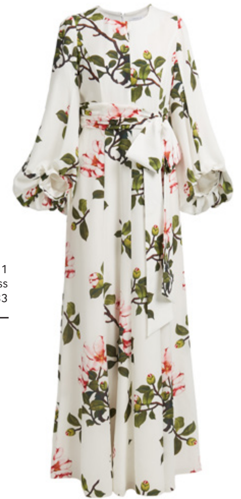
Boutique 1 ANDREW GN dress £2683