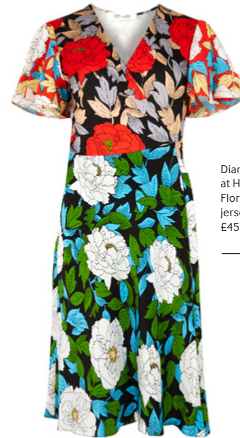
Diane Von Furstenberg at Harvey Nichols Floral-print silk and jersey wrap dress £455