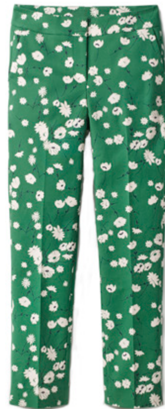
Boden 78th Trousers £75