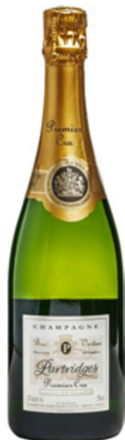
Partridges Champagne £30