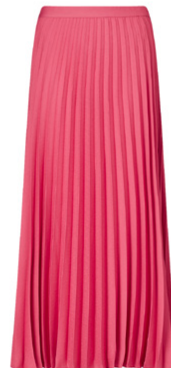
Jigsaw Pleated Midi Skirt, Watermelon £120