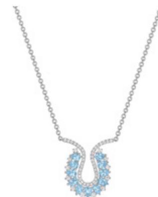
Kiki McDonough Juno Blue Topaz and White Gold Necklace £2900