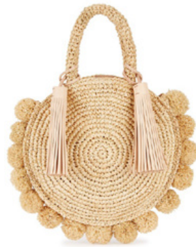
Loeffler Randall at Harvey Nichols Straw raffia circle tote £340