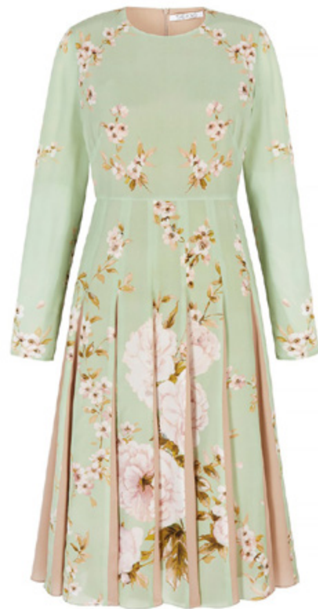
The Fold Hepburn Dress £495