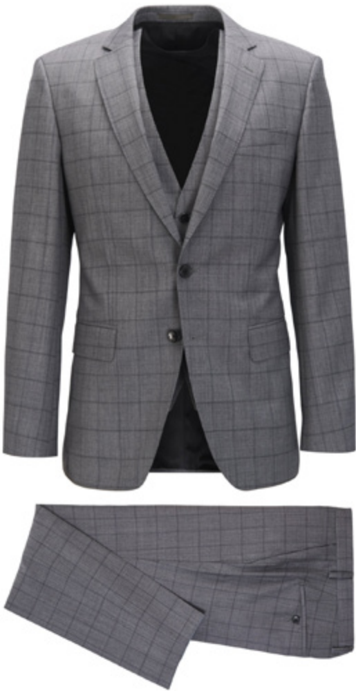
Hugo Boss Three Piece Suit £645