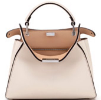
Fendi Peekaboo Essentially £2890