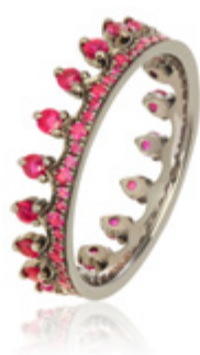
Annoushka 18ct White Gold & Ruby Ring £2200