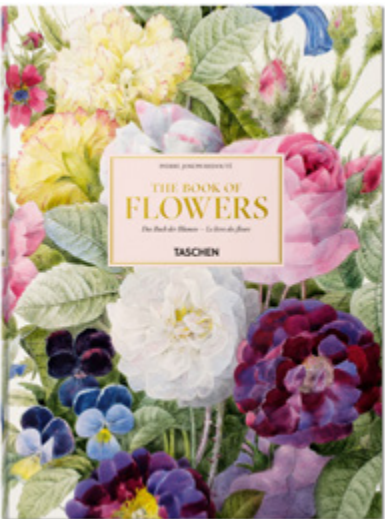
Taschen The Book of Flowers £50