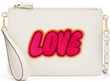
Anya Hindmarch Love Pouch £395