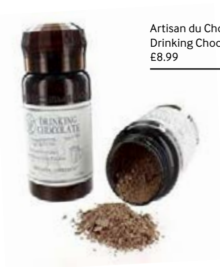
Artisan du Chocolat Drinking Chocolate £8.99