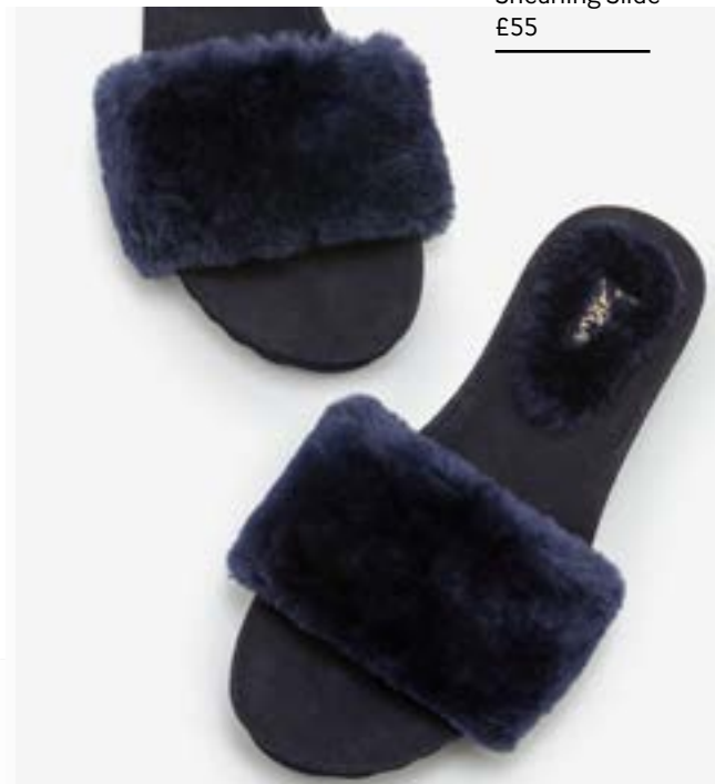
Boden Shearling Slide £55