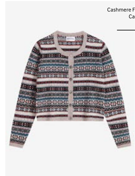
Brora Cashmere Fair Isle Cardigan £359