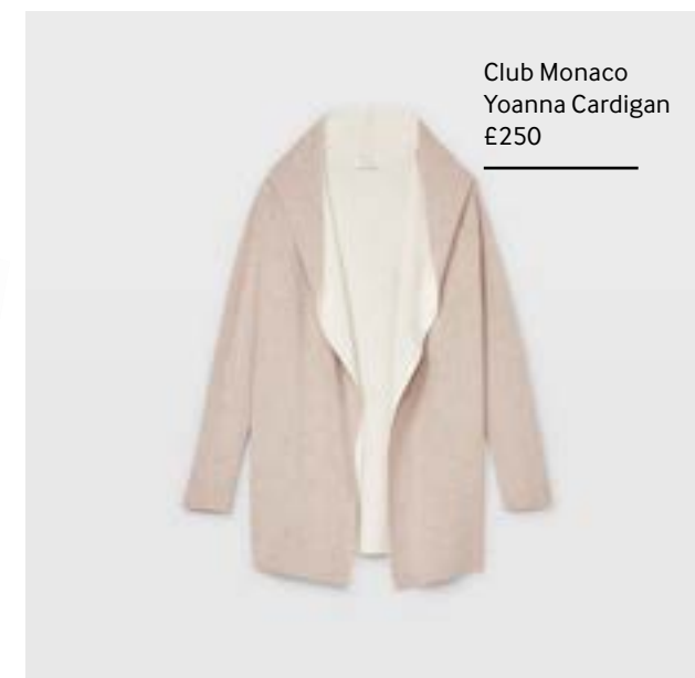
Club Monaco Yoanna Cardigan £250