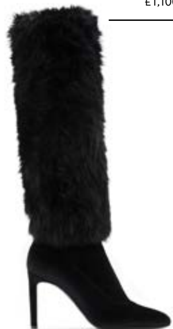
Giuseppe Zanotti Mandy Boot £1,100