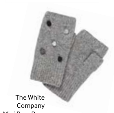
The White Company Mini Pom Pom Wrist Warmers £25