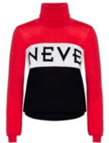
Giorgio Armani Jumper £850