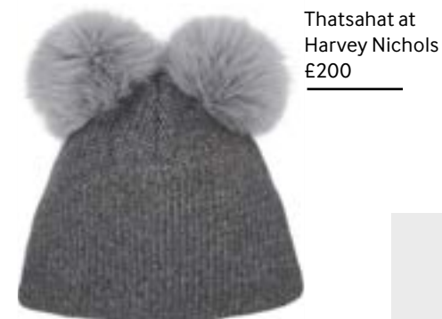
Thatsahat at Harvey Nichols £200