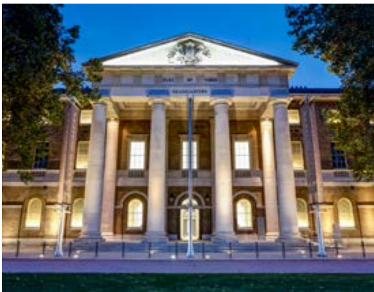
SAATCHI GALLERY Duke of York Square www.saatchigallery.com