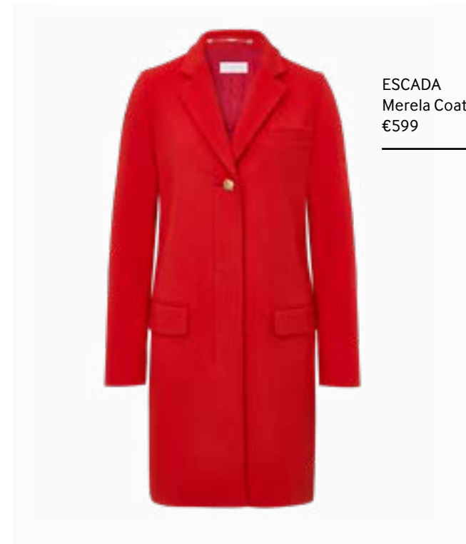
ESCADA Merela Coat €599