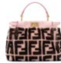
Fendi Mini Peekaboo Price on Request