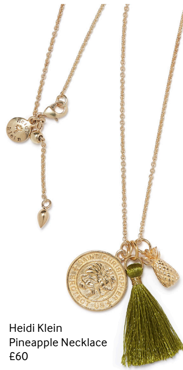
Heidi Klein Pineapple Necklace £60