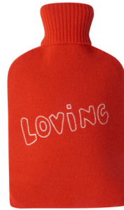
Bella Freud at Boutique 1 Loving Hot Water Bottle £135