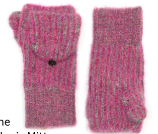
Rag & Bone Magenta Jonie Mittens £105