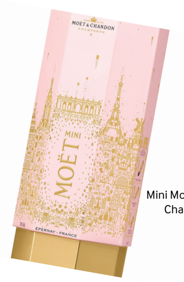
Mini Moët Impérial Rosé Champagne Cracker Harvey Nichols £22