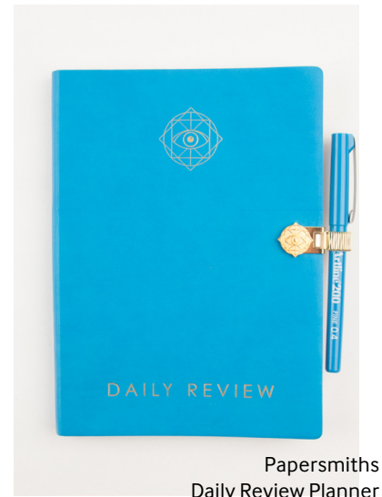
Papersmiths Daily Review Planner £20