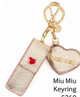
Miu Miu Keyring £260