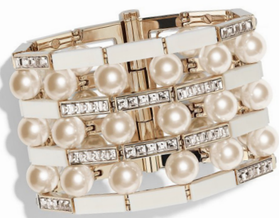
Chanel Metal & Pearl Cuff £5,015