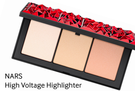
NARS High Voltage Highlighter Palette £35