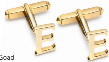
Cassandra Goad Alice Letter Cufflinks Yellow Gold £1,050