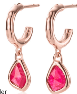
Monica Vinader Siren Large Nugget Hoop Earrings £225