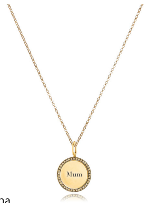
Annouskha 18ct Yellow Gold & Diamond Mythology Pave Diamond Disc £995