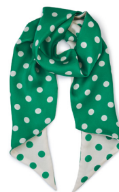
LK Bennett Lauren Fern Green & Ivory Scarf £75