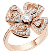
Bulgari Fiorever 18ct Rose Gold Ring £6,800