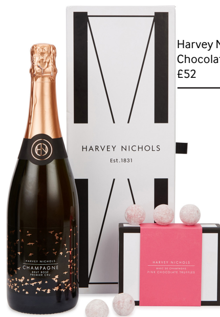
Harvey Nichols Brut Rosé & Pink Chocolate Truffles £52