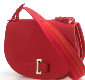
Delvaux Pin PM Taurillon Bag £1,950