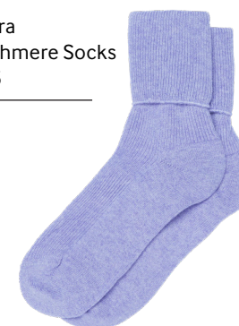
Brora Cashmere Socks £35