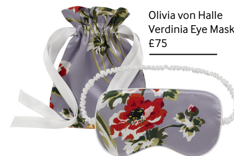
Olivia von Halle Verdinia Eye Mask £75