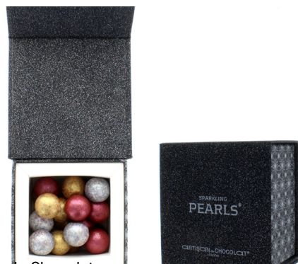
Artisan du Chocolat Sparkling Pearls 125g £17.50