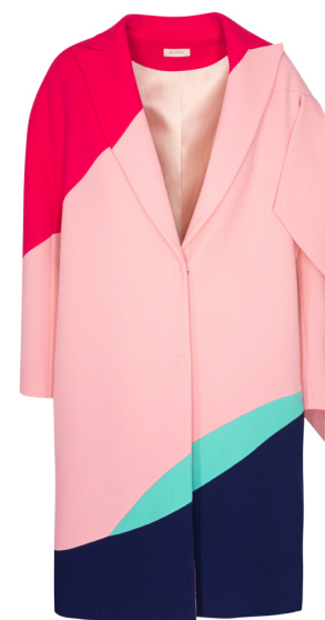
Delpozo Patchwork Bow Coat £2,650