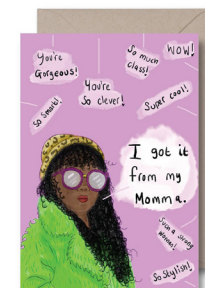
Papersmiths I Got It From my Momma Card £3.45