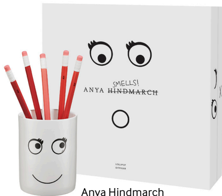
Anya Hindmarch Diffuser Lollipop £99