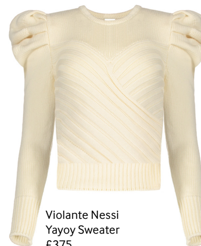
Violante Nessi Yayoy Sweater £375