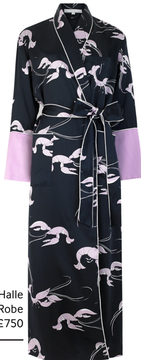
Olivia Von Halle Capability Constance Robe £750