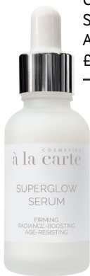
Cosmetics a la Carte Superglow Serum with Marine Antartic Algae £59