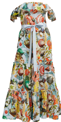
Boutique 1 Mary Katrantzou, Nata Dalia Cotton Poplin Dress £1,897