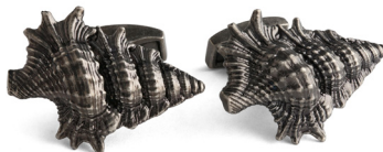
Tateossian Murex Cufflinks £159