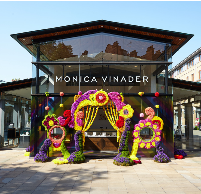
Last year 'Best Floral Display' winner