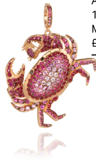
Annoushkha 18ct Rose Gold & Pink Sapphire Mythology Crab Locket £8,900