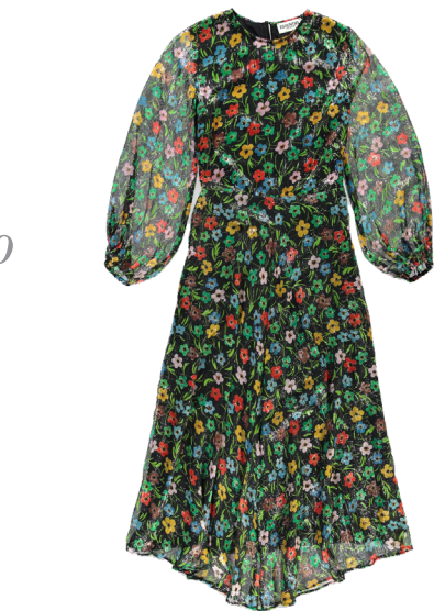
Essential Antwerp Sharkeisha Dress £230