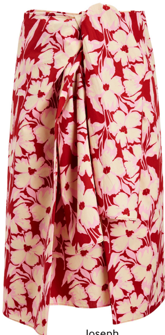
Joseph Clive Cotton Print Skirt £195