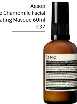
Aesop Skin Blue Chamomile Facial Hydrating Masque 60ml £37