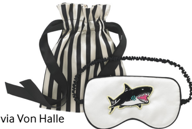
Olivia Von Halle Cody Eye Mask £150