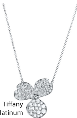
Tiffany Paper Flowers Pendant in Platinum with Diamonds £7,745