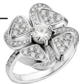
Bulgari Fiorever 18ct White Gold Ring £11,300