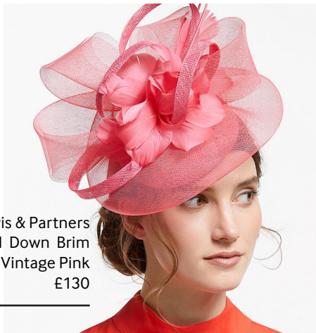
John Lewis & Partners Elle Floral Down Brim Occasion Hat, Vintage Pink £130