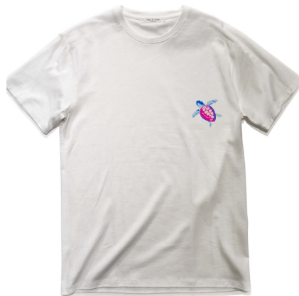
Rag & Bone Chelsea in Bloom Tee £95