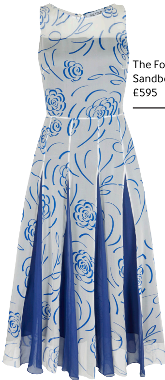
The Fold Sandbourne Dress £595