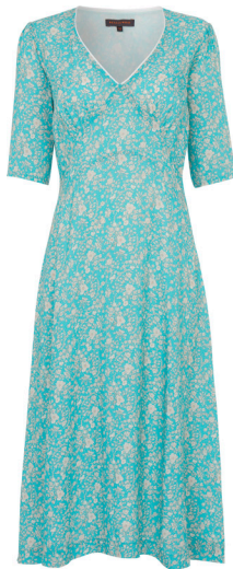
Really Wild V-Neck Dress in Sky White Floral £215