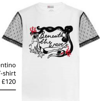
REDValentino T-shirt £120