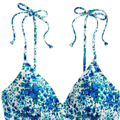
J. Crew Bikini Top in Mayapple Blue Floral £63