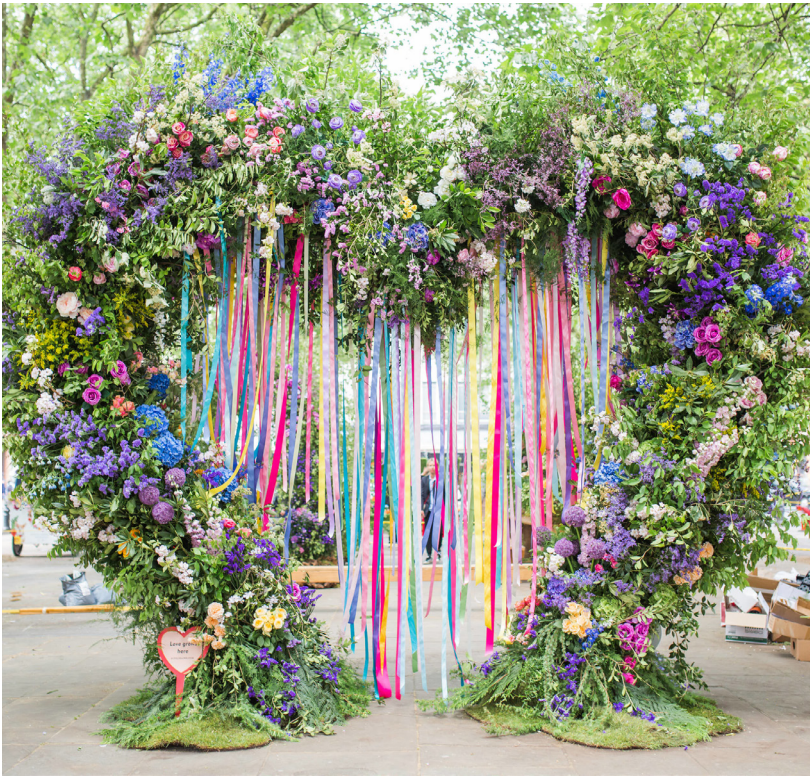
Chelsea in Bloom 2018