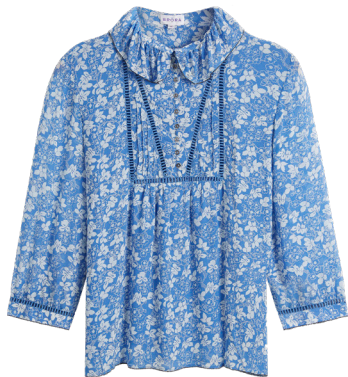
Brora Silk Chiffon Blouse £185