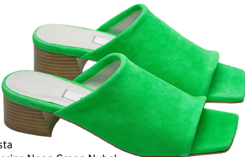
Miista Caterina Neon Green Nubck Suede Sandals £175