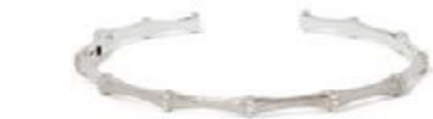
Annoushka Dream Catcher Bangle £3,500