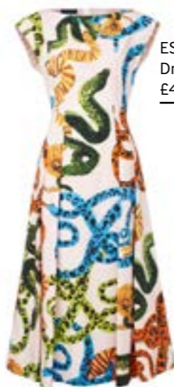
ESCADA Dress £475