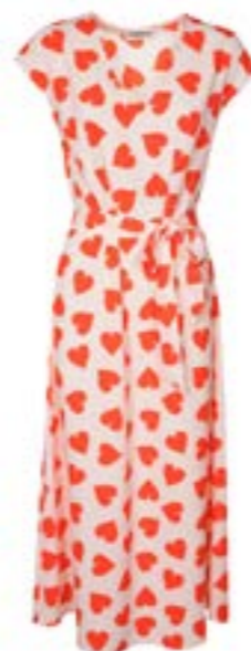
Essential Antwerp Sultan Mid Dress in Orange Heart Print £210