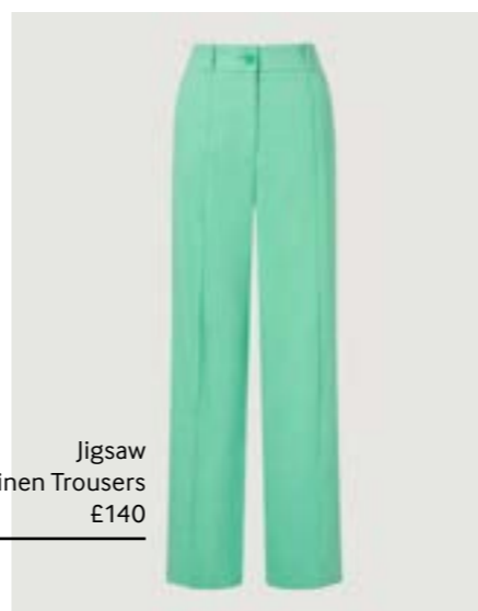
Jigsaw Portofino Linen Trousers £140