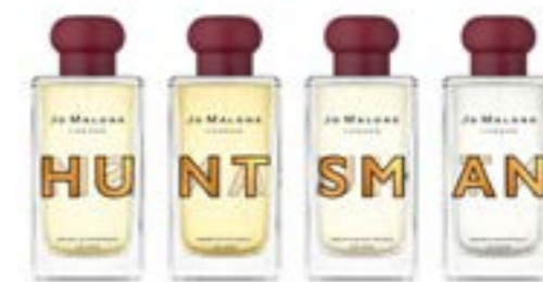
Jo Malone Huntsman Colognes £120 each