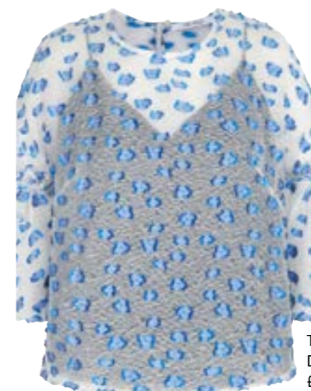
The Fold Dansdale Top £275