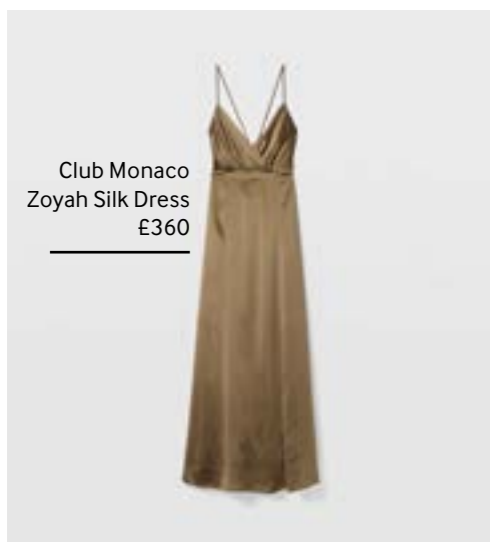
Club Monaco Zoyah Silk Dress £360