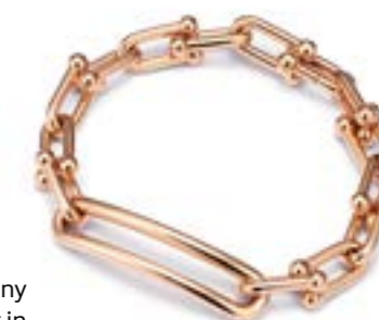
Tiffany Hardwear Link Bracelet in 18K Rose Gold £3,900