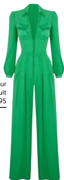
Agent Provocateur Jasper Jumpsuit £495