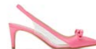
REDValentino Pumps in Satin and PVC £305