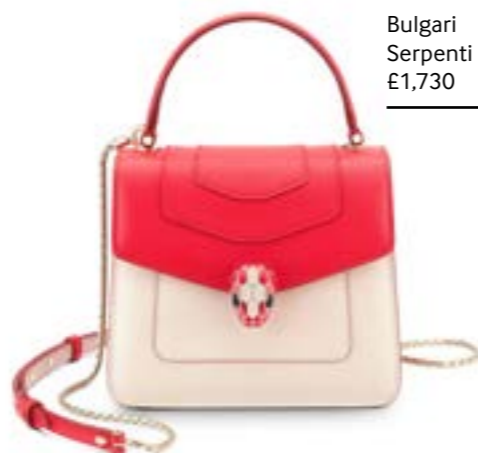
Bulgari Serpenti Forever Flap Cover Bag £1,730