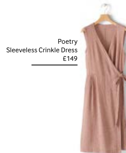
Poetry Sleeveless Crinkle Dress £149