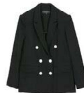
Rag & Bone Tia Blazer £490