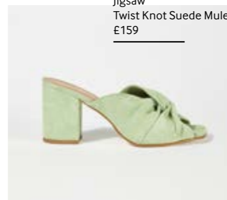
Jigsaw Twist Knot Suede Mule £159