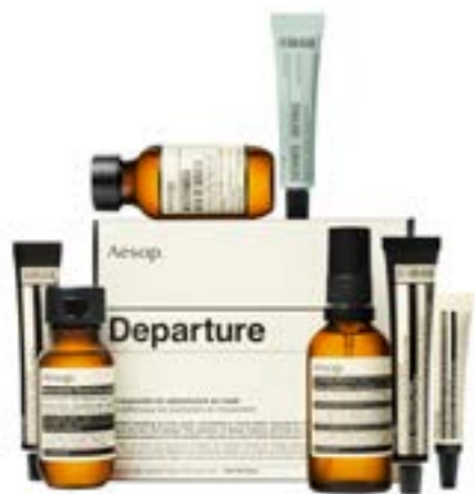
Aesop Departure Travel Set £45