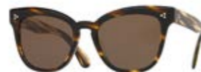
Oliver Peoples Marianela Sunglasses £306