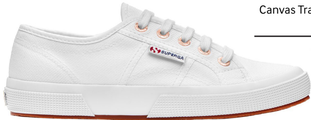
Superga 2750 Cotu Calssic White Canvas Trainer £55