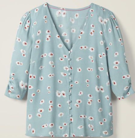
Boden Libby Top in Heritage Blue with Painted Daisies £60