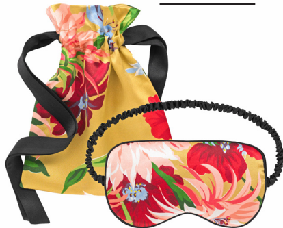
Olivia Von Halle Havana Eyemask £75