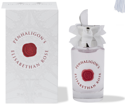
Penhaligon's Elisabethan Rose Scent £70