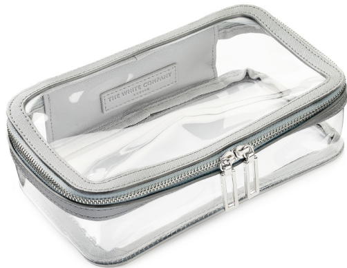
The White Company Clear Travel Cosmetics Case £35