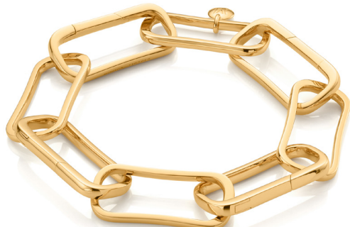
Monica Vinader Alta Capture Large Link Bracelet £375