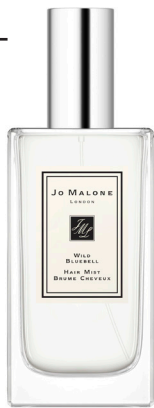
Jo Malone Wild Bluebell Hair Mist £38