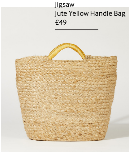
Jigsaw Jute Yellow Handle Bag £49