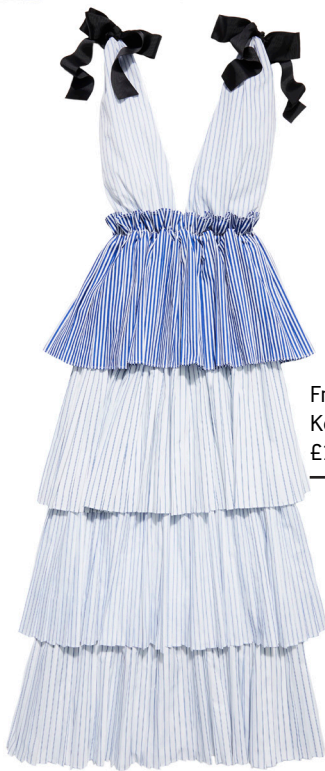
Free People Keza Maxi Dress £200