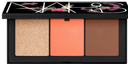
NARS Private Paradise Tapu Face Palette £36