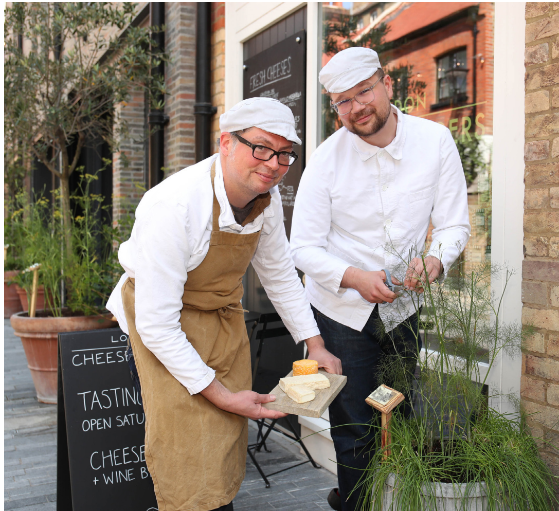
London Cheesemongers chop chives outside their store