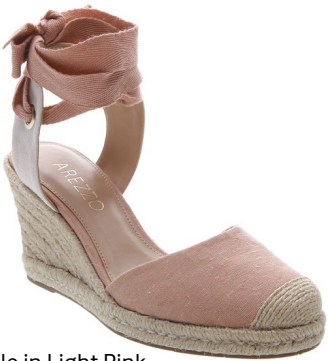
Blaiz Chelsea Arezzo Espadrille in Light Pink £115