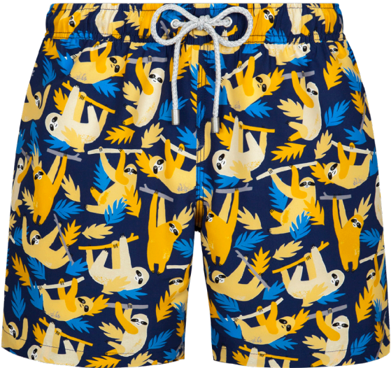
Bluemint Arthus Lazy Days £95