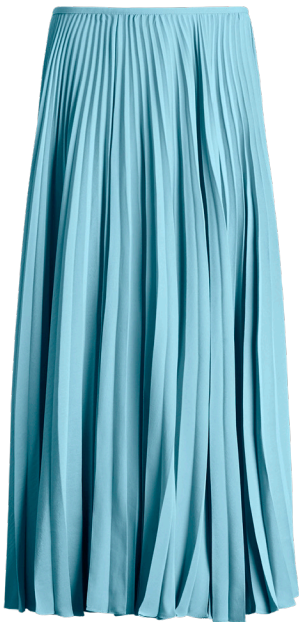
Joseph Abbot Pleated Toile Wedgewood Skirt £295