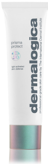
Dermalogica Prisma Protect SPF 30 £58