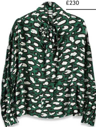
Essential Antwerp Bottle Green Leopard Print Silk Pussy Bow Shirt £230