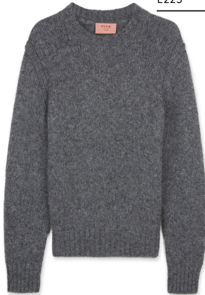
Pink Shirtmaker Alpaca Wool Crew Neck Sweater £225