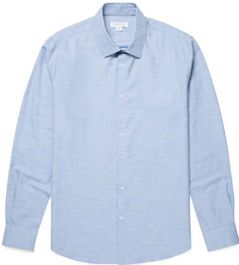
Sunspel Mens Cotton Cashmere Shirt £175