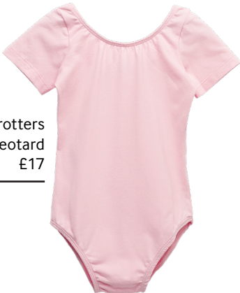
Trotters Ballet Leotard £17