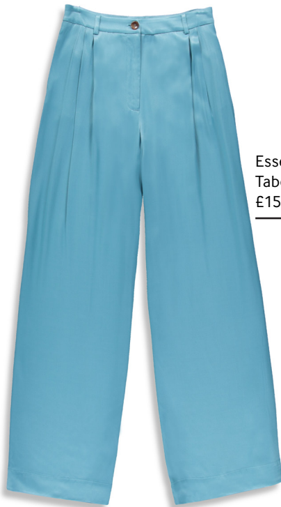
Essential Antwerp Taboe Pants £155