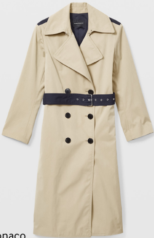
Club Monaco Colour Block Trench Coat in Navy Multi £498