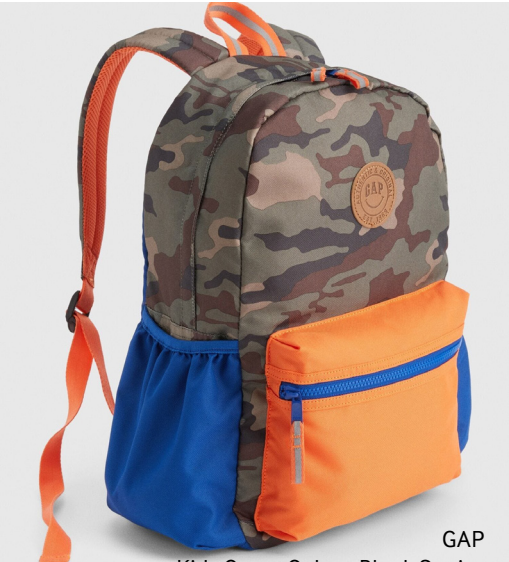
GAP Kids Camo Colour Block Senior Backpack £17.97