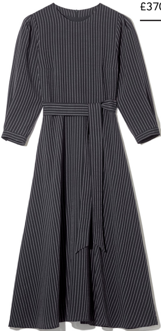
Cefinn Isabel Dress £370