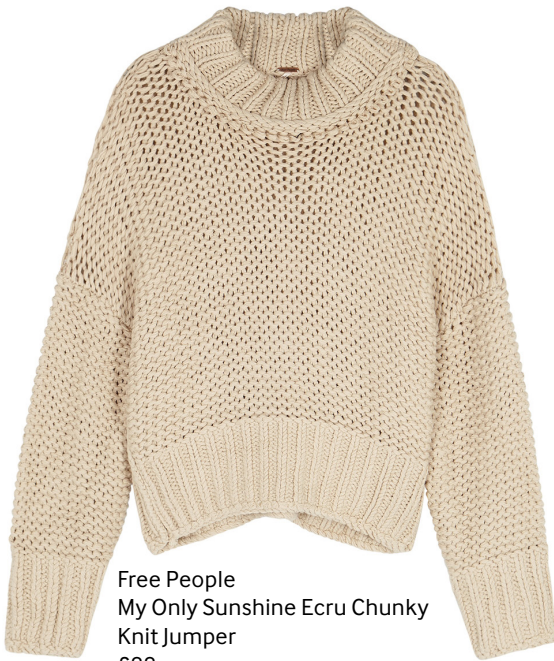
Free People My Only Sunshine Ecru Chunky Knit Jumper £88