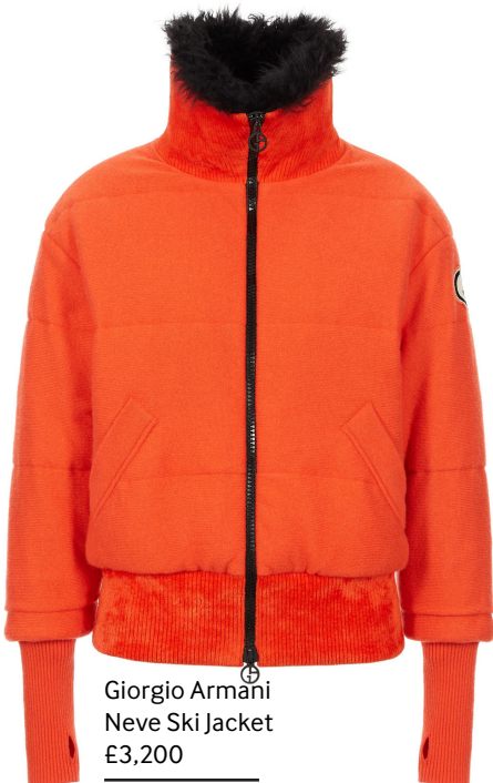
Giorgio Armani Neve Ski Jacket £3,200