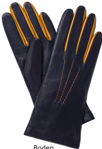
Boden Leather Gloves in Navy & Honey Mustard £60