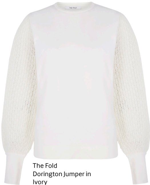
The Fold Dorington Jumper in Ivory £185