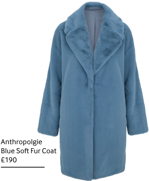
Anthropolgie Blue Soft Fur Coat £190