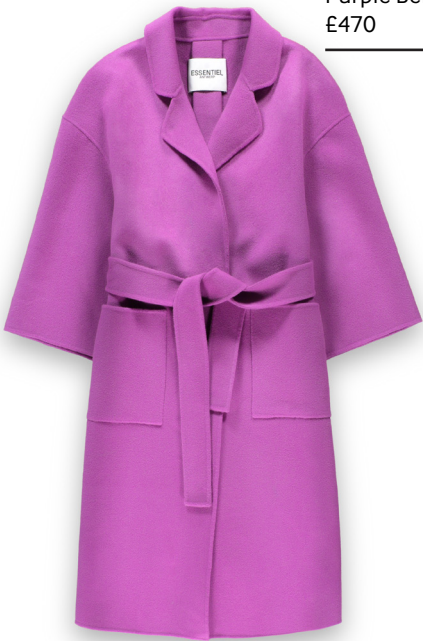
Essential Antwerp Purple Belted Wool Coat £470