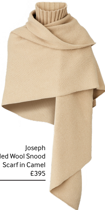
Joseph Boiled Wool Snood Scarf in Camel £395