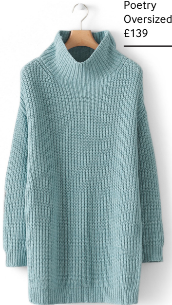
Poetry Oversized Jumper £139