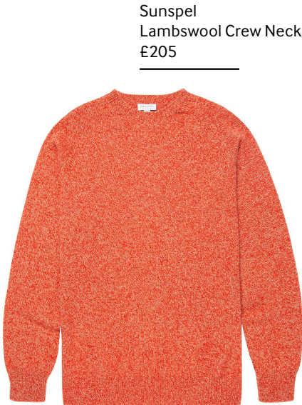
Sunspel Lambswool Crew Neck Jumper £205