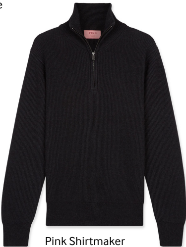
Pink Shirtmaker Merino Ribbed Zip Neck Sweater in Charcoal £295