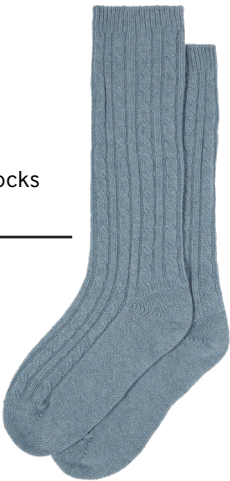
Brora Cashmere Socks £85