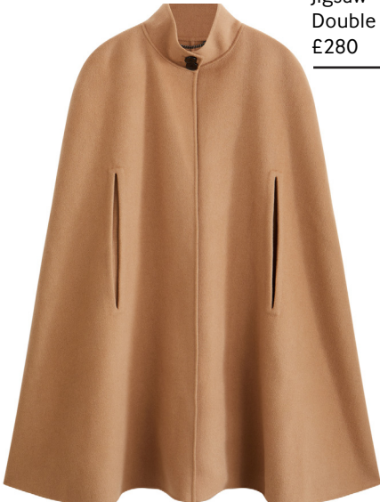
Jigsaw Double Face Cape £280