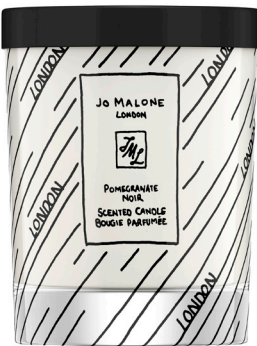
Jo Malone London City Candle Pomegranate Noir £52