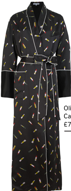
Olivia von Halle Capability Cleo Robe £790