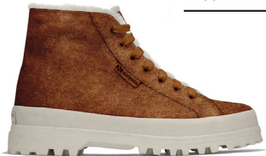
Superga Sherling Alpine Boot £190