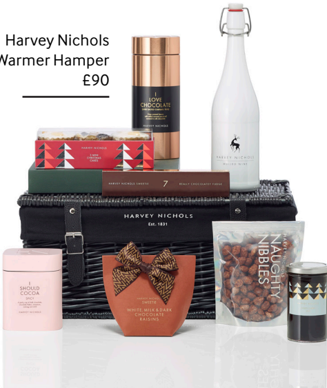
Harvey Nichols Winter Warmer Hamper £90