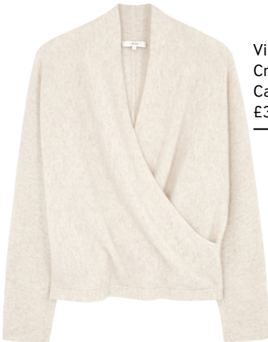
Vince at Harvey Nichols Cream Wrap Front Cashmere Jumper £380