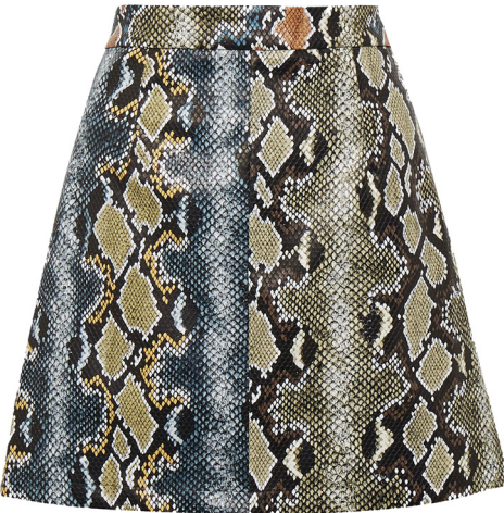
French Connection Adila PU Faux Snake Mini Skirt £75