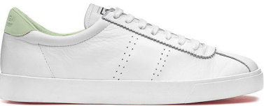
Superga White Sneakers £75