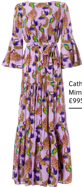
Catherine Prevost Mimi Dress £995