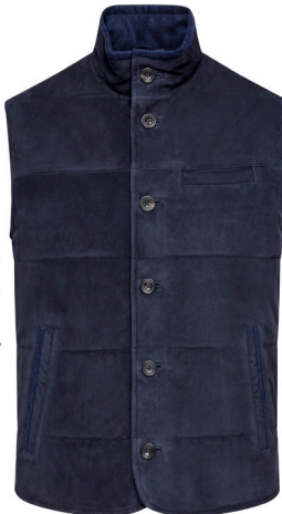
Hackett Mayfair Suede Flannel Gilet £750