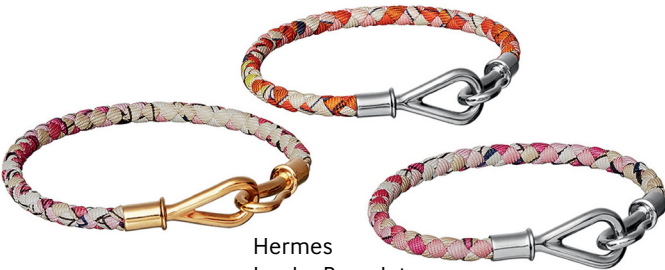
Hermès Jumbo Bracelet £195