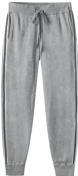
The White Company Side Stripe Knitted Jogger £89