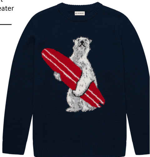
Bluemint Filip Sweater £130