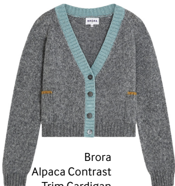
Brora Alpaca Contrast Trim Cardigan £195