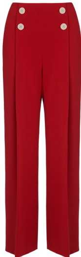
L.K.Benett Parker Trousers £150