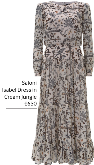
Saloni Isabel Dress in Cream Jungle £650