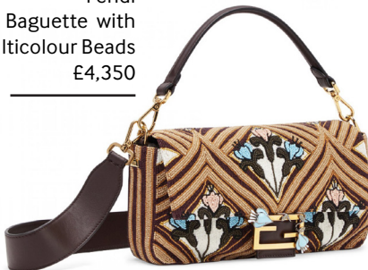
Fendi Brown Satin Baguette with Multicolour Beads £4,350