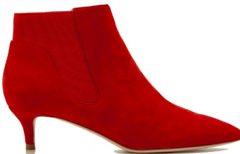
Boden Red Elsworth Kitten Ankle Boots £140