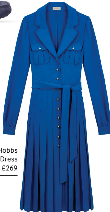
Hobbs Seren Dress £269