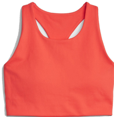
GapFit Racerback Bra £24.95