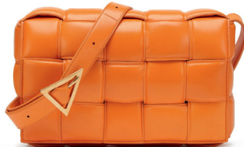
Bottega Veneta Orange Padded Cassette Bag £1,850