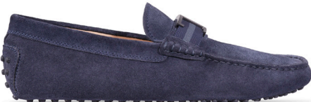
TOD's Suede Gommino £390