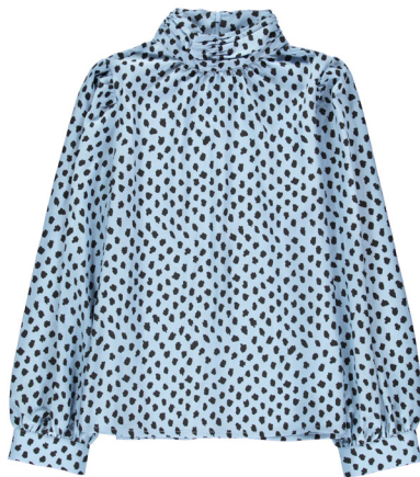
Essentiel Antwerp Light Blue Polka Dot Turtleneck Top £155