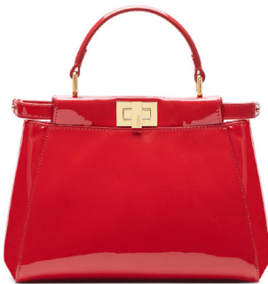
Fendi Peekaboo Iconic Mini £2,490