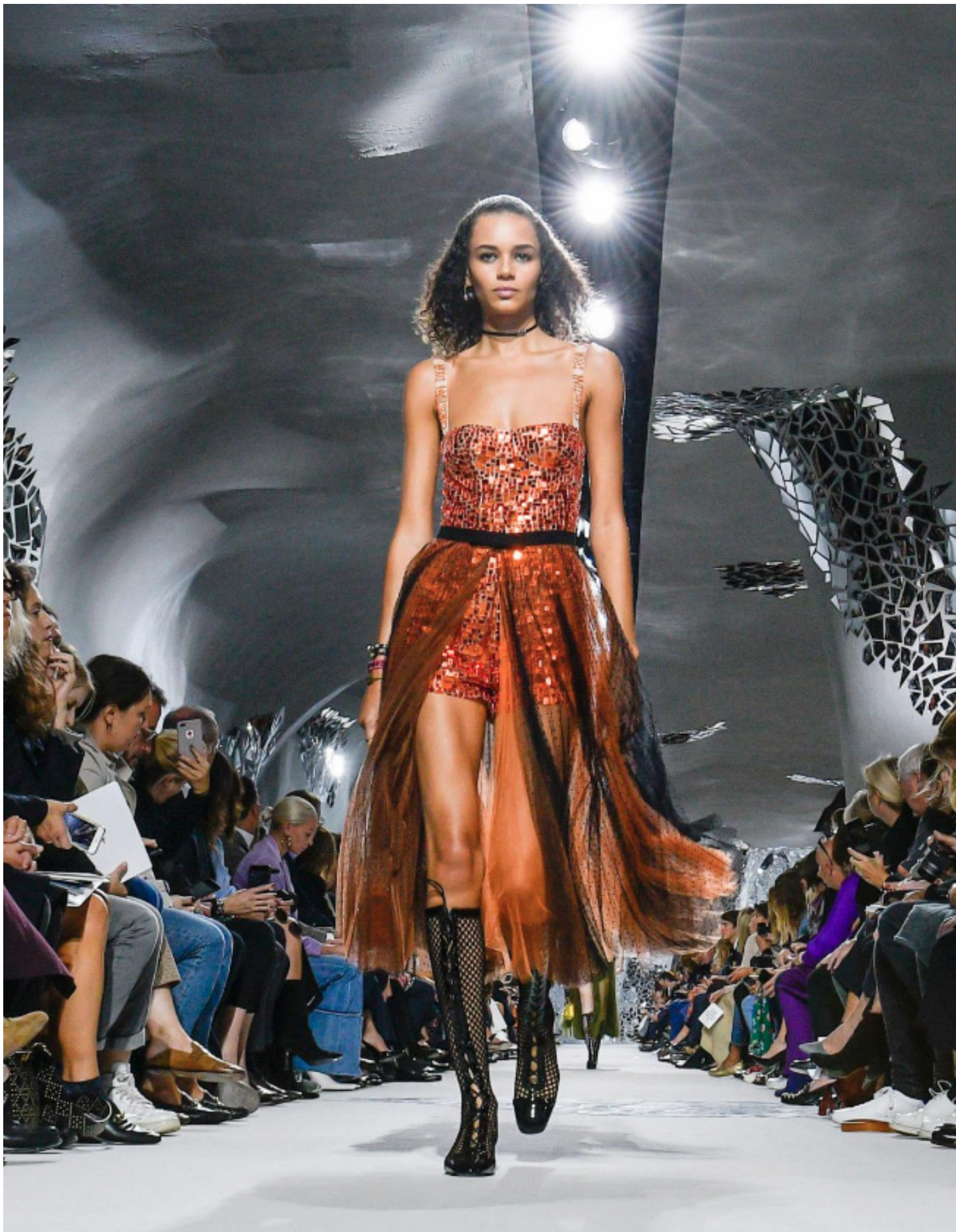
London Fashion Weekend