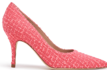
L.K. Bennett Harmony Shoes £195