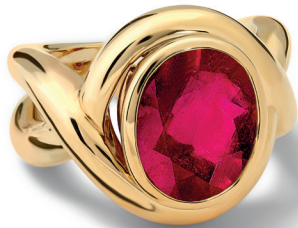
Cassandra Goad Severine Ruby Ring £2,780