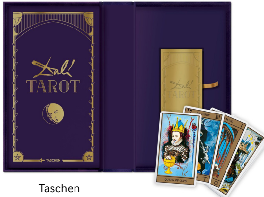
Taschen Dali Tarot Cards £50