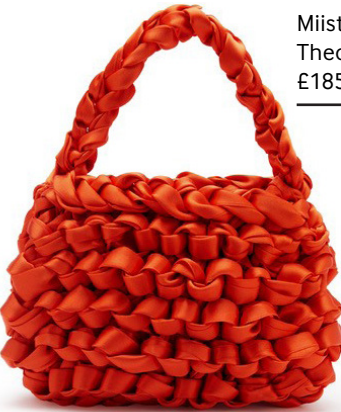
Miista Theodore Bag £185