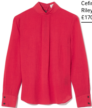
Cefinn Riley Blouse £170