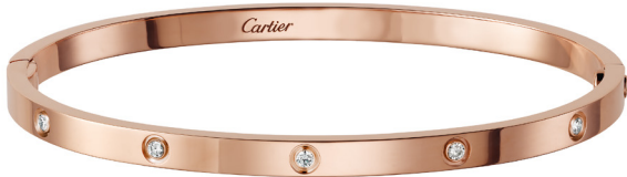
Cartier Love Bracelet in 18ct Gold with Diamonds £7,250