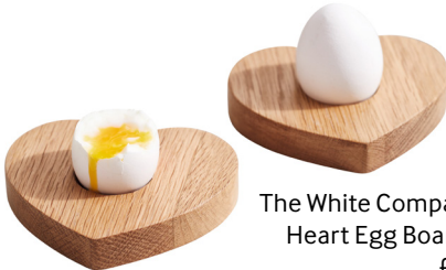
The White Company Heart Egg Board £8