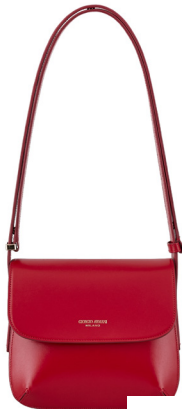
Giorgio Armani La Prima Red Bag £1,150