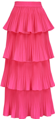
Essential Antwerp Vivian Skirt £190