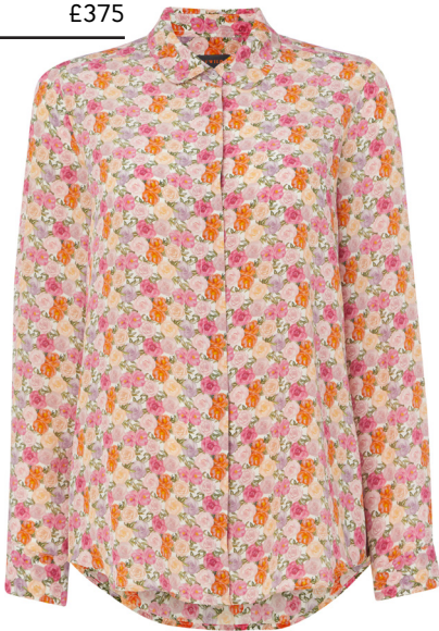
Really Wild Clothing Peter Pan Collar Shirt in Pink Roses £375