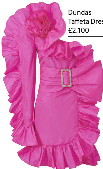
Dundas Taffeta Dress £2,100