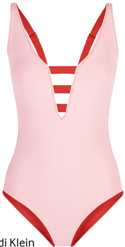
Heidi Klein BB Reversible V One Piece in Red & Pink £140