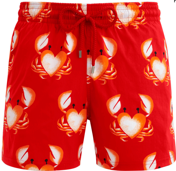
Vilebrequin St Valentine Swimming Shorts £210