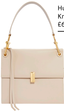
Hugo Boss Kristin Shoulder Bag £695