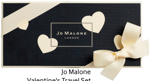
Jo Malone Valentine's Travel Set £69