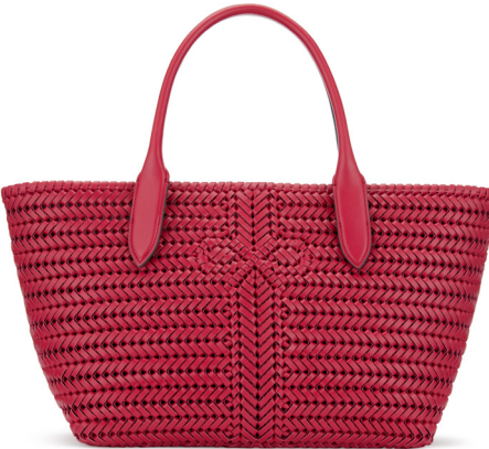
Anya Hindmarch Neeson Tote in Carmine £975