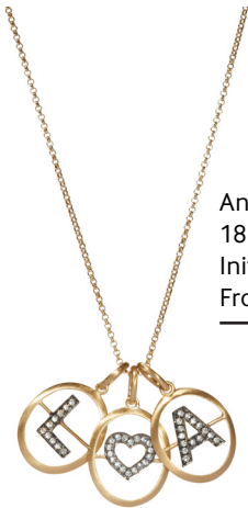
Annoushka 18ct Yellow Gold & Diamond Initial Pendant From £495