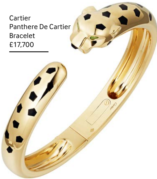
Cartier Panthere De Cartier Bracelet £17,700