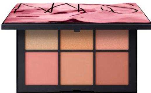
NARS Overlust Cheek Palette £46