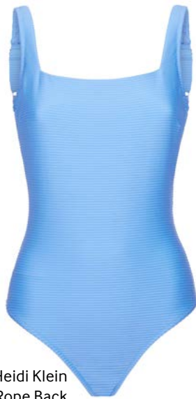
Heidi Klein Cairns Rope Back One Piece £240