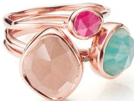
Monica Vinader Siren Stacking Ring Set £235