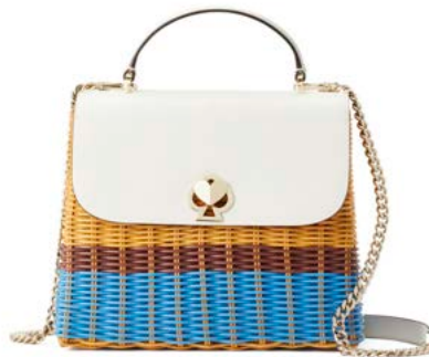
Kate Spade Romy Wicker Medium Satchel £350