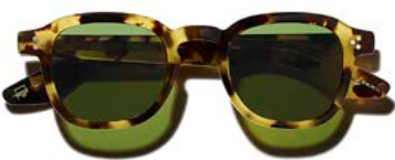
Moscot Momza Sunglasses in Heritage Tortoise £265