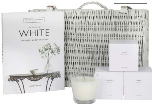
The White Company Book Hamper £120