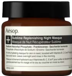
Aesop Skin Sublime Replenishing Night Masque 60ml £93