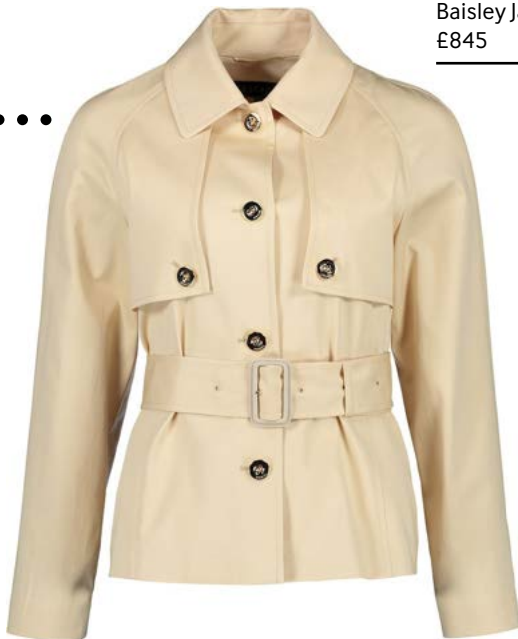
Escada Baisley Jacket £845