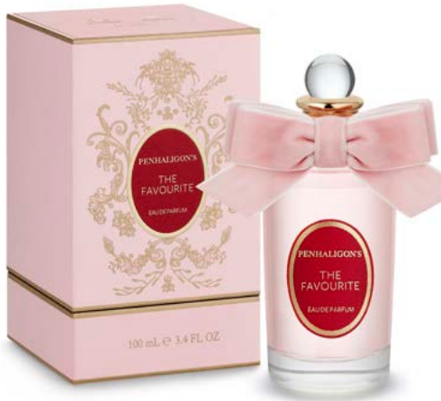
Penhaligon's The Favourite £144