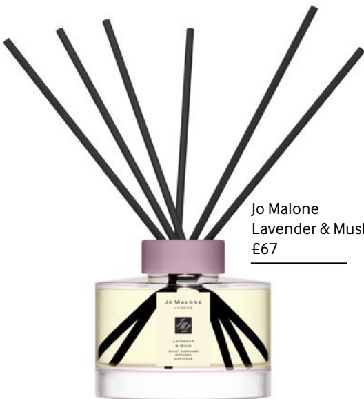
Jo Malone Lavender & Musk Diffuser £67