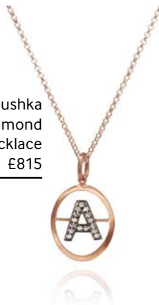
Annoushka 18ct Rose Gold & Diamond Initial Necklace £815