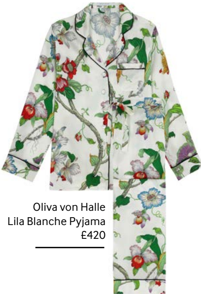
Oliva von Halle Lila Blanche Pyjama £420