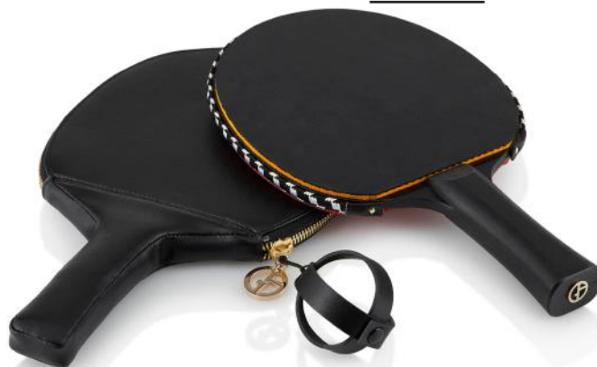
Armani Casa Plage Ping Pong Racket with Ball £432