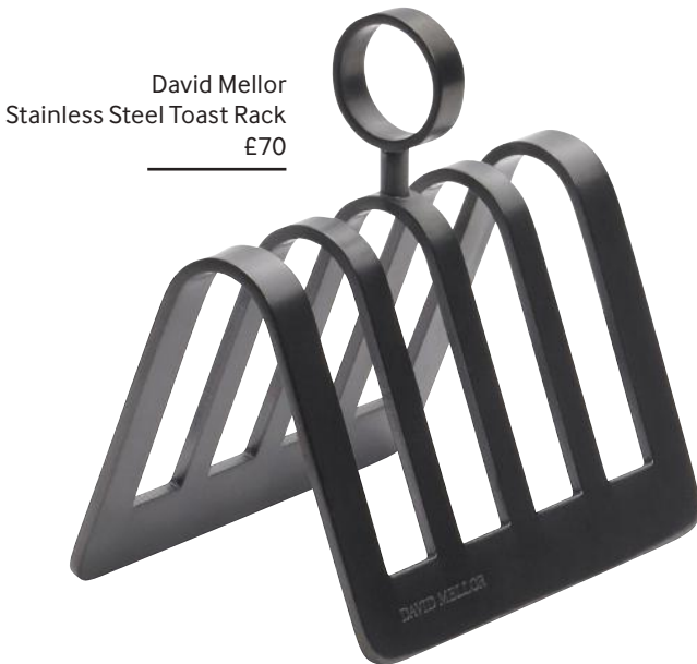
David Mellor Stainless Steel Toast Rack £70