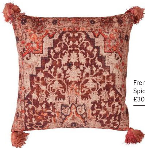
French Connection Spiced Bloom Cushion £30