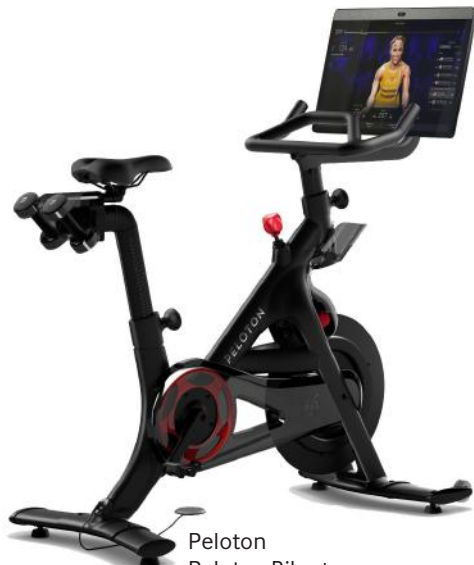
Peloton Peloton Bike + From £2,295