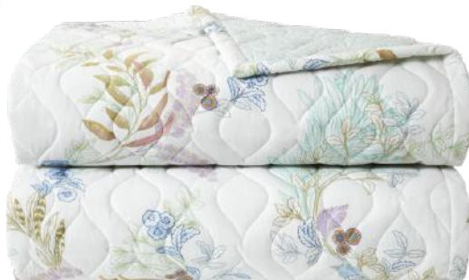
Yves Delorme Caliope Bedcover £499