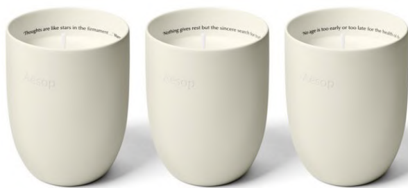
Aesop Aromatique Candles £80 each