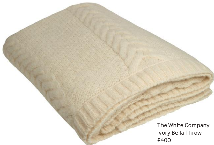
The White Company Ivory Bella Throw £400