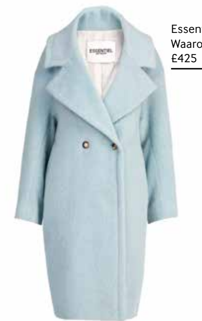
Essential Antwerp Waaromnie Coat