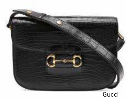
Horsebit 1955 Crocodile Shoulder Bag £16,750

Hayley Menzies Enchanted Leopard Cotton Duster