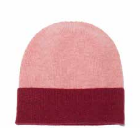
French Conncection Kahlo Colour Block Beanie Hat £35