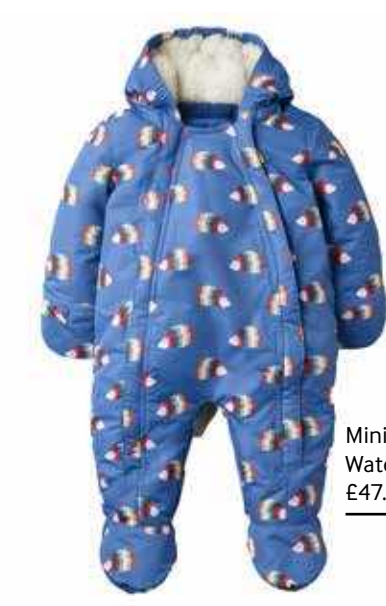
Mini Boden Waterproof Snowsuit £47.50