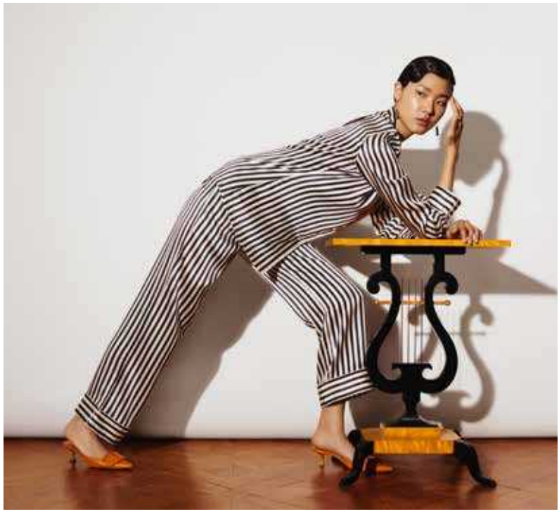
Find her latest collection in store at 190 Pavilion Road, London, SW3 2BF

18 Cadogan Concierge Cadogan Concierge 19