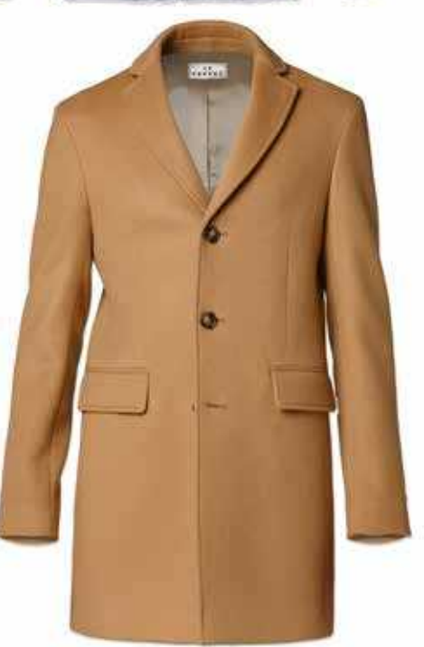
De Fursac Coat £595