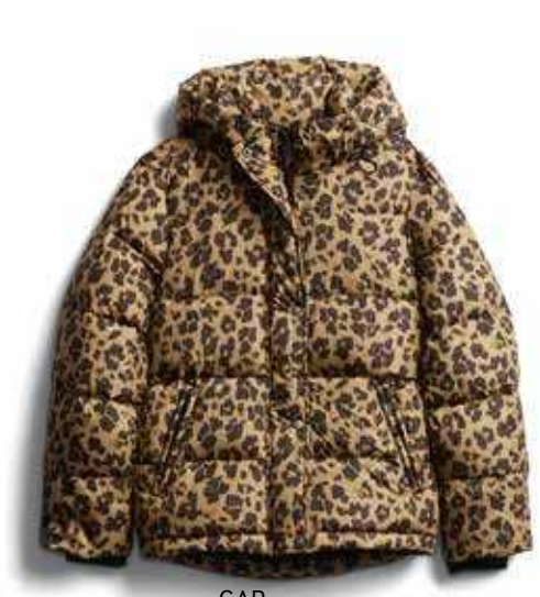
Upcycled Puffer in Leopard Print £99.95