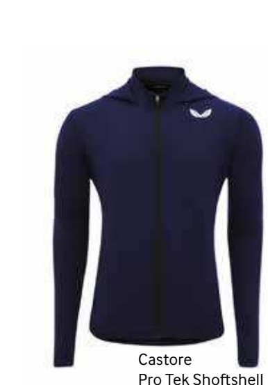
Pro Tek Shoftshell Jacket £95