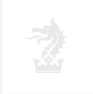
Duke of York Square Helpdesk