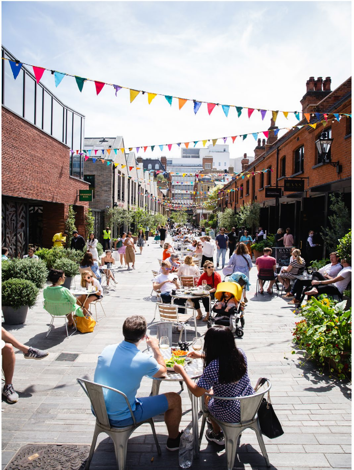
Al fresco dining on Pavilion Road in the sunshine