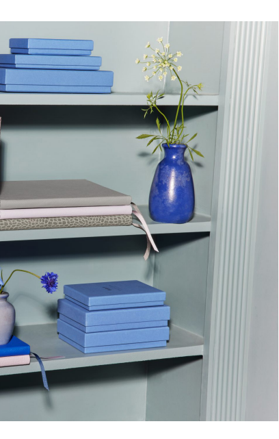
tsmanship in Ires

nbroidered panels, crafted with a modern idery technique. ..com, no booking necessary.