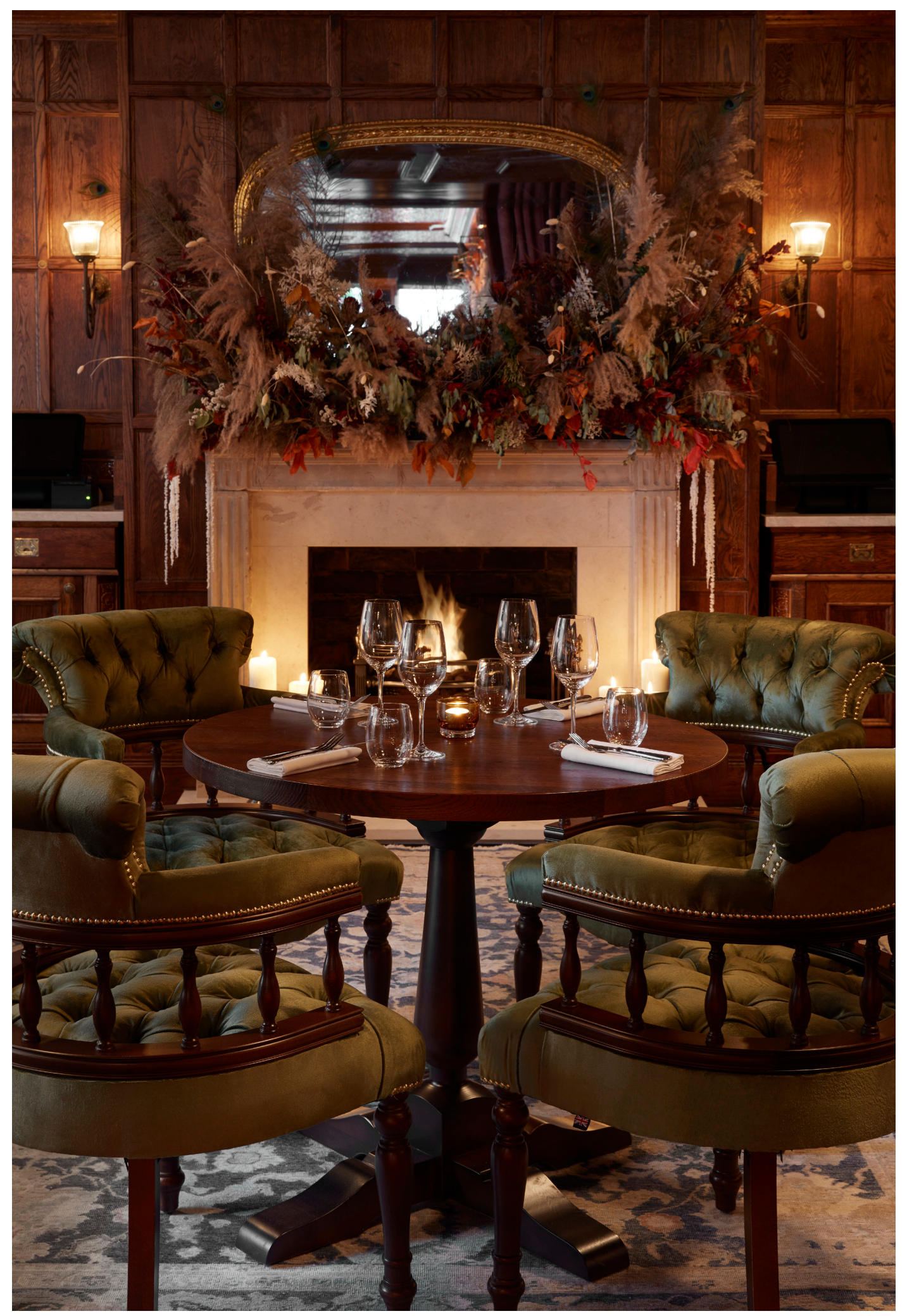
The Cadogan Arms, 298 King's Road