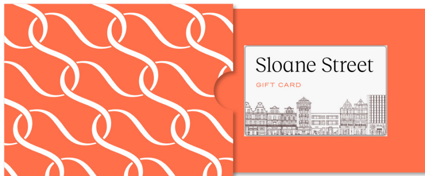
Sloane Street Gift Card via sloanestreet.co.uk up to £500