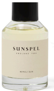
SunspeL Neroli Sun Eau de Parfum £90