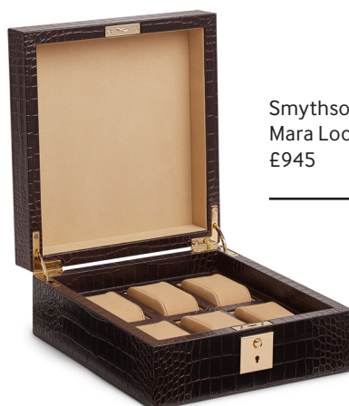
Smythson Mara Lockable Watch Box £945