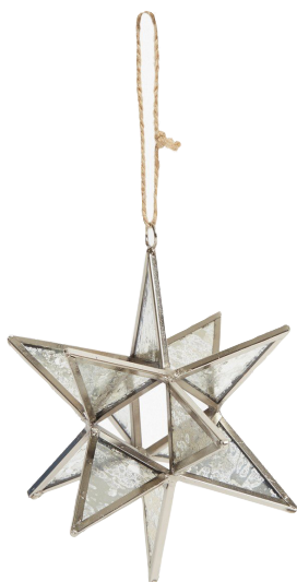
French Connection Nebula Silver Star £15