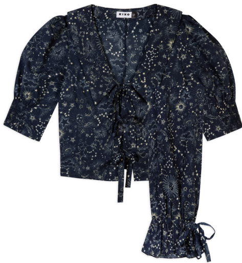
RIXO Odessa Set in Starry Nights Midnight £150