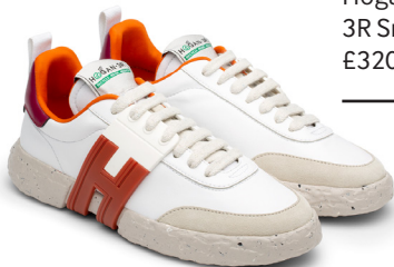
Hogan 3R Sneakers £320