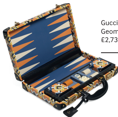
Gucci Geometric G Print Backgammon Set £2,730