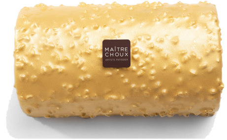
Maitre Choux Yule Log £55