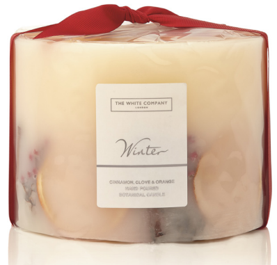
The White Company Winter Botanical Large Pillar Candle £38