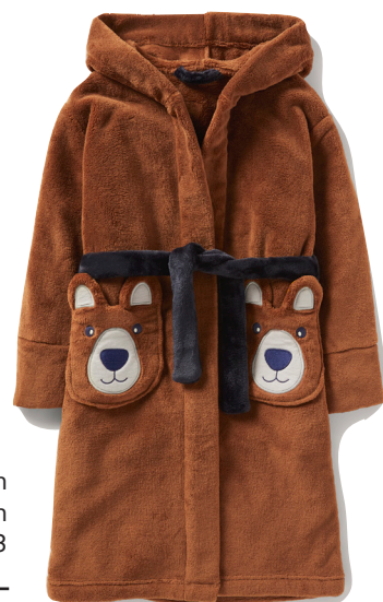
Mini Boden Cosy Dressing Gown £29-£33