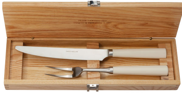
David Mellor Pride Carving Set £129.00