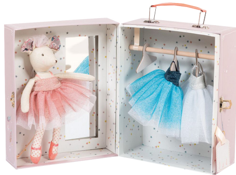
Trotters Moulin Roty Once Upon A Time Ballerina Mouse with Suitcase £60