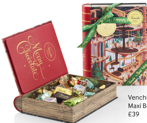
Venchi Maxi Book Tin Christmas Chocolates £39