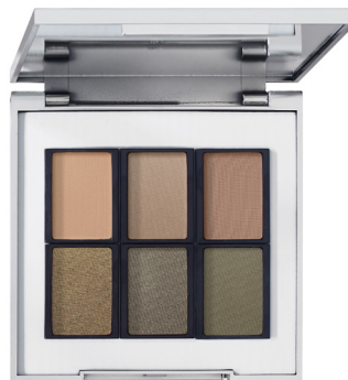
Cosmetics a la Carte Town & Country Eyeshadow Palette £60