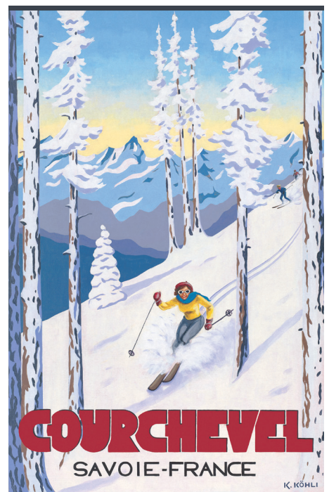
Pullman Editions Courchevel - Last Run Down Poster £420