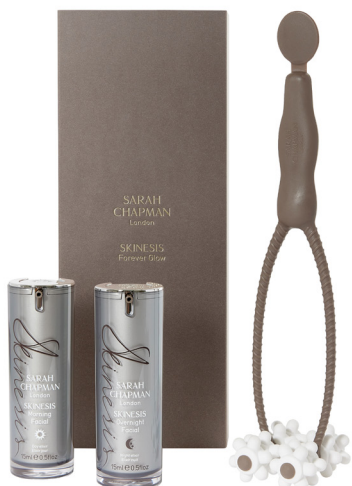
Sarah Chapman Forever Glow Set £120