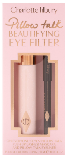
Space NK Charlotte Tilbury Pillow Talk Beautifying Eye Filter £23