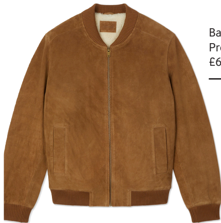
Balibaris Prosper Jacket £695