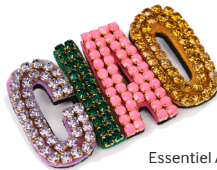
Essentiel Antwerp Hair clip £65