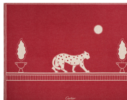
Cartier Panthere de Cartier Blanket in Merino Wool and Cashmere £1060