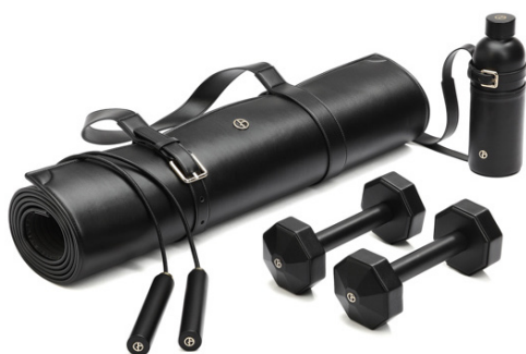
Armani Casa Fitness Pump Set £2,370