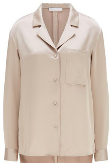
BOSS Relaxed Fit Blouse in Satin £189