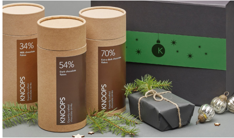
Knoops Classic Hot Chocolate Collection £34