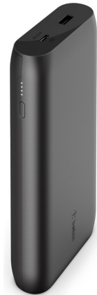
Haines Power Bank £14.99