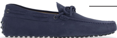
Tod's Men's Gommino £390