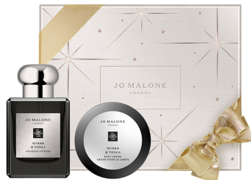
Jo Malone London Myrrh & Tonka Collection £108