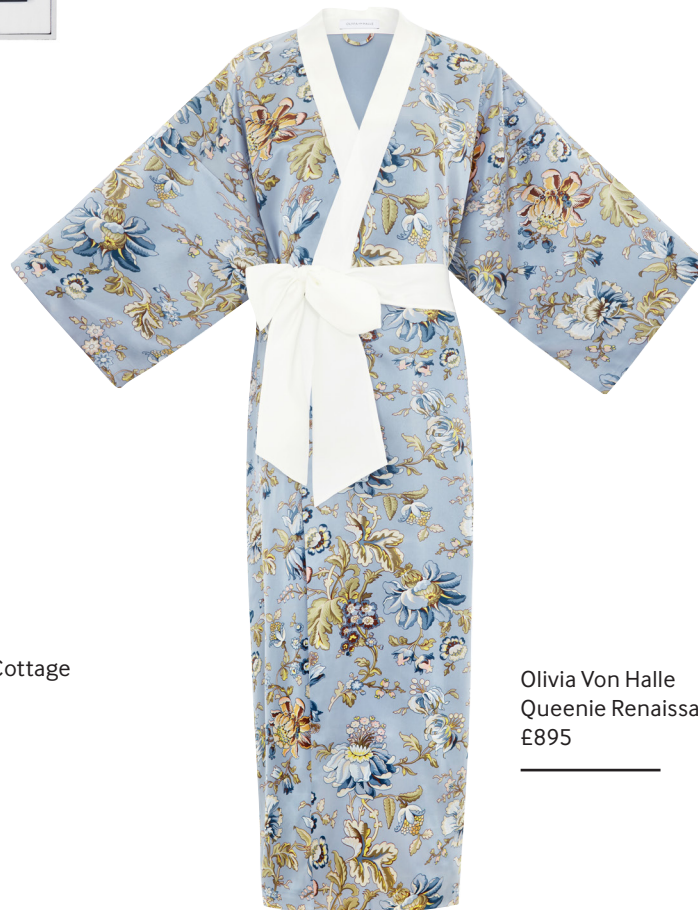
Olivia Von Halle Queenie Renaissance £895