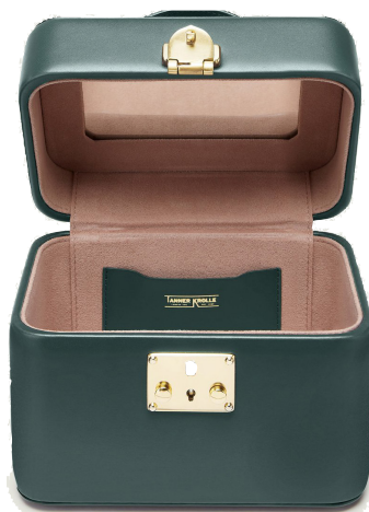
Tanner Krolle Annabel 18 Vanity Case £1550