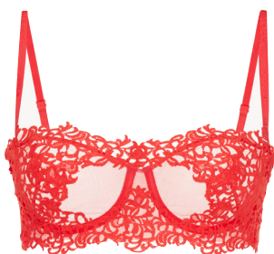
La Perla Red Underwired Bra £440