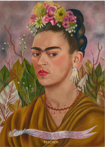
Taschen Frida Kahlo. The Complete Paintings £150