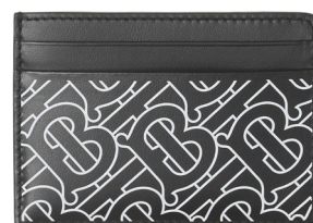
Burberry Monogram Print Leather Card Case £220