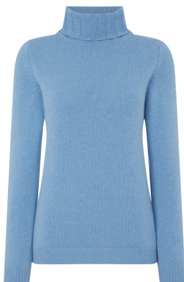
Really Wild Cashmere Roll Neck in Light blue £395