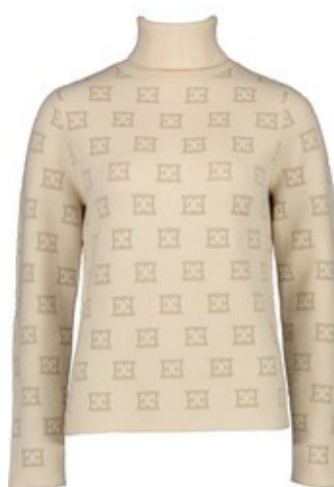
Escada Jumper £745