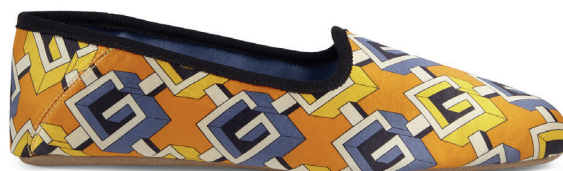
Gucci Men's £400