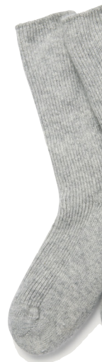
The White Company Silver Grey Cashmere Bed Socks £36