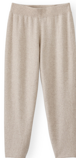
Poetry Cashmere Trousers £259