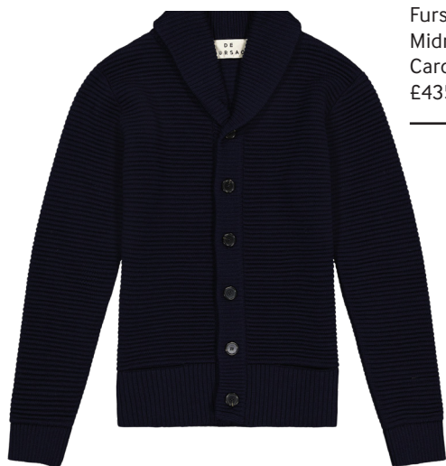
Fursac Midnight Blue Merino Wool Cardigan £435