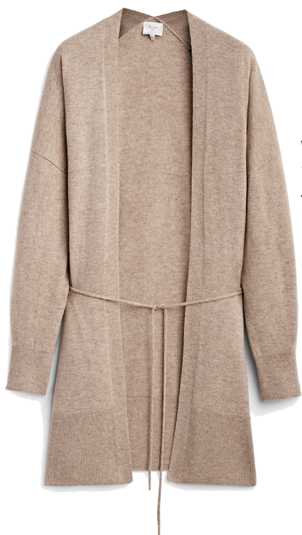
Massimo Dutti Wool & Cashmere Cardigan £149