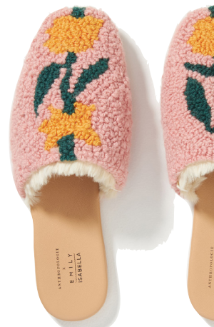
Anthropologie Emily Isabella Floral Slippers £110