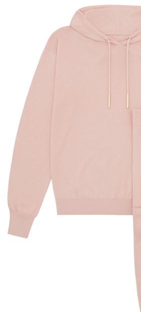
Olivia Von Halle Gia Lamu Silk Cashmere Tracksuit £1,195