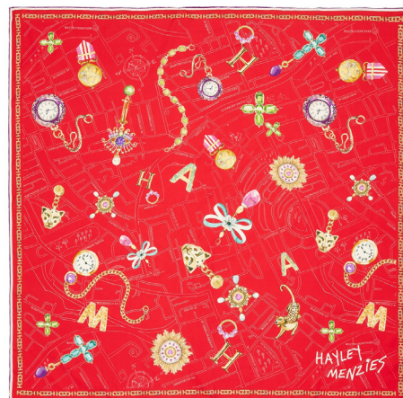
Hayley Menzies Forever Portobello Silk Square Scarf £120