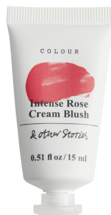
& Other Stories Intense Rose Cream Blush £15