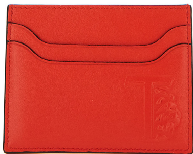
Tod's Credit Card Holder £180