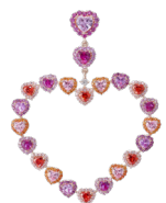
Anabela Chan Ruby Love Heart Earrings £1,790