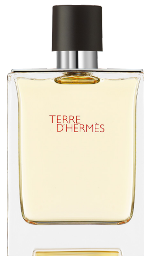
Hermes Terre d'Hermes Parfum £94-174