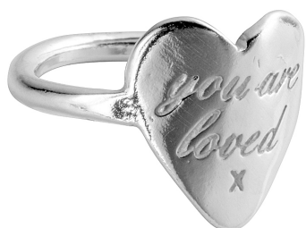
Daniella Draper You Are Loved Ring £95