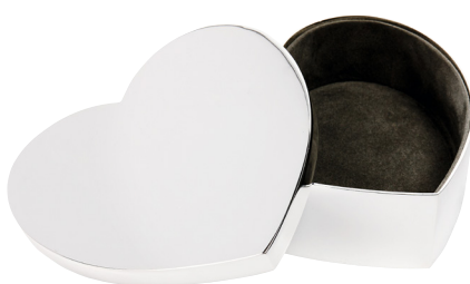
The White Company Silver Plated Heart Box £38