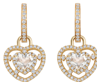
Kiki McDonough Lovestruck Topaz and Diamond Earrings £2,400