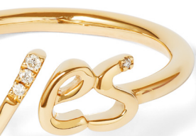
Annoushka Yes Ring £1,200