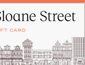
Sloane Street Gift Card Value up to £500 (sloanestreet.co.uk)