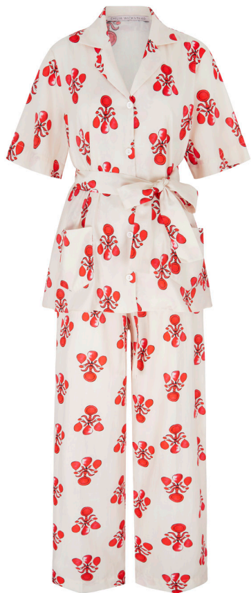
Emilia Wickstead Fifi Pyjama Set £450