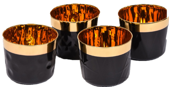
Fiona Finds Set of 4 Sip of Gold Goblets £800

Our gift suggestions to spoil him this Valentine's Day