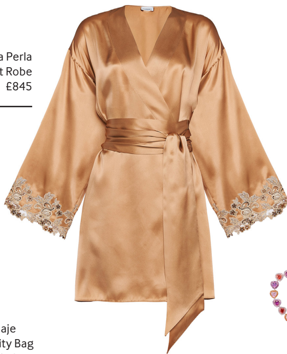
La Perla 'Maison Metallic' Silk Satin Short Robe £845