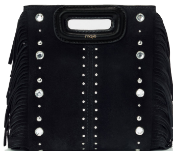
Maje City Bag £249