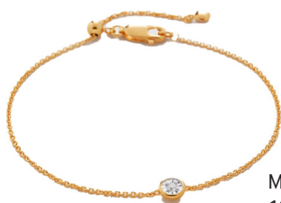
Monica Vinader 18ct Gold Vermeil Diamond Bracelet £150