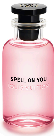
Louis Vuitton Spell On You Eau de Parfum £200