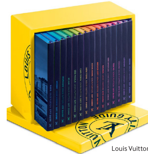
Louis Vuitton 15 City Guide Box Set £500