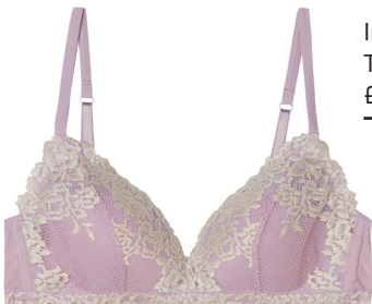
Intimissimi Tiziana Pretty Flower Triangle Bra £39