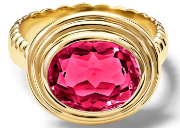
Cassandra Goad Whirlpool II Rhodolite Garnet Ring, From £2,985