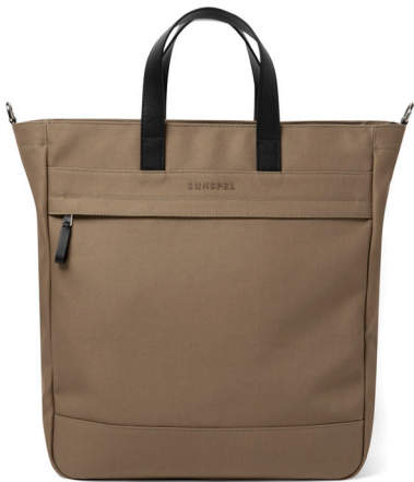
Sunspel Travel Tote £325