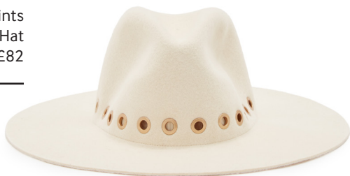
All Saints Whitley Eyelet Wool Fedora Hat £82