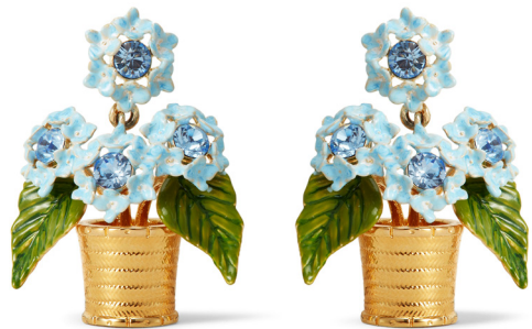
Les Nereides Hydrangea Pot Earrings £125

LUXURY • ACCESSORIES • PERSONAL SHOPPING • EXPERIENCES