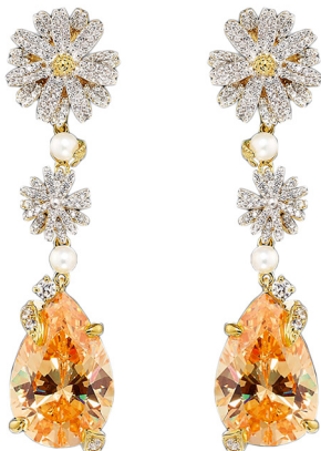
Anabela Chan Citrine Daisy Drop Earrings £1,520