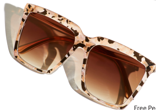
Free People Ocean Drive Sunglasses £18