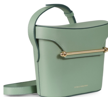
Strathberry Safari Bag £395