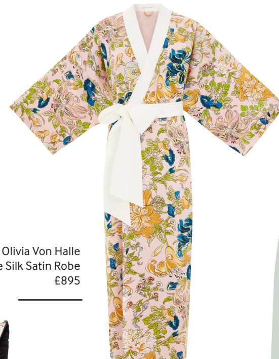
Olivia Von Halle Queenie Pixie Silk Satin Robe £895