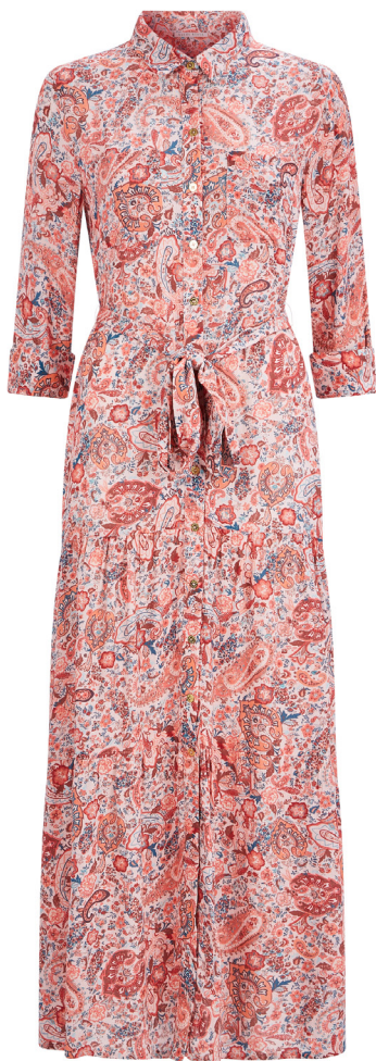
Heidi Klein Maxi Shirt Dress £390

Have your most stylish weekend getaway yet with our ultimate city break essentials.