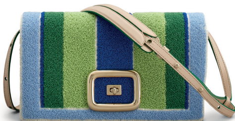
Roger Vivier Viv' Choc Summertime Bag £2,350