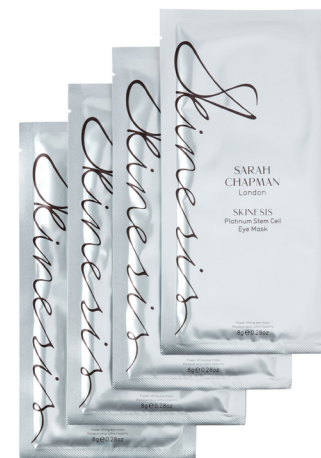
Sarah Chapman Platinum Stem Cell Eye Mask £78