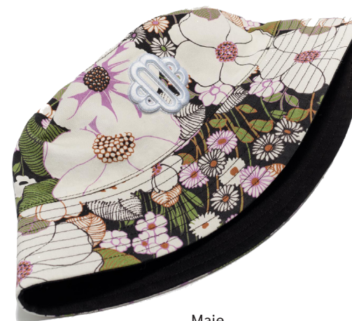
Maje 70's Floral Print Sun Hat £99