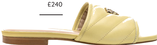
Pinko Nappa Slip-ons £240