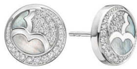
Boodles Air Mother of Pearl Earrings £3,000

Whether a seaside staycation, a stylish city-break, or island-hopping around the Med, shop your suitcase essentials.