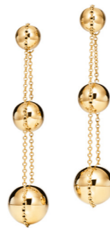
Tiffany & Co. Triple Drop Earrings £3275