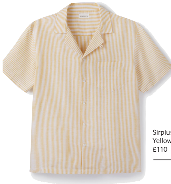
Sirplus Yellow Striped Linen Cotton Cuban Shirt £110