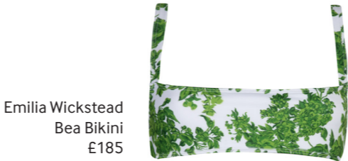
Emilia Wickstead Bea Bikini £185