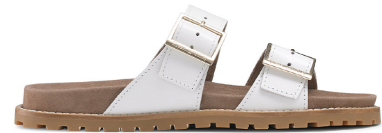
Russell & Bromley Buckle Up £195