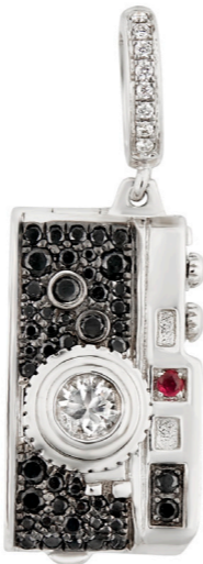
Annoushka 18ct White Gold Diamond Camera Charm £3,500