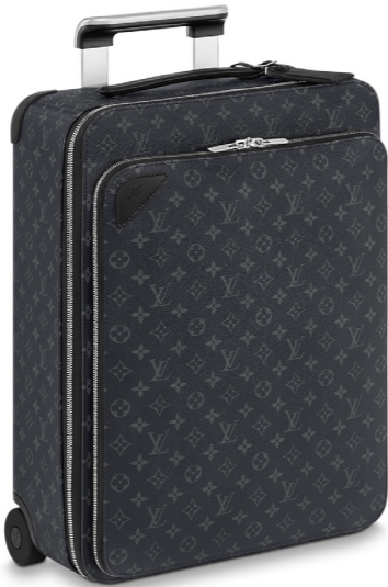
Louis Vuitton Pegase Trolley Case £2,140