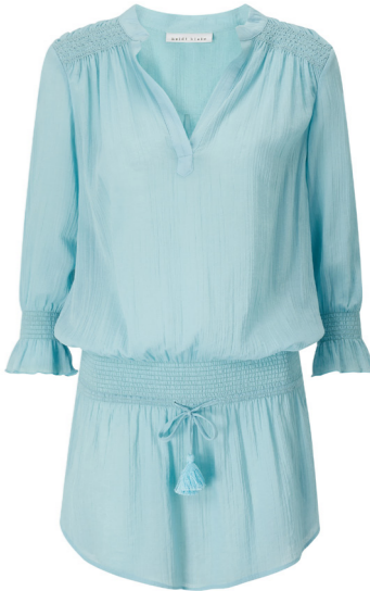
Heidi Klein Azure Waters Smocked Tunic £220