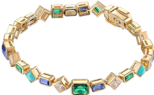
Anabela Chan Deco Bracelet £1590