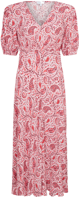
Ghost Petra Dress £129