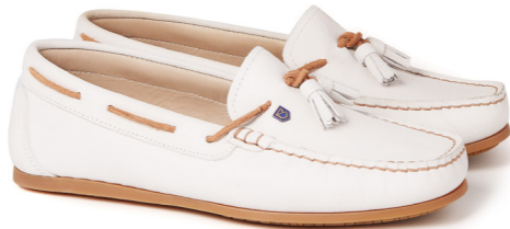
Dubarry Jamaica Loafer £129