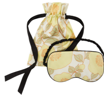
Olivia Von Halle Rafaella Silk Satin Eye Mask £85