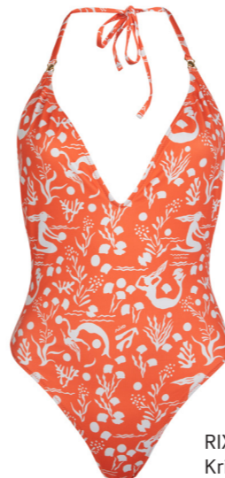
RIXO Kristen Swimsuit Sealife Coral Cream £125