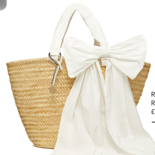
REDValentino Raffia Tote £265