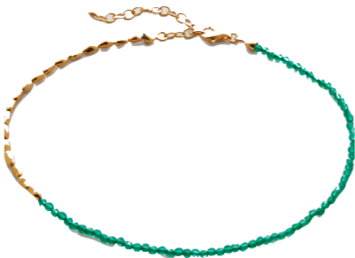
Monica Vinader Mini Nugget Gemstone Beaded Anklet £80