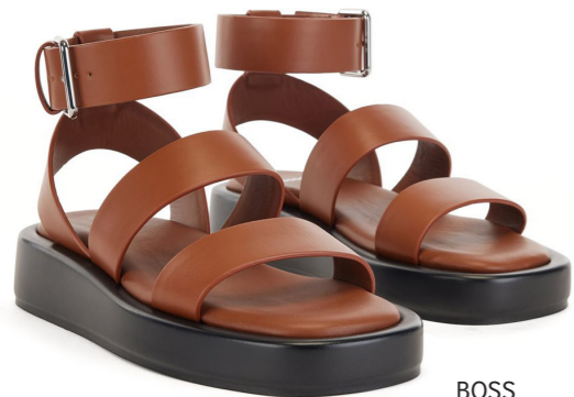
BOSS Italian Leather Sandals £199