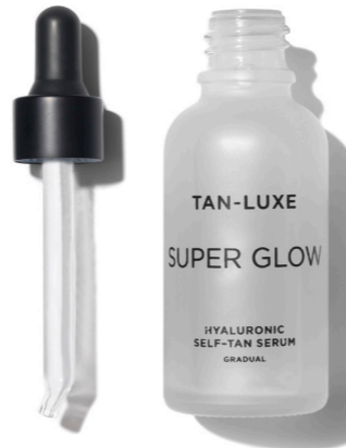
Space NK Tan Luxe Super Glow £36