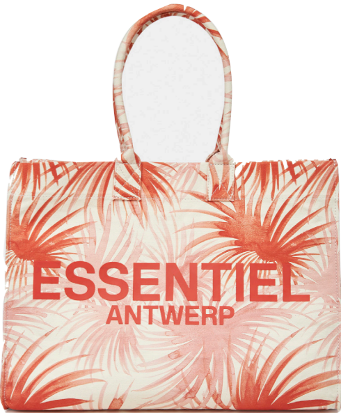
Essentiel Antwerp Barosi Bag £145