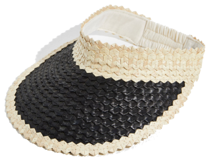
Free People Banded Baha Straw Visor £38