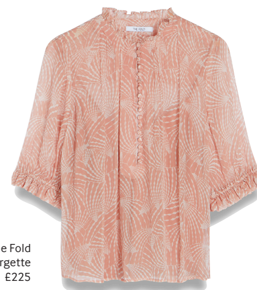
The Fold Tierney Blouse Silk Georgette £225