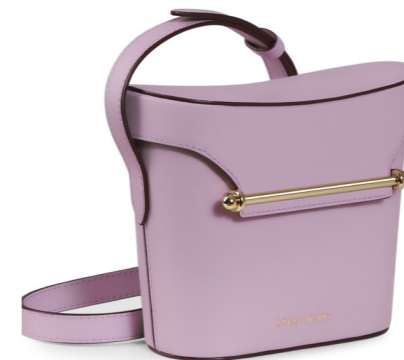
Strathberry Safari Bag £395