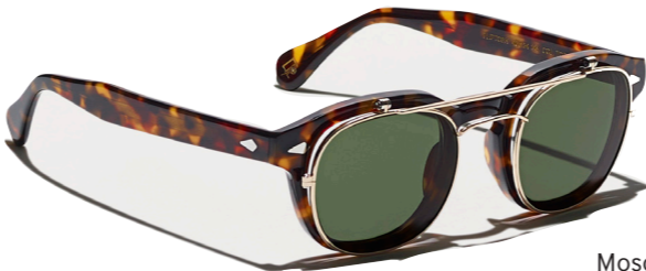
Moscot Fliptosh Tortoise £360