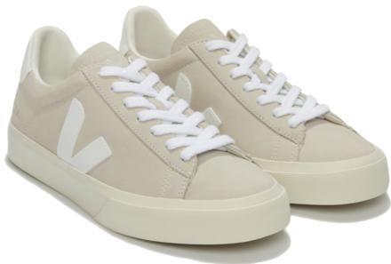
The White Company Veja Campo Trainers £120