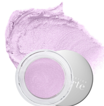
Cosmetics a la Carte Luminous Cream Shadow £30