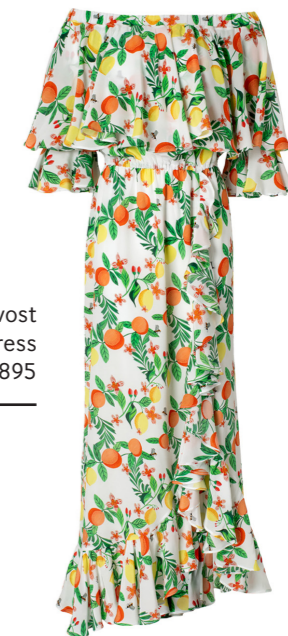
Catherine Prevost Lolita Dress £895