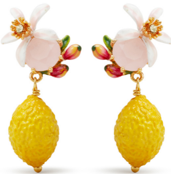
Les Nereides Lovely Lemon Earrings £145