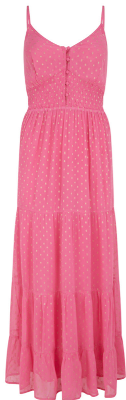
Anthropologie Lurex Lattice Back Dress £148