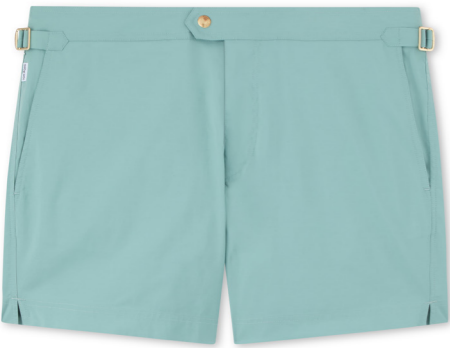
Tom Ford Nylon Swim Shorts £285