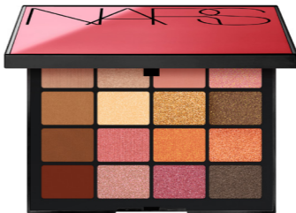
NARS Summer Unrated Eyeshadow Palette £50