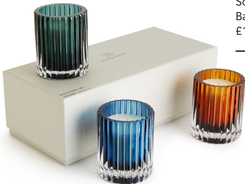
Soho Home Barlow Discovery Set £105