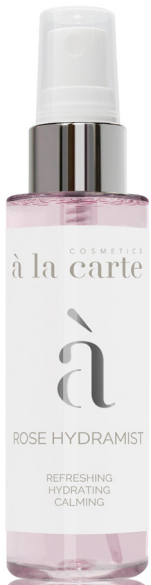
Cosmetics a la Carte Rose Hydramist £30