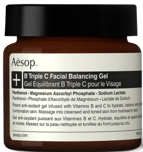
Aesop B Triple C Facial Balancing Gel £89