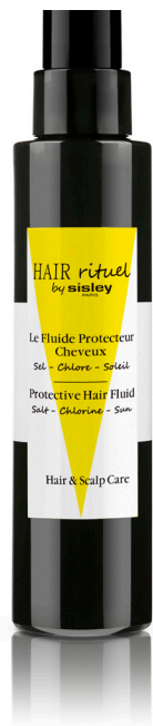
Salon Sloane Fluide Protecteur £73