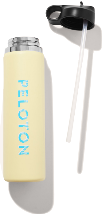
Peloton Hydroflask £38