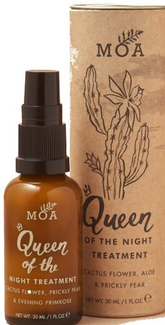
Anthropologie Queen of the Night Treatment £35