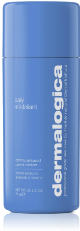
Dermalogica Daily Milkfoliant £59