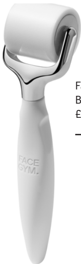
Face Gym Brightening Active Roller £55