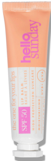
Space NK Hello Sunday SPF 50 Lipbalm £5