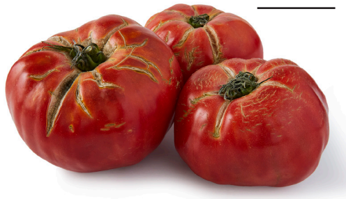
Natoora Cuore del Vesuvio Tomatoes Price per kg