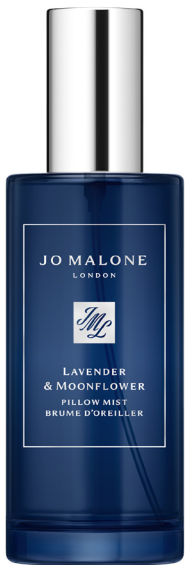
Jo Malone London Lavender & Moonflower Pillow Mist £32