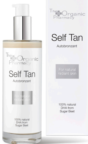
The Organic Pharmacy Self Tan £38