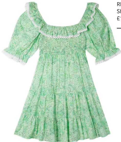
RIXO Short Tiered Nightdress £165