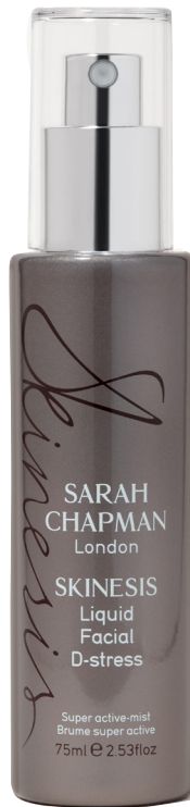
Sarah Chapman Liquid Facial D-Stress £48