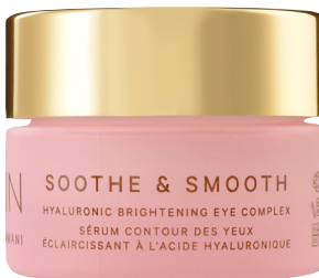
MZ Skin Soothe & Smooth £95