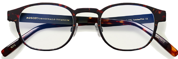
Moscot Lemtosh Tort Blue Light Filter £165