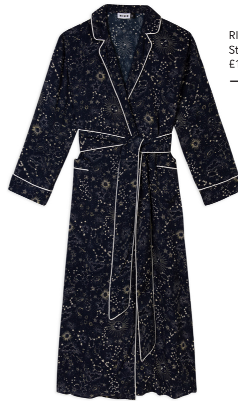
RIXO Starry Nights Dressing Gown £135