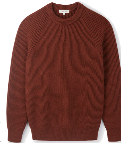
Sirplus Rust Merino Fisherman Rib Jumper £225