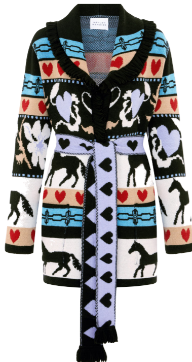
Hayley Menzies Annie Merino Jacquard Cardigan £480