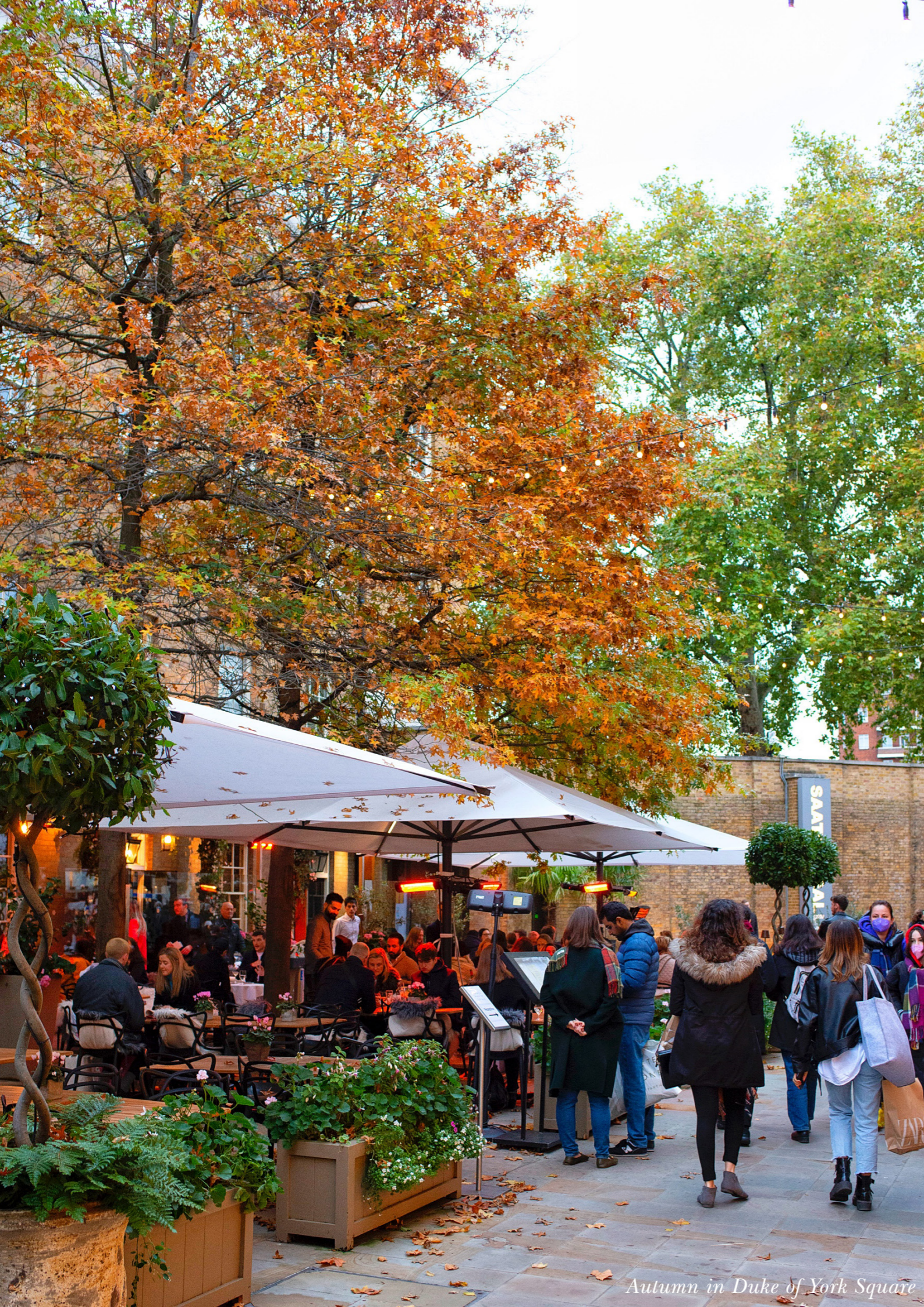
Autumn in Duke of York Square