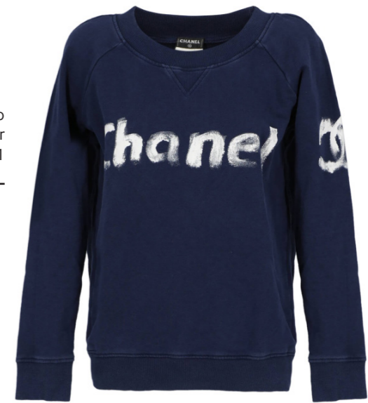
Lampoo Pre-loved Chanel Jumper £661