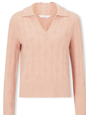
LK Bennett Orla Jumper in Soft Pink £199