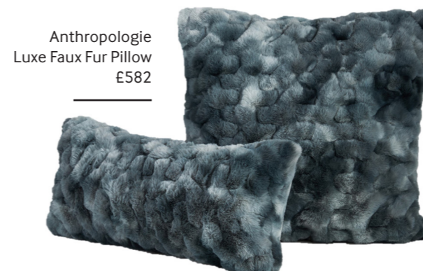
Anthropologie Luxe Faux Fur Pillow £582