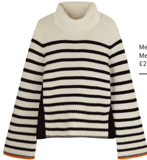
Me and Em Merino Cashmere Stripe Jumper £250