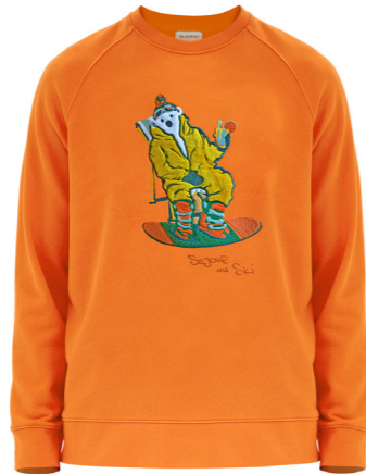
Bluemint Raphael Sweatshirt £130