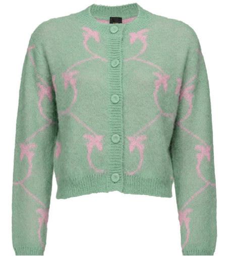
Pinko Monogram Jacquard Cardigan £269