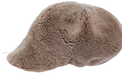
Really Wild Clothing Honey Shearling Baker Boy Cap £125