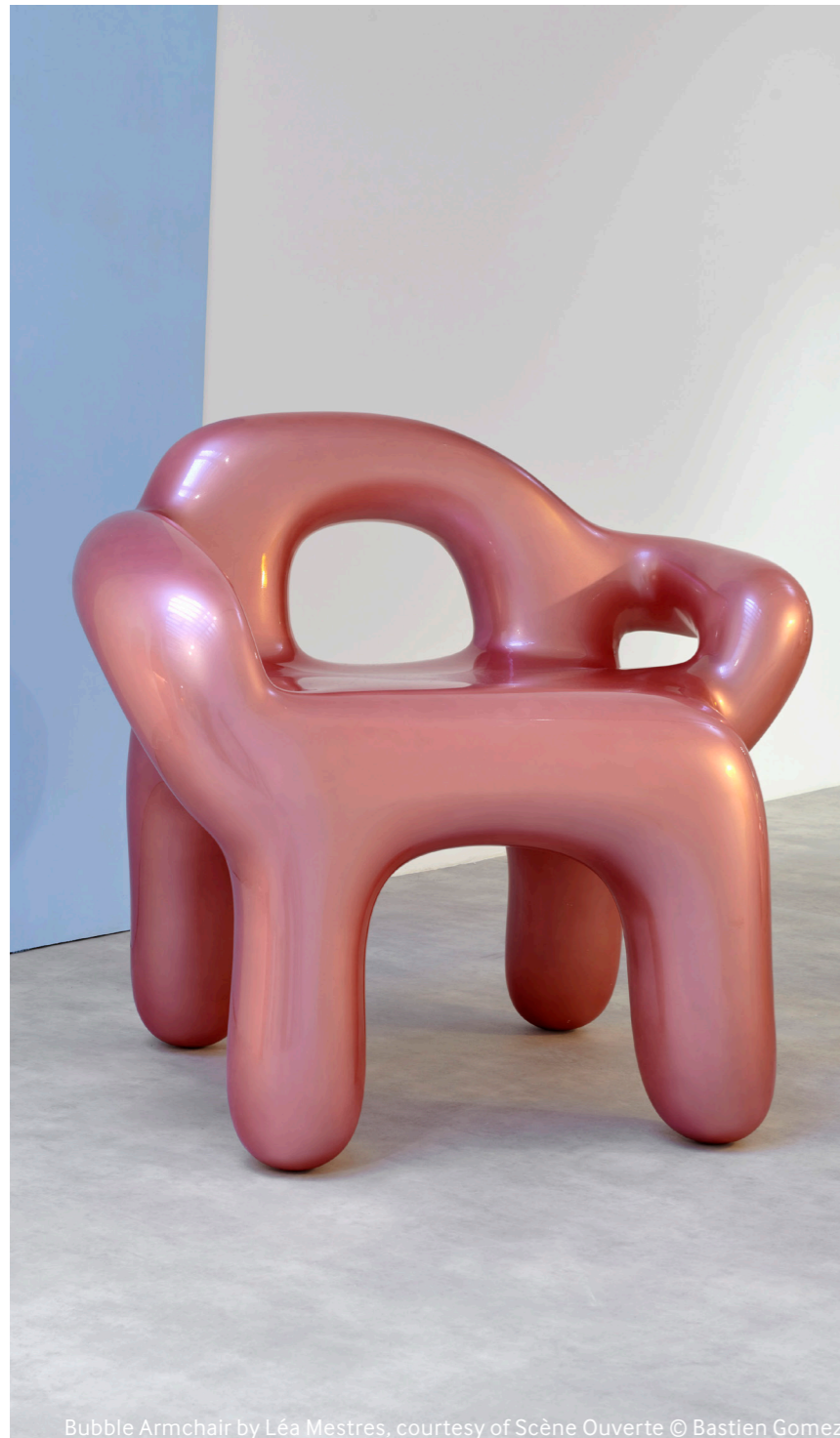
Bubble Armchair by Léa Mestres, courtesy of Scène Ouverte © Bastien Gomez