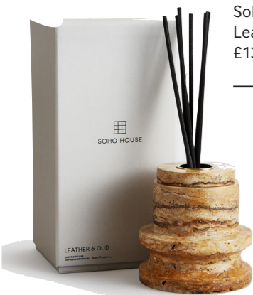
Soho Home Leather and Oud French Gold Marble Diffuser £130