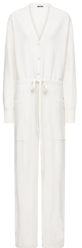
JOSEPH Cosy Wool Cashmere Jumpsuit £545