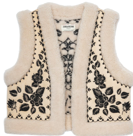
Zadig & Voltaire Feti Shearling Cardigan £1,040