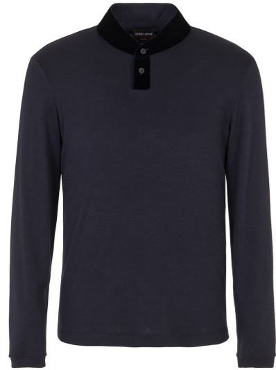
Giorgio Armani Cashmere and Velvet Polo £1,450

Stay warm this winter with our stylish edit.