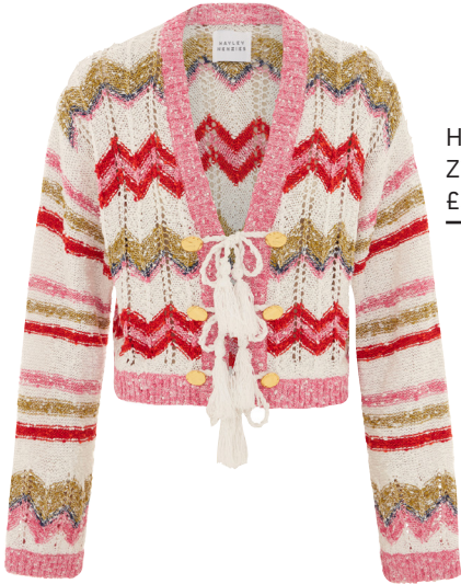
Hayley Menzies Zig-zag Boucle Cardigan White £320