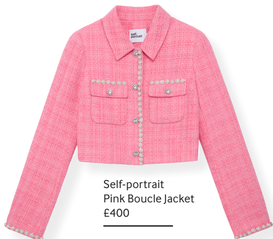
Self-portrait Pink Boucle Jacket £400