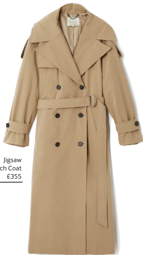
Jigsaw Oversized Cotton Trench Coat £355