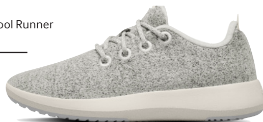
Allbirds Men's Wool Runner £120