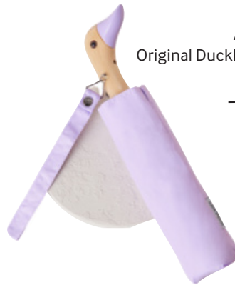
Anthropologie Original Duckhead Umbrella £36