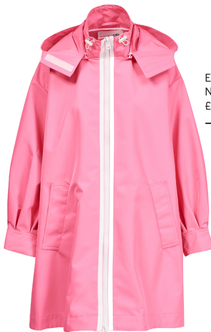
Essentiel Antwerp Neon Pink Oversized Hooded Raincoat £320