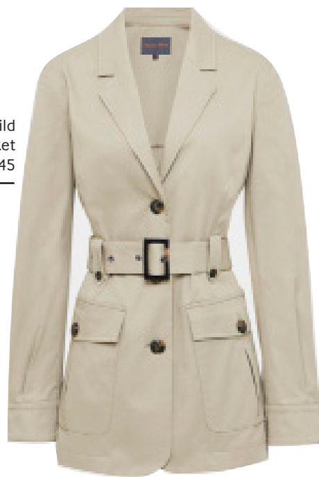
Really Wild Unlined Safari Belted Jacket £345