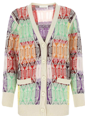
Chloe at Lampoo Oversized Cardigan £1,050