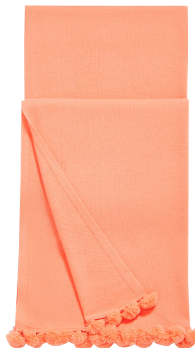
Heidi Klein Verbier Cashmere Scarf £210