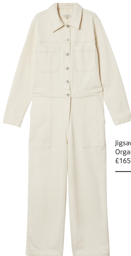
Jigsaw Organic Denim Jumpsuit £165