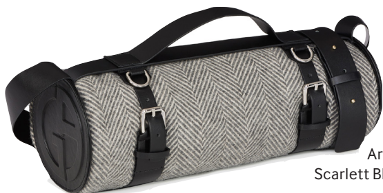
Armani Casa Scarlett Blanket Bag £785