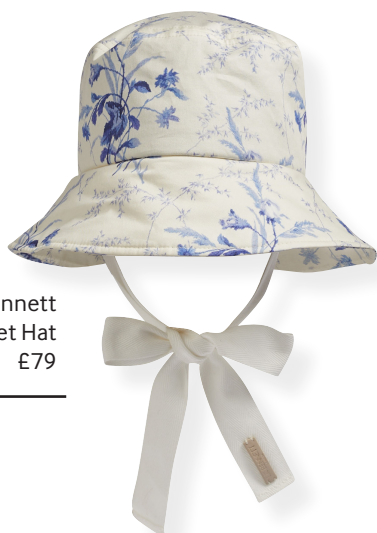
LK Bennett Blue and White Meadow Scene Bucket Hat £79