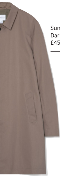
Sunspel Dark Stone Shower Proof Cotton Mac £450