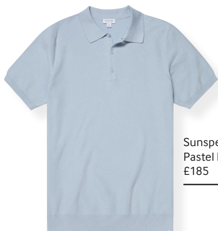
Sunspel Pastel Blue Knit Polo Shirt £185