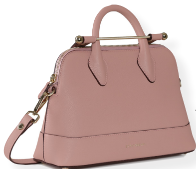
Strathberry Dome Midi Blush £595