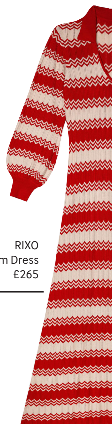
RIXO Piper Chevron Coral Cream Dress £265