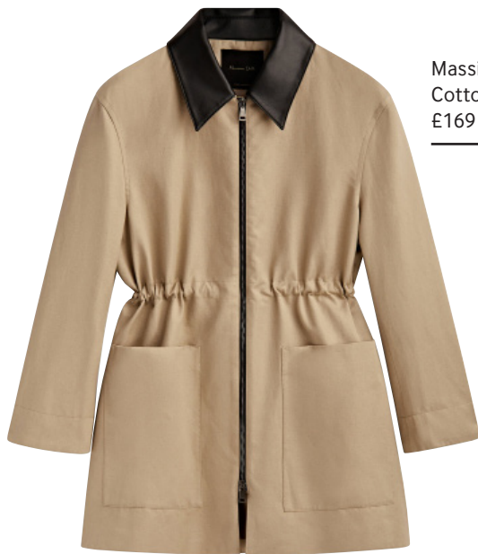
Massimo Dutti Cotton Blend Parka With Contrast Collar £169

Staying stylish whilst surviving spring showers.