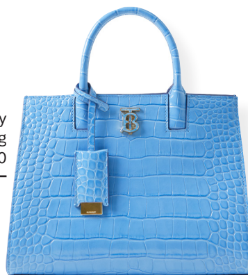
Burberry Mini Frances Bag £1,850