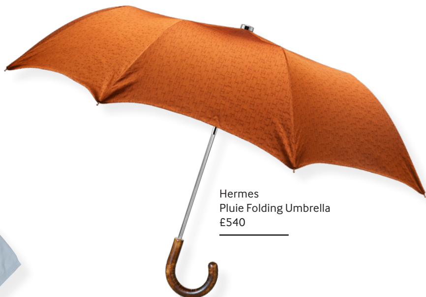
Hermes Pluie Folding Umbrella £540