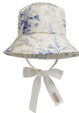
LK Bennett Florian Multi Fabric Bonnet £79