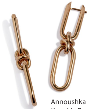
Annoushka Knuckle Double Link Hoop Earrings £2,500