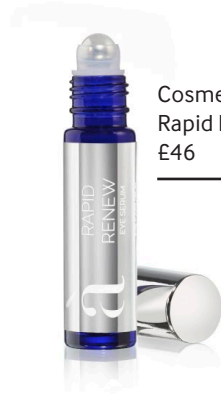
Cosmetics à la Carte Rapid Renew Eye Serum £46