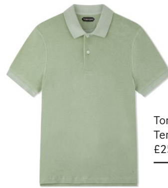
Tom Ford Tennis Piquet Polo £250