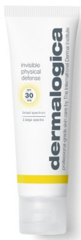
Dermalogica Invisible Physical £49