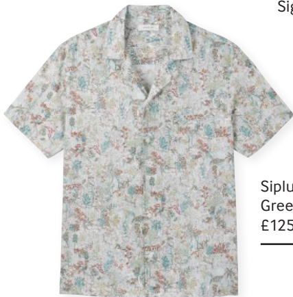
Siplus Green Plantopolis Cuban Shirt £125