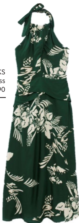
IKKS Green Jungle Vibe Backless Dress £290