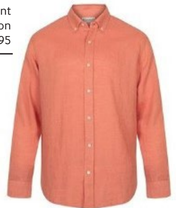
Bluemint Martin Shirt in Crimson £95