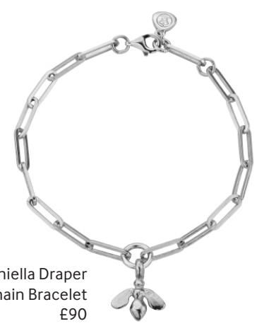
Daniella Draper Silver Mini Honey Bee Trace Chain Bracelet £90