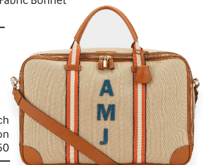
Anya Hindmarch Bespoke Walton £1,150