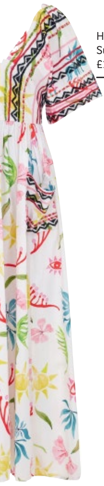
Hayley Menzies Sun Wink Embellished Kimono Sleeve Cotton Maxi Dress Flower £235 (July Sale Price)