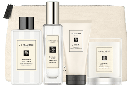
Jo Malone London Little Luxuries Travel Kit £112