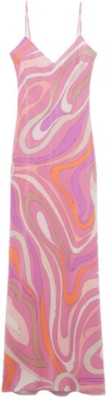
Pucci Marmo Print Silk Dress £810