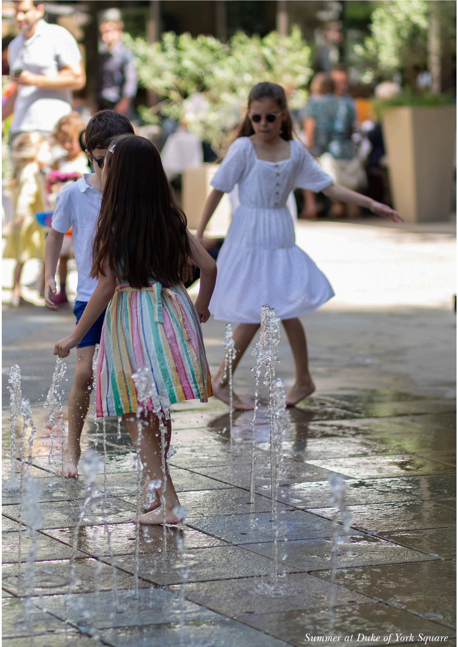
Summer at Duke of York Square