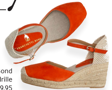
Franchetti Bond Berry Hot Orange Wedge Espadrille £ 139.95