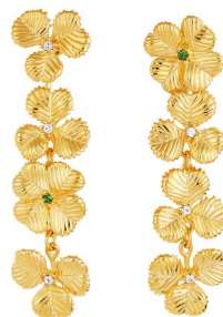
Les Néréides Lucky Clovers and Crystals Post Earrings £155