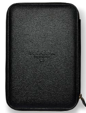
Moscot Travel Case £35