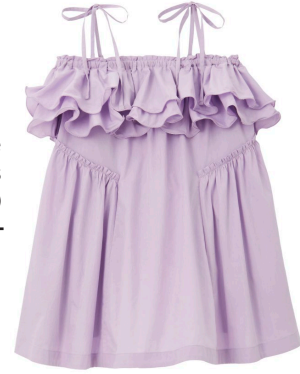
Free People Have A Thing For You Mini Dress £70