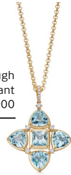
Kiki McDonough Signatures Square and Trilliant Blue Topaz and Diamond Pendant £2,900