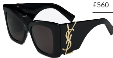
Yves Saint Laurent SL M119 Blaze £560