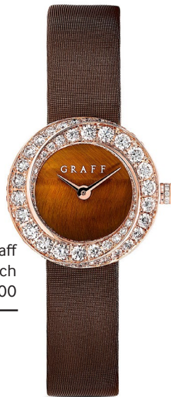
Graff Tigers Eye Dial Rose Gold, Brown Satin Strap Watch £25,000