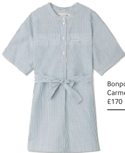
Bonpoint Carmel Dress £170