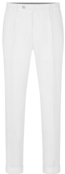
BOSS Men's Trousers in Linen £289

Stylish summer suitcase essentials to shop in Chelsea.