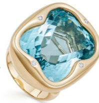
Kiki McDonough Jazz Blue Topaz and Diamond Detail Ring £5,900