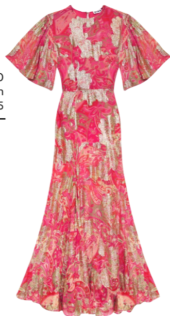
RIXO Dina Gold Paisley Gown £475