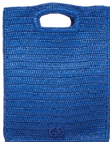
Giorgio Armani Woven raffia handbag £1,850