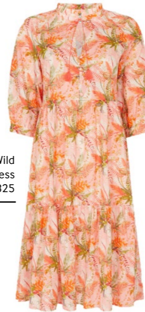
Really Wild Liberty Print Cotton Midi Dress £325