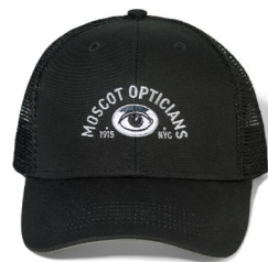
Moscot Snapback Cap £35