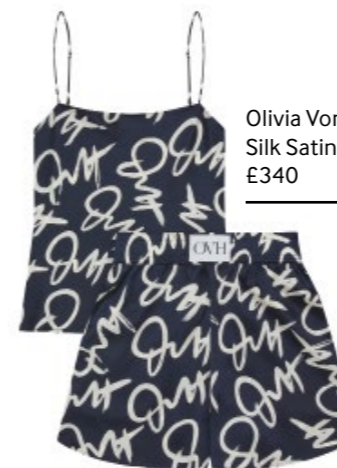
Olivia Von Halle Silk Satin Camisole Set £340