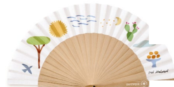
Diptyque Ilio Ready-to-Perfume Fan £145