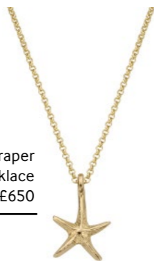
Daniella Draper Gold Starfish Necklace £650