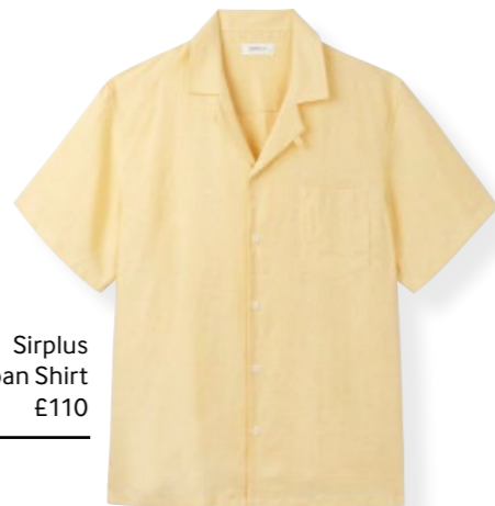
Sirplus Cornfield Yellow Linen Cuban Shirt £110