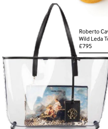
Roberto Cavalli Wild Leda Tote Bag £795