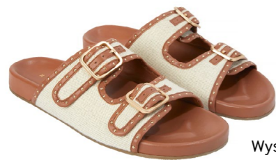
Wyse Buckle Strap Sandal £185