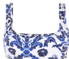
Emilia Wickstead Beatrix Bikini £355