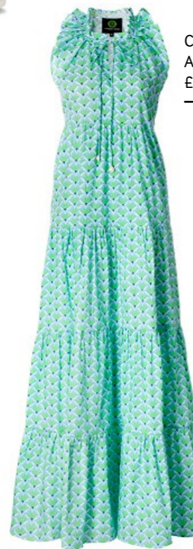
Catherine Prevost Athene Blooms Sky £550