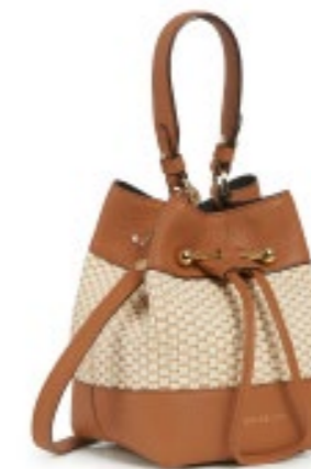
Strathberry Lana Osette Raffia Leather Chestnut Shoulder Bag £325