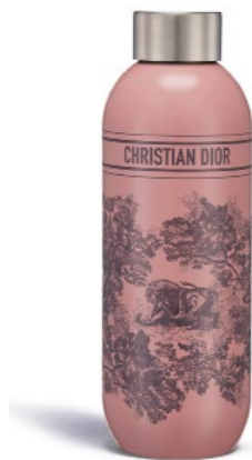
Christian Dior Pink and Gray Dioriviera Water Bottle £170