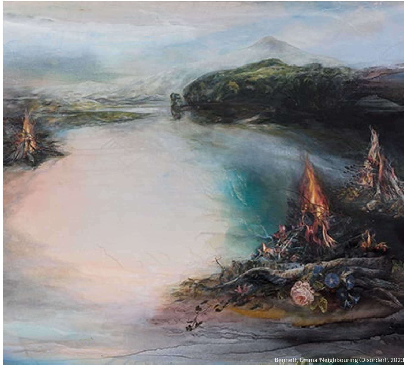
Bennett, Emma 'Neighbouring (Disorder)', 2023

MUSIC • ART • THEATRE • EXHIBITIONS • FOOD