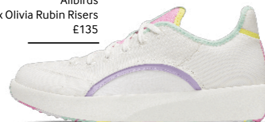
Allbirds Allbirds x Olivia Rubin Risers £135