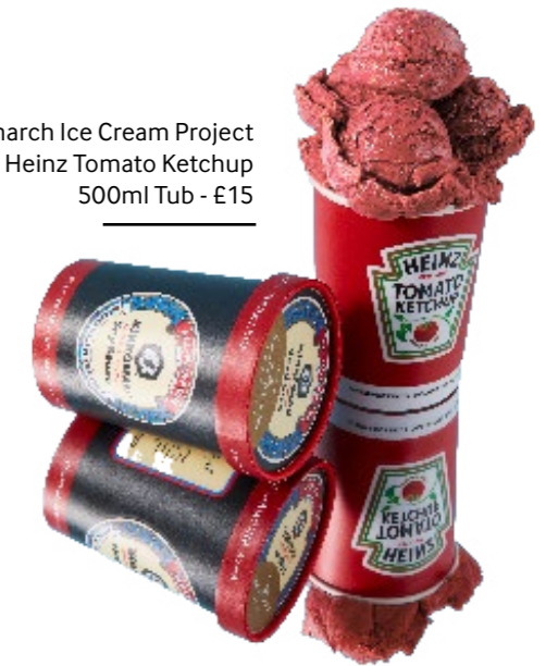
Anya Hindmarch Ice Cream Project Kikkoman Soy Sauce & Heinz Tomato Ketchup 500ml Tub - £15