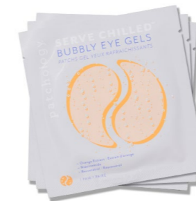
Space NK Patchology Eye Gels £14