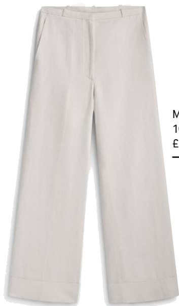
Massimo Dutti 100% Linen Waxed Trousers £149