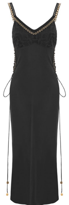
Hayley Menzies Lace Silk Satin Midi Slip Dress £390