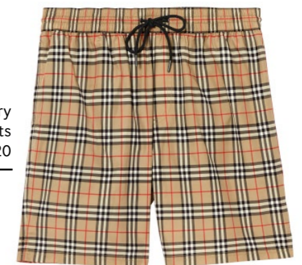
Burberry Check Drawcord Swim Shorts £320