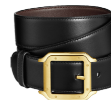
Cartier Santos de Cartier Belt £540