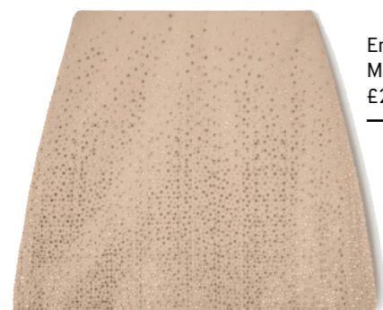
Ermanno Scervino Miniskirt with Crystals £2,010

Our edit of the finest festive partywear.