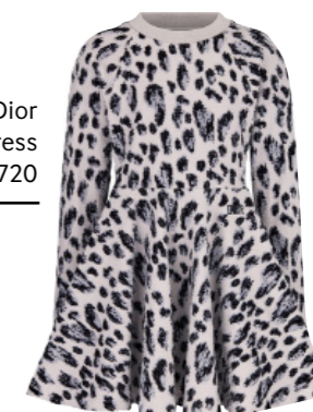
Dior Children's Flared Dress £720