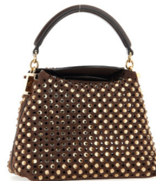
TOD'S T Case Bag £1,470