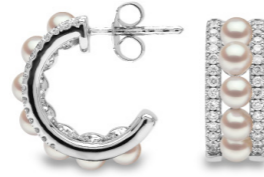
Yoko London Eclipse Akoya Pearl and Diamond Hoop Earrings £2,800