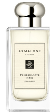
Jo Malone London Pomegranate Noir Cologne £118