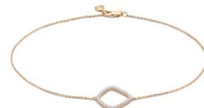
Monica Vinader Gold & Diamond Riva Kite Chain Bracelet £450