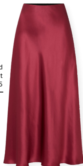
Really Wild di Slip Silk Skirt £245