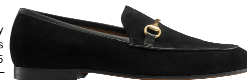
Russell and Bromley Princeton Loafers £245