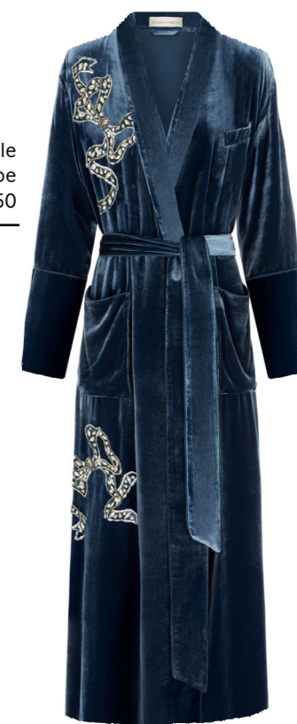
Olivia Von Halle Capability Grace Robe £2,750