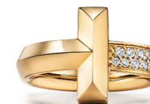
Tiffany & Co. T T1 Ring in Yellow Gold with Diamonds £4,650