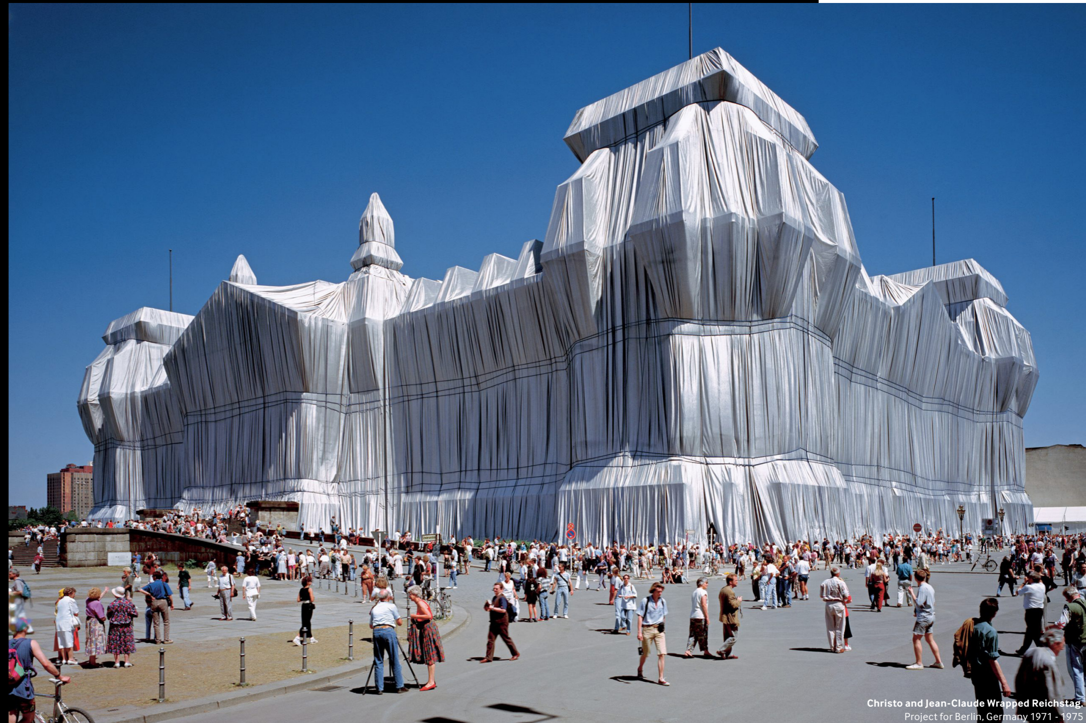
Christo and Jeanne-Claude Wrapped Reichstag . Project for Berlin, Germany 1971 - 1975

If you would like to attend, please RSVP here by 7 November.