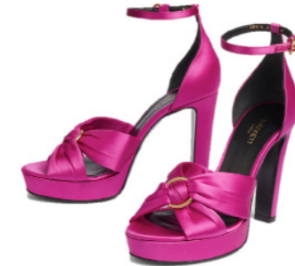
LK Bennett Aysha Pink Satin Platform Sandals £309