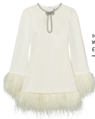
self-portrait White Crepe Feather Mini Dress £595