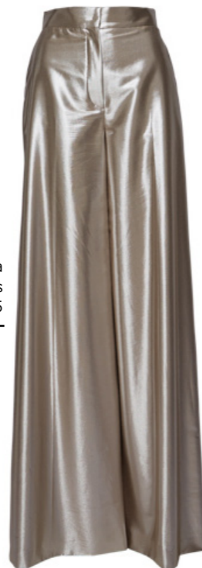
Escada Silver Trousers £755