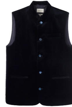
Sirplus Midnight Navy Organic Velvet Nehru Waistcoat £295