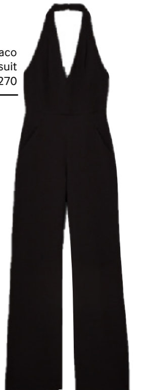
Club Monaco Wide Leg Halter Jumpsuit £270