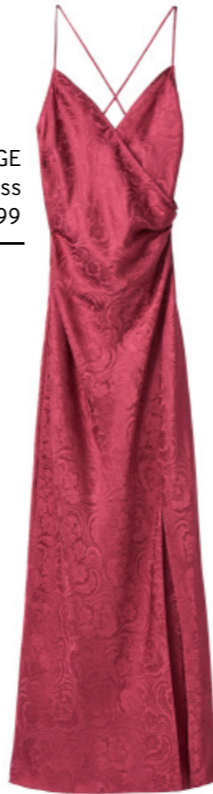
PAIGE Laci Dress £461.99