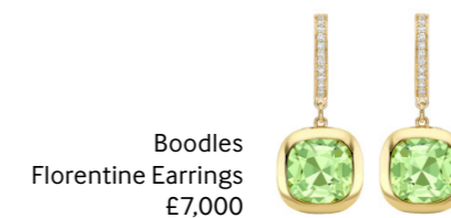
Boodles Florentine Earrings £7,000