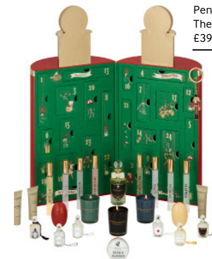
Penhaligons The Toy Chest Advent Calendar £395