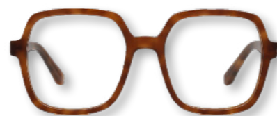
Jimmy Fairly The Lou Glasses £129