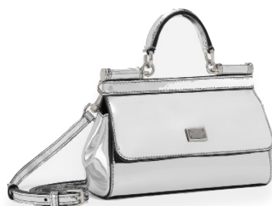
Dolce & Gabbana Sicily Bag in Silver Laminated Calfskin £1,350