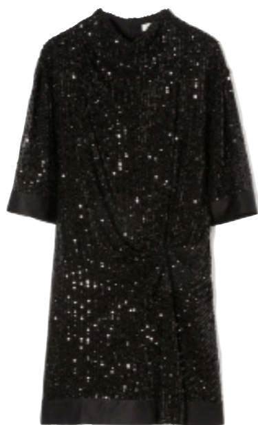
Jigsaw Waterfall Sequin Mini Dress £195