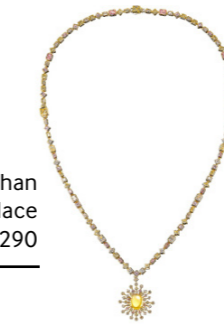
Anabela Chan Candy Spectra Pendant Necklace £6,290