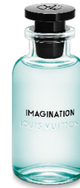
Louis Vuitton Imagination Parfum, 100ml £255