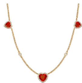
Kiki McDonough Fire Opal and Diamond Triple Heart Necklace £3,900