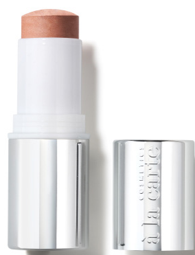
Cosmetics à la Carte Bare Glow Luminizer Moonbeam £38