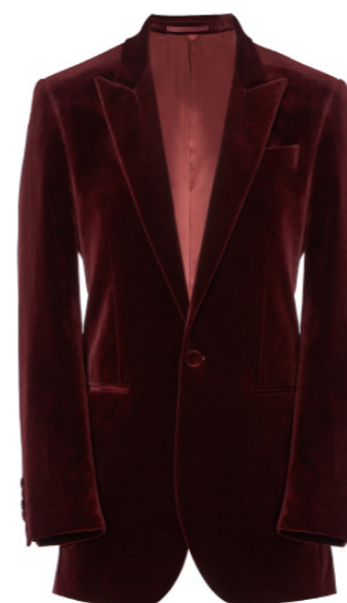
Oliver Brown Carlyle Velvet Smoking Jacket in Vino £595