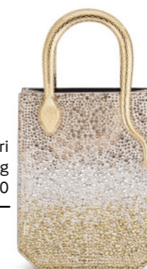
Bulgari Serpentine Mini Tote Bag £3,770