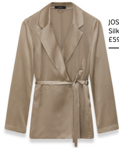
JOSEPH Silk Satin Joubert Jacket £595