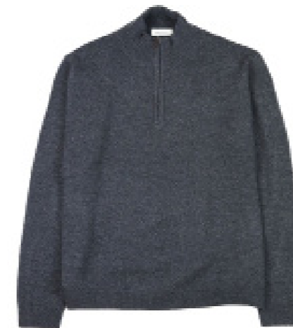
Jam Industries Charcoal jumper £175