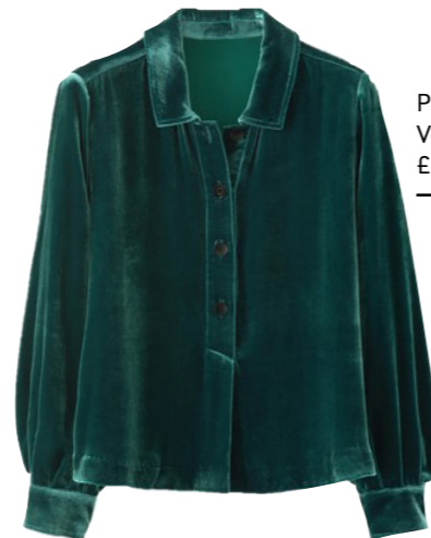
Poetry Velvet Collared Top £185