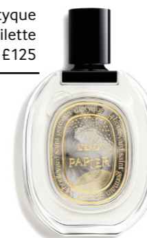
Diptyque L'Eau Papier Eau de Toilette £125