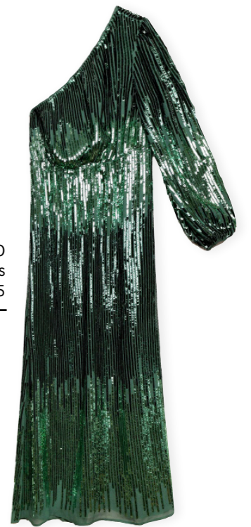
RIXO Bradshaw Sequin Midi Dress £385