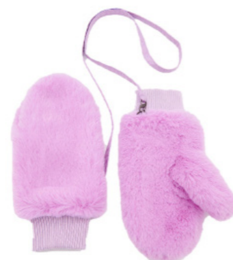
Essentiel Antwerp Lilac Faux Fur Mittens £95