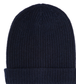
Luca Faloni Cashmere Beanie £110