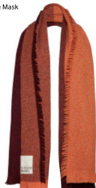
Strathberry Cashmere Wool Colourblock Scarf £195