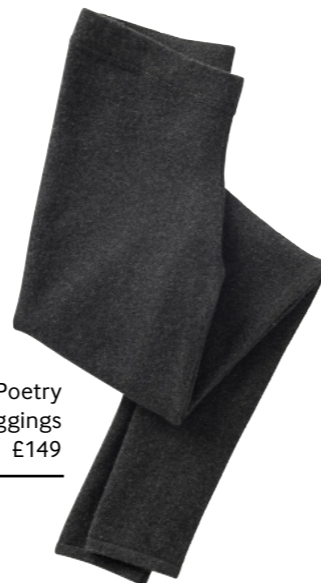
Poetry Cashmere Leggings £149