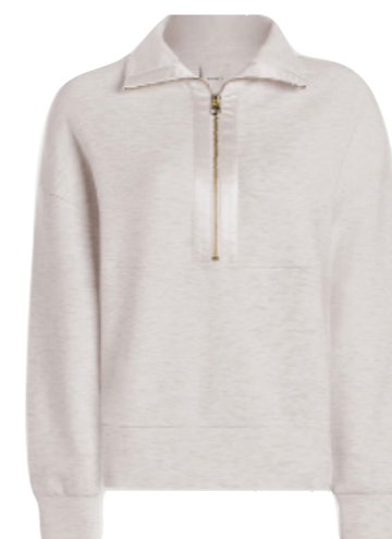
Varley Keller Half-Zip Pullover £105