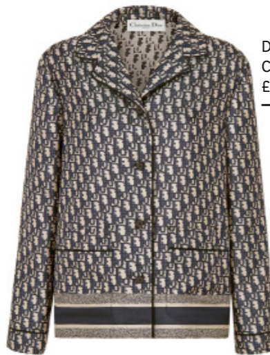
Dior Chez Moi Shirt in Blue Dior Oblique Silk Twill £2,100