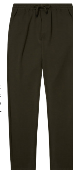
Bluemint Jogger Drawstring Trousers £110