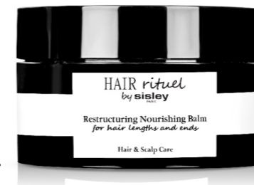
Salon Sloane Restructuring Nourishing Balm £94