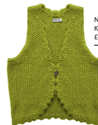
NRBY Kendall waistcoat £99