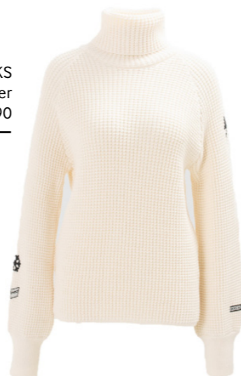
IKKS Ecru Knit Rock Badge IKKS x Duvillard Sweater £190