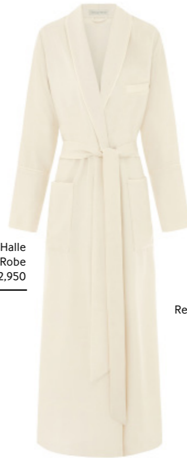
Olivia Von Halle Logan Aspen Ivory Cashmere Robe £2,950