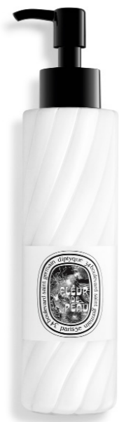
Diptyque Fleur de Peau Hand and Body Lotion £51