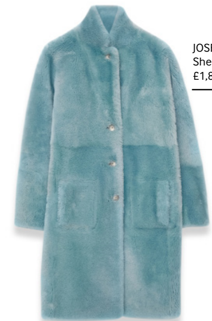
JOSEPH Shearling Brittany Coat £1,875