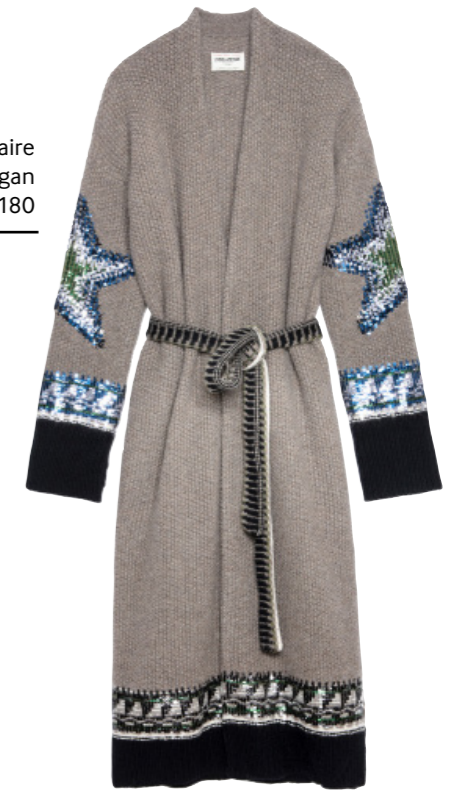
Zadig & Voltaire Rosanny Sequin Cashmere Cardigan £1,180