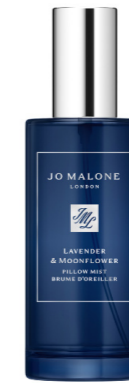
Jo Malone London Lavender & Moonflower Pillow Mist £38