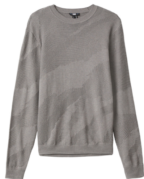
PAIGE Bowman Sweater - Iris Slate £222