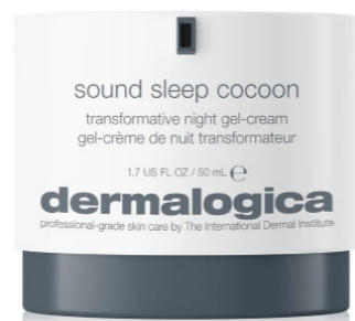
Dermalogica Sound Sleep Cocoon Cream £85