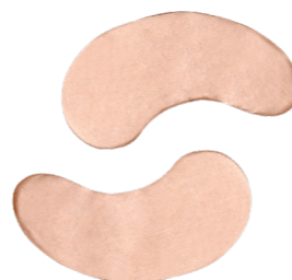
MZ Skin Anti-Pollution Illuminating Eye Mask £22