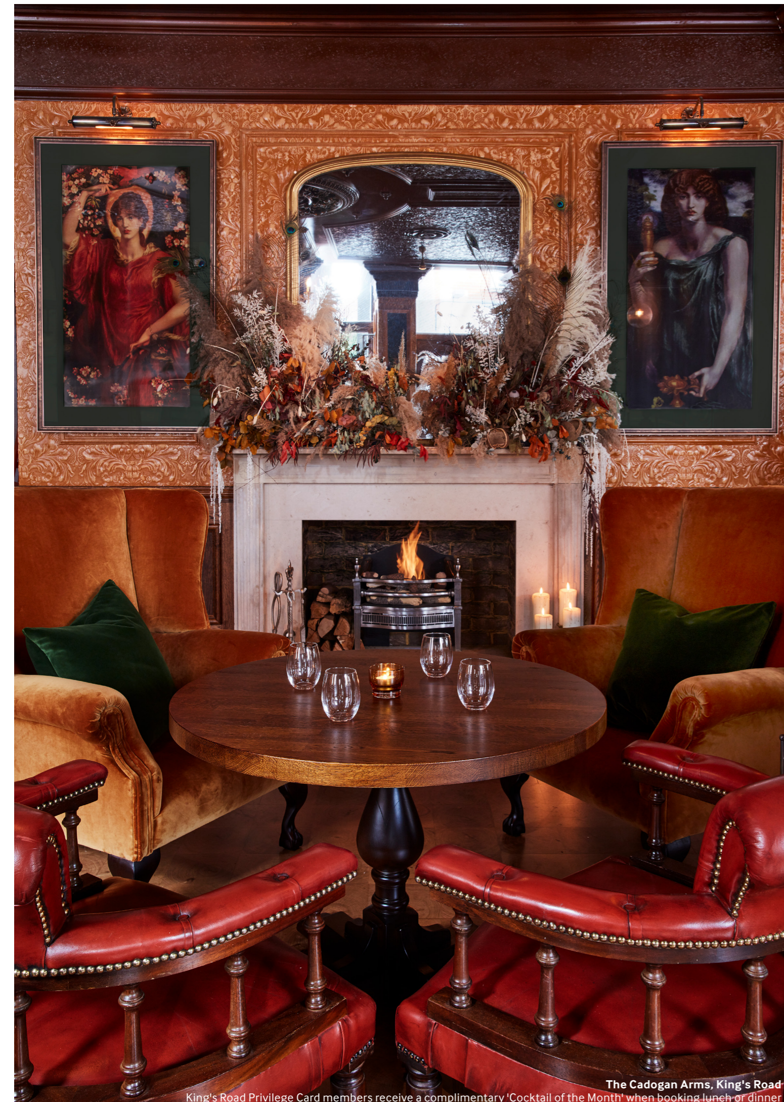
The Cadogan Arms, King's Road King's Road Privilege Card members receive a complimentary 'Cocktail of the Month' when booking lunch or dinner

22 YOUR LONDON The Capital's most exciting dates for your diary