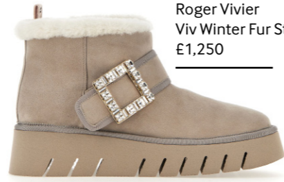
Roger Vivier Viv Winter Fur Strass Buckle Ankle Boots £1,250