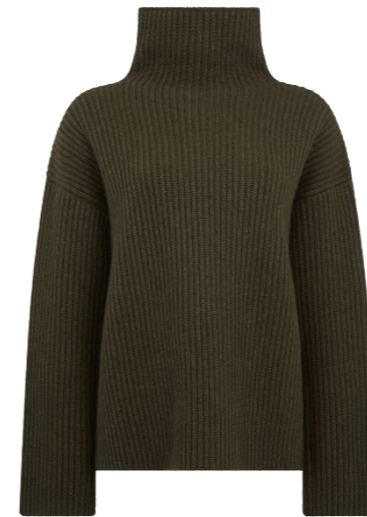
Really Wild Cashmere Mix Ribbed High Neck Jumper £385