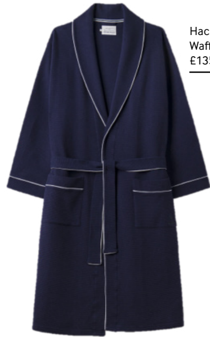
Hackett Waffle Dressing Gown £135

Cocoon yourself in comfort with our curated collection of hibernation must-haves.