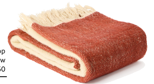
The Conran Shop Wool Dipped Throw £350