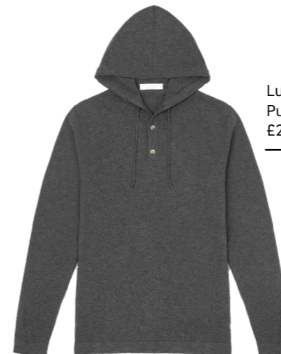
Luca Faloni Pure Cashmere Hoodie £295