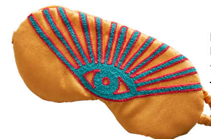
Free People El Cosmico Eye Mask £88

LUXURY • ACCESSORIES • PERSONAL SHOPPING • EXPERIENCES