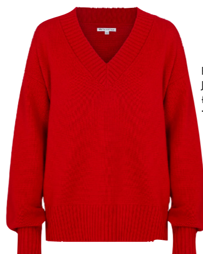
Reformation Jadey Cashmere Oversized V-Neck Sweater £298