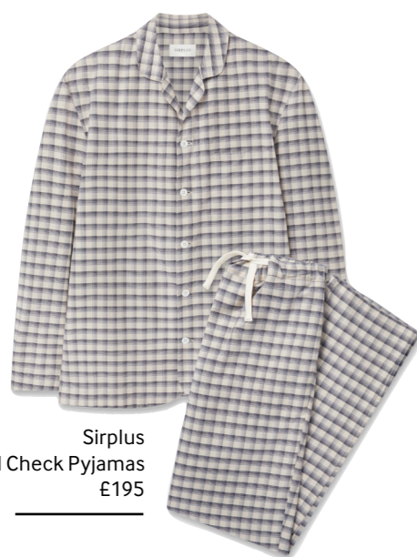
Sirplus Beige Seaweed Check Pyjamas £195