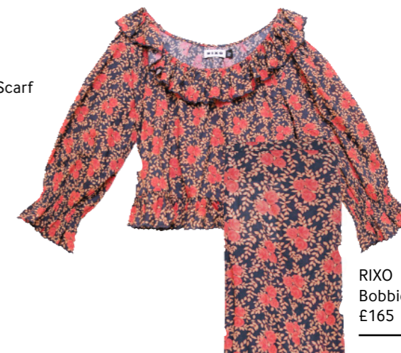
RIXO Bobbie Cotton Pyjama Set £165