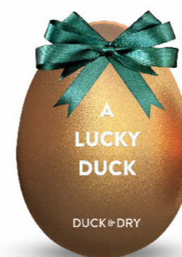
Duck & Dry Gift Card From £15