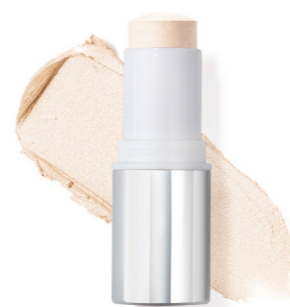
Cosmetics à la Carte Bare Glow Luminizer 'Swan' £38