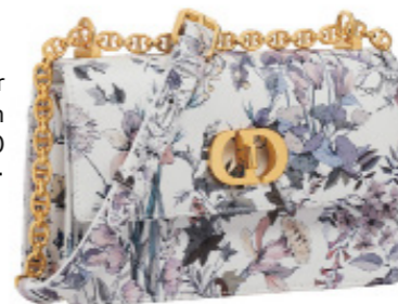
Dior Caro Bag in Latte Calfskin Printed with Hiver All Over Pattern £2,700

LUXURY • ACCESSORIES • PERSONAL SHOPPING • EXPERIENCES