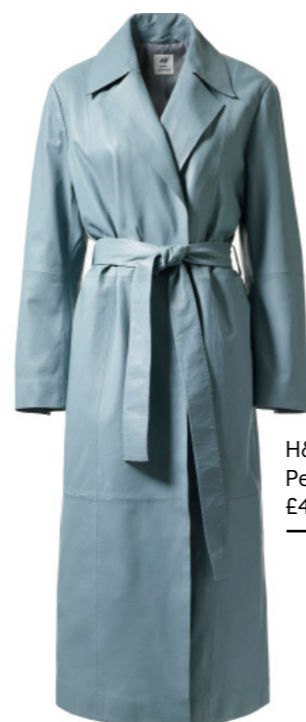
H&M Peace Leather Coat £479.99