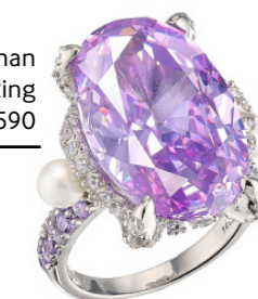
Anabela Chan Lilac Mermaid Ring £1,590