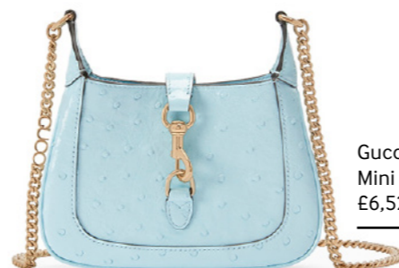
Gucci Mini Chain Jackie Notte Shoulder Bag £6,520