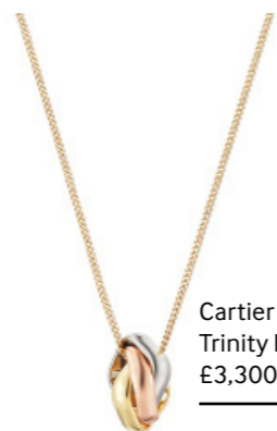
Cartier Trinity Necklace £3,300