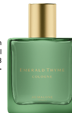
Jo Malone London Emerald Thyme Cologne 30ml £58