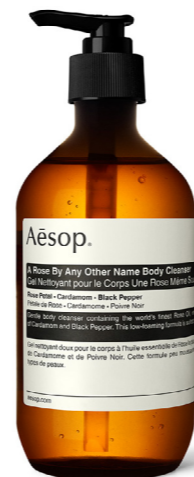
Aesop A Rose by Any Other Name Body Cleanser, 500ml £35