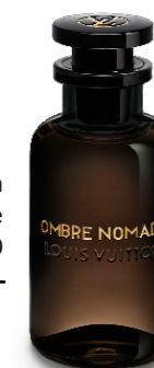
Louis Vuitton Ombre Nomade Fragrance £320