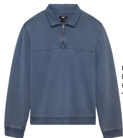
PAIGE Davion Quarter Zip Pullover £210.99