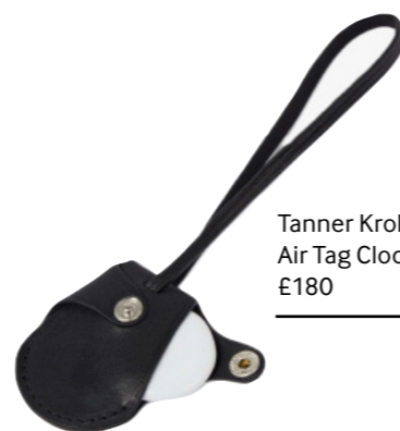
Tanner Krolle Air Tag Clochette £180