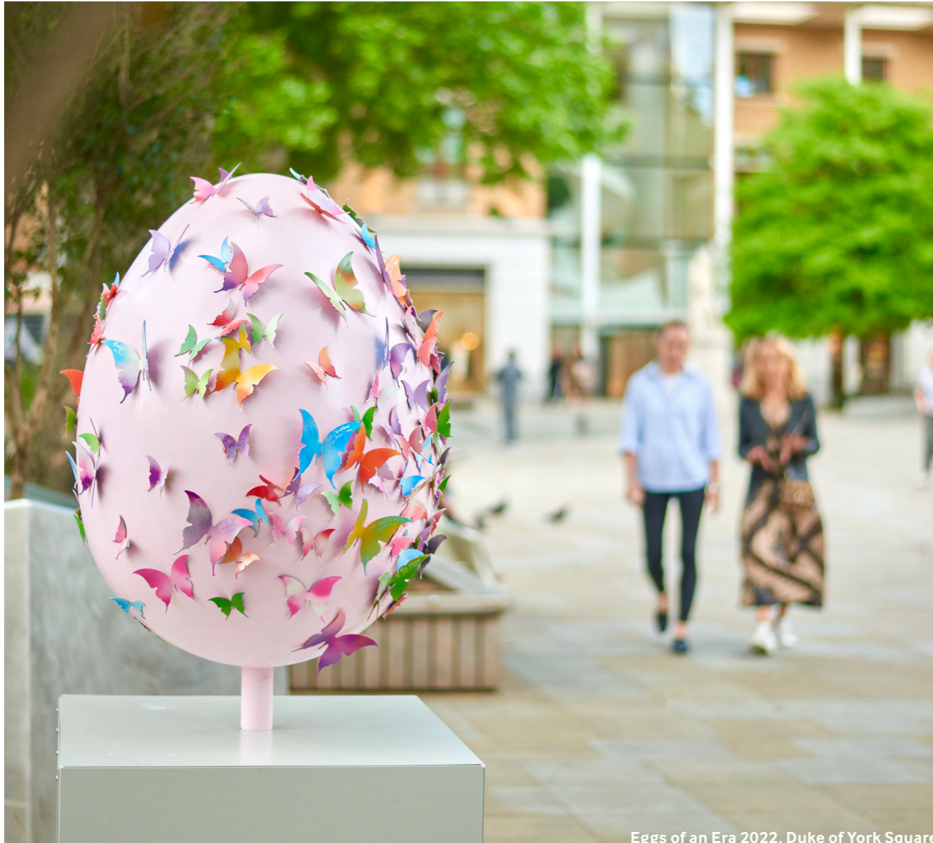
Eggs of an Era 2022, Duke of York Square

MUSIC • ART • THEATRE • EXHIBITIONS • FOOD