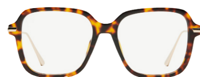
Bloobloom The Lover Glasses £99