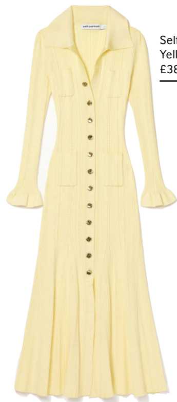
Self-Portrait Yellow Ribbed Viscose Knit Midi Dress £380

Step into spring in style with neighbourhood new arrivals.