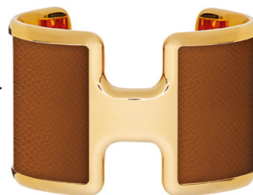
Hermès Cuff in Madame Calfskin and Golden Metal £670