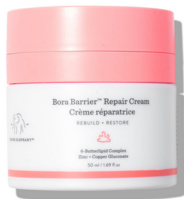
Space NK Drunk Elephant Bora Barrier Repair Cream £62