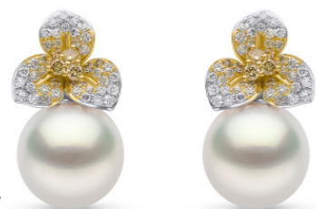
Yoko London Sunrise 18K Gold South Sea Diamond Earrings £9,000