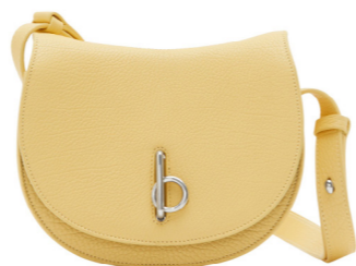
Burberry Mini Rocking Horse Bag £1,550