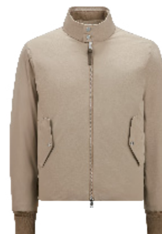
Moncler Chaberton Jacket £1,115