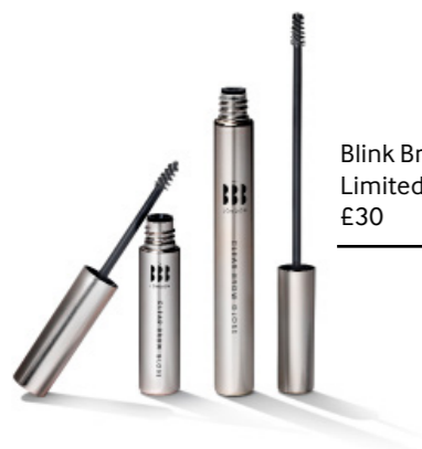
Blink Brow Bar Limited Edition Clear Brow Gloss Duo £30

LUXURY • ACCESSORIES • PERSONAL SHOPPING • EXPERIENCES