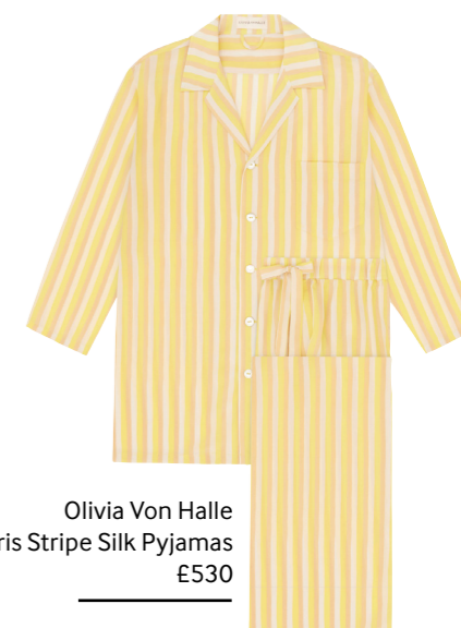
Olivia Von Halle Casablanca Polaris Stripe Silk Pyjamas £530