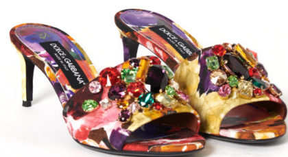
Dolce & Gabbana Mules £995