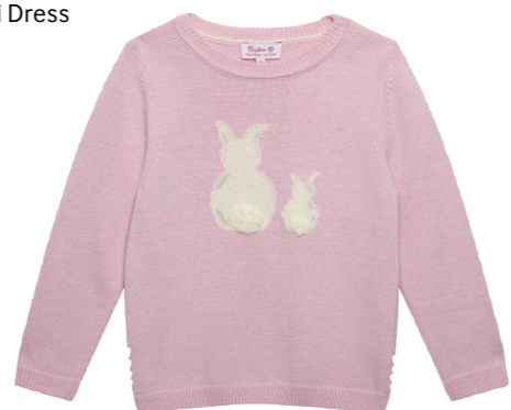
Trotters Bella Bunny Jumper £70