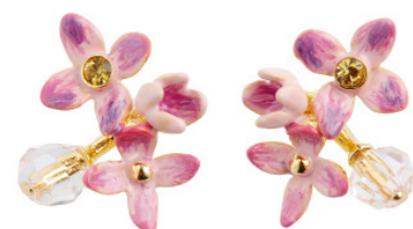
Les Néréides Lilac Flower and Cut Glass Read Post Farrings £75