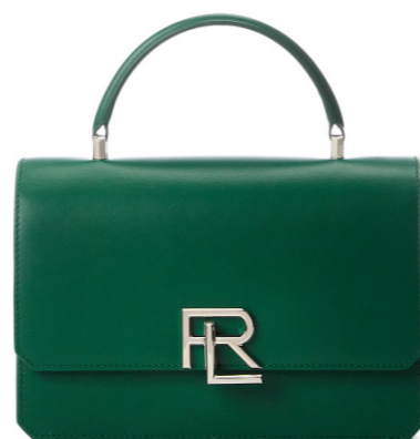
Ralph Lauren RL 888 Box Calfskin Top Handle Bag £2,090