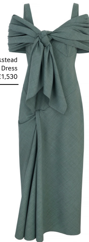
Emilia Wickstead Barlow Dress £1,530