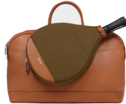
Tanner Krolle Sportsman 48 Overnight and Paddle Bag £2,300 & £490