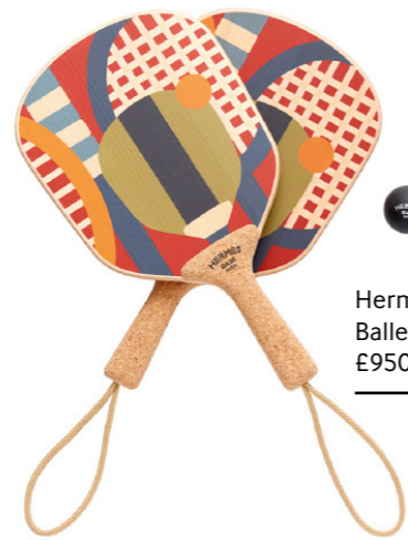
Hermès Balles au Bond Beach Racquets £950