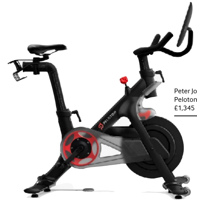
Peter Jones Peloton Bike £1,345