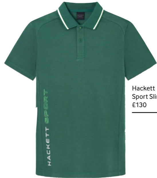
Hackett Sport Slim Fit Polo £130

Inspired by this month's London Marathon, shop the neighbourhoods best active essentials.