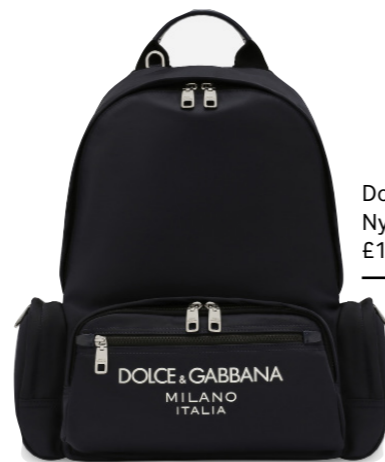
Dolce & Gabbana Nylon Backpack £1,500