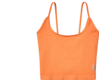
Free People Movement Tighten Up Tank £28