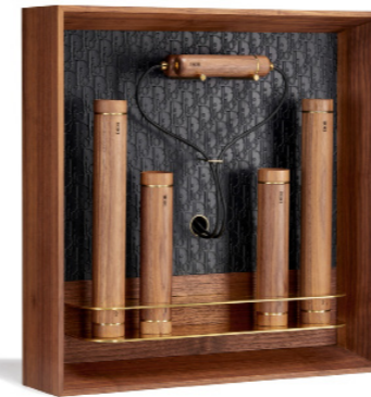
DIOR Fitness Set £5,700