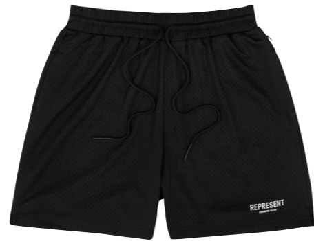
Harvey Nichols Represent Owners Club Jersey-Mesh Shorts £95