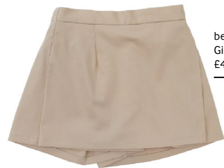
beeboon Girls Khaki Skort £44.95