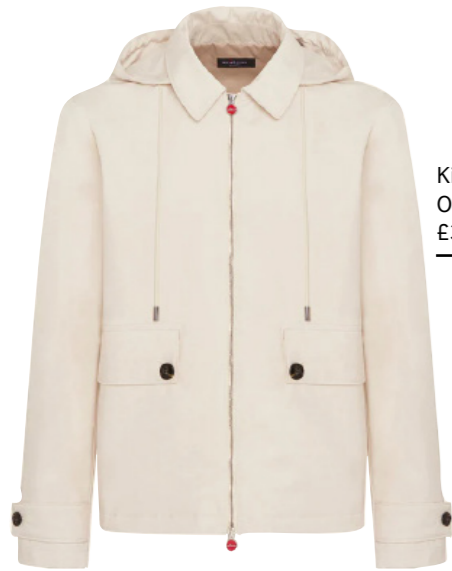
Kiton Outdoor Jacket £3,740

Inspired by this month's London Marathon, shop the neighbourhoods best active essentials.