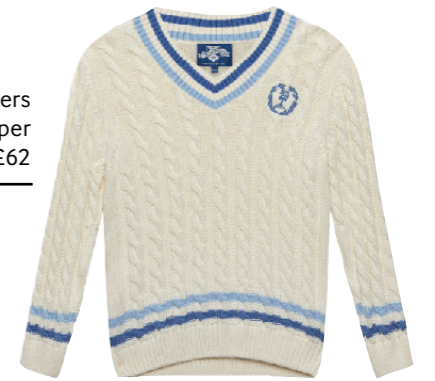
Trotters Boys Thomas Brown Cricket Jumper £62