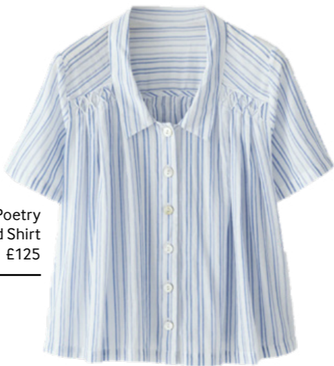
Poetry Striped Pleated Shirt £125