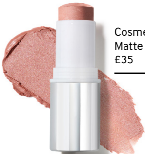
Cosmetics à la Carte Matte Velvet Lipstick Pirouette £35