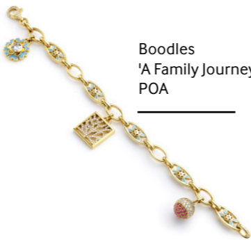
Boodles 'A Family Journey' Paris Design Charm Bracelet POA