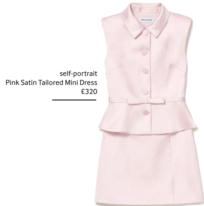
self-portrait Pink Satin Tailored Mini Dress £320

Dress for the Olympics in these Parisian Chic styles.