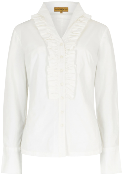
Dubarry Hydrangea Shirt in White £99