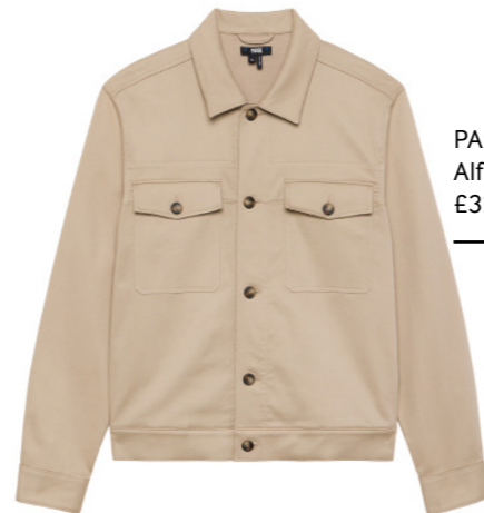
PAIGE Alfred Jacket £325