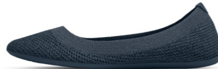
Allbirds Tree Breezer Pumps £105