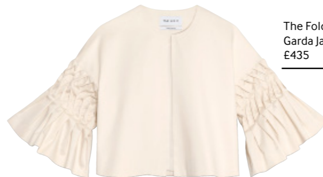
The Fold Garda Jacket in Stone Stretch Cotton £435