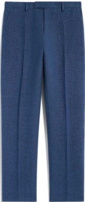
Berluti Classic Linen Slim Pants £770