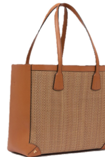
Tanner Krolle City Tote Bag £1,750