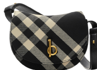
Burberry Mini Rocking Horse Bag £1,250