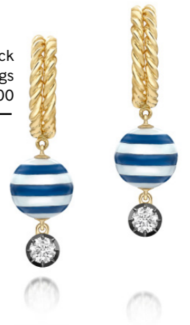
Jessica McCormack Hello Sailor Rope & Pearl Hoop Earrings £6,000