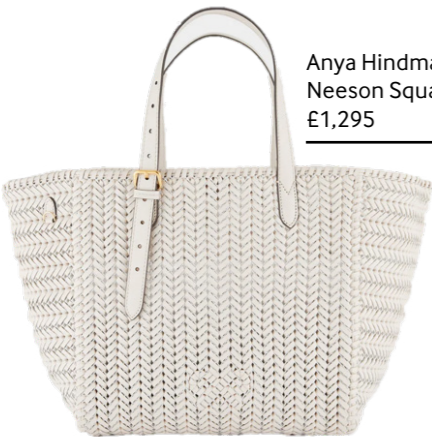
Anya Hindmarch Neeson Square Tote £1,295

Dress for the Olympics in these Parisian-chic styles.