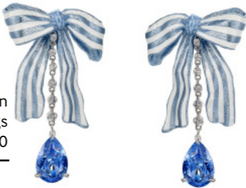
Anabela Chan Aqua Bardot Bow Earrings £1,490