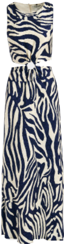
Essentiel Antwerp Maxi Dres with Zebra Print £290