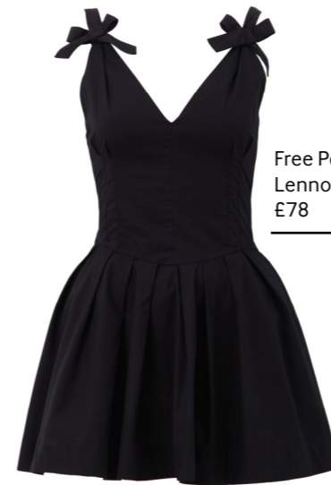
Free People Lennon Mini Dress £78