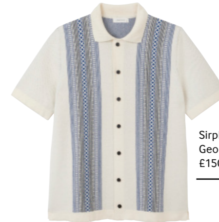
Sirplus Geo Jacquard Knit Polo £150