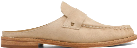
Nokwol Gleam Kid Suede Sand £200