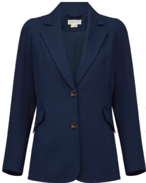
ASPIGA Linen Blend Jacket £200