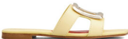
Roger Vivier Viv' by the Sea Mules £740