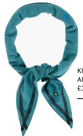
Klättermusen Allvis Scarf £35