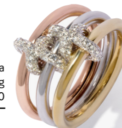
Annoushka Trio-Colour Gold and Diamond Ring £5,900