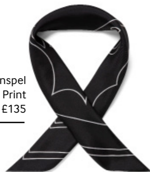
Sunspel Silk Scarf Black Linear Archive Print £135