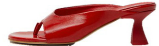
Miista Palmira Red Sandals £185