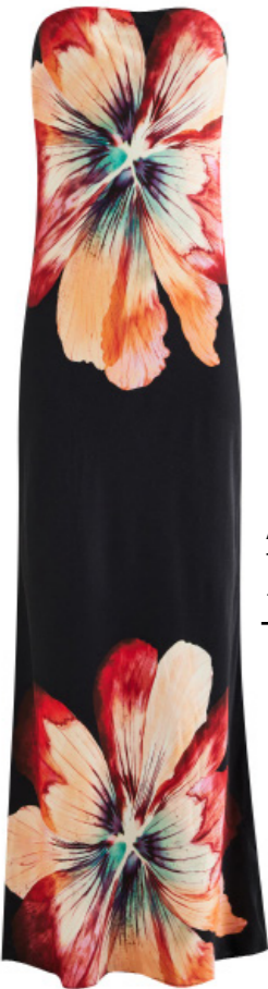
Anthropologie The Fleur Strapless Satin Maxi Slip Dress £138