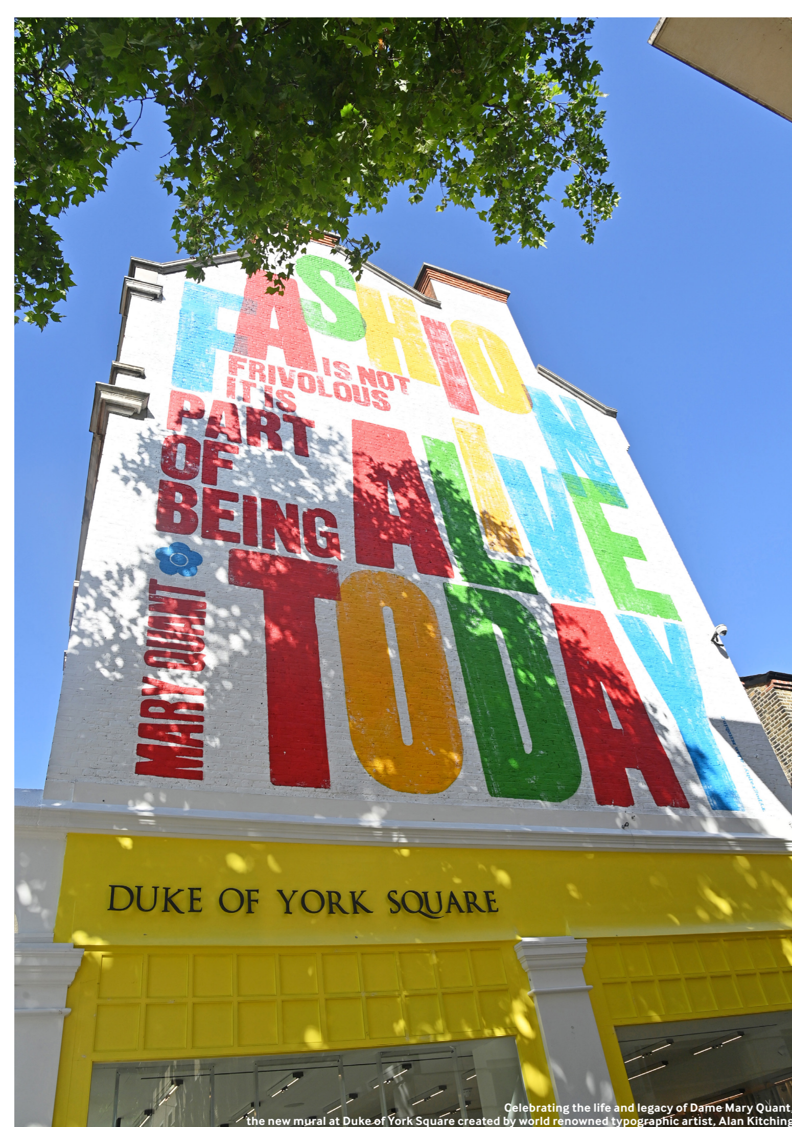
Celebrating the life and legacy of Dame Mary Quant, the new mural at Duke of York Square created by world renowned typographic artist, Alan Kitching

The Capital's most exciting dates for your diary