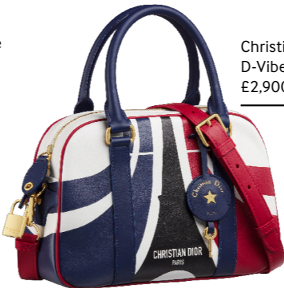
Christian Dior D-Vibe Medium Bag in Calfskin £2,900