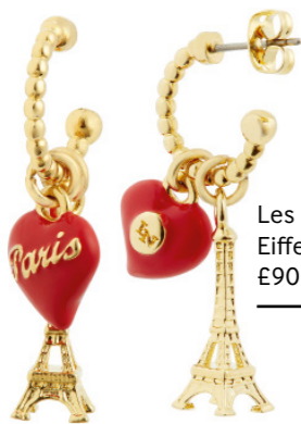
Les Néréides Eiffel Tower and Red Heart Post Hoop Earrings £90