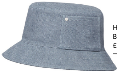
Hermès Bucket Hat in Suede Lambskin £2,200