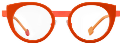
Auerbach & Steele Sabine Be Glasses £400