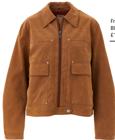
Free People Blair Vegan Suede Jacket £158