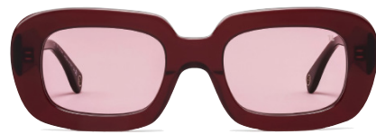
Jimmy Fairly The Ily Frames £135

'Fall' in love with the new autumn collections.