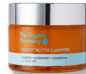
The Organic Pharmacy Carrot Butter Cleanser £35