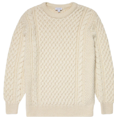
Sirplus Cable Knit Jumper £285