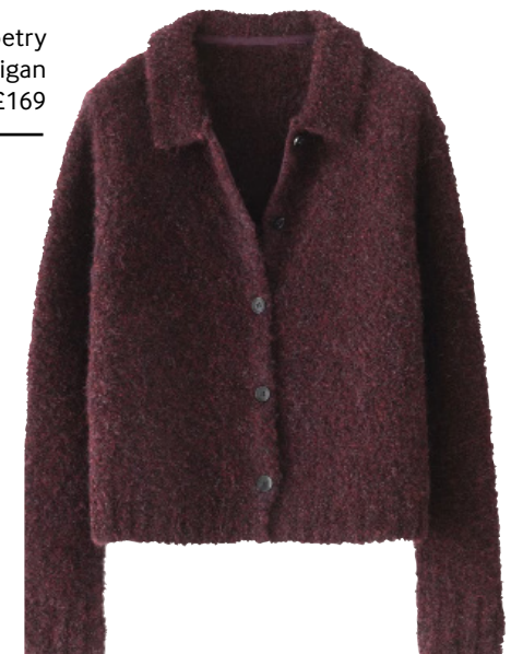
Poetry Collared Cardigan £169