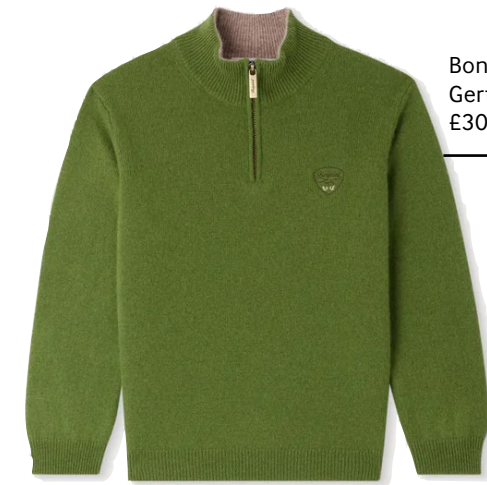
Bonpoint Gert Cashmere Sweater £305