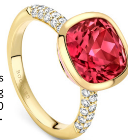
Boodles 'Florentine' Ring £10,000