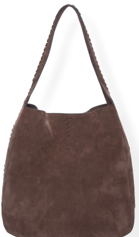
The White Company Whipstitch Suede Tote Bag £180