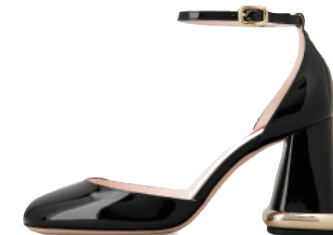
Roger Vivier Viv Podium Ankle Strap Pumps £890