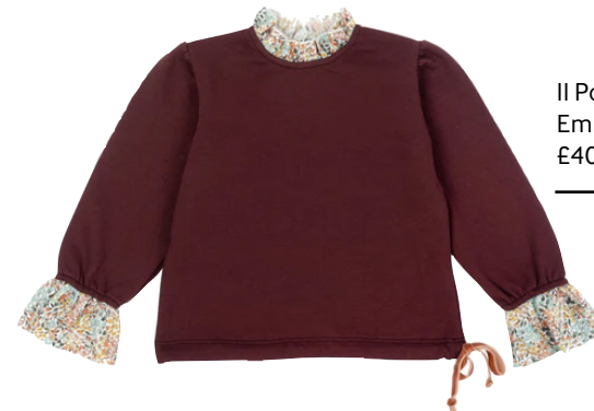
Il Porticciolo Emma Sweater £40