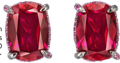
Anabela Chan Ruby Cushion Wing Studs £1,590