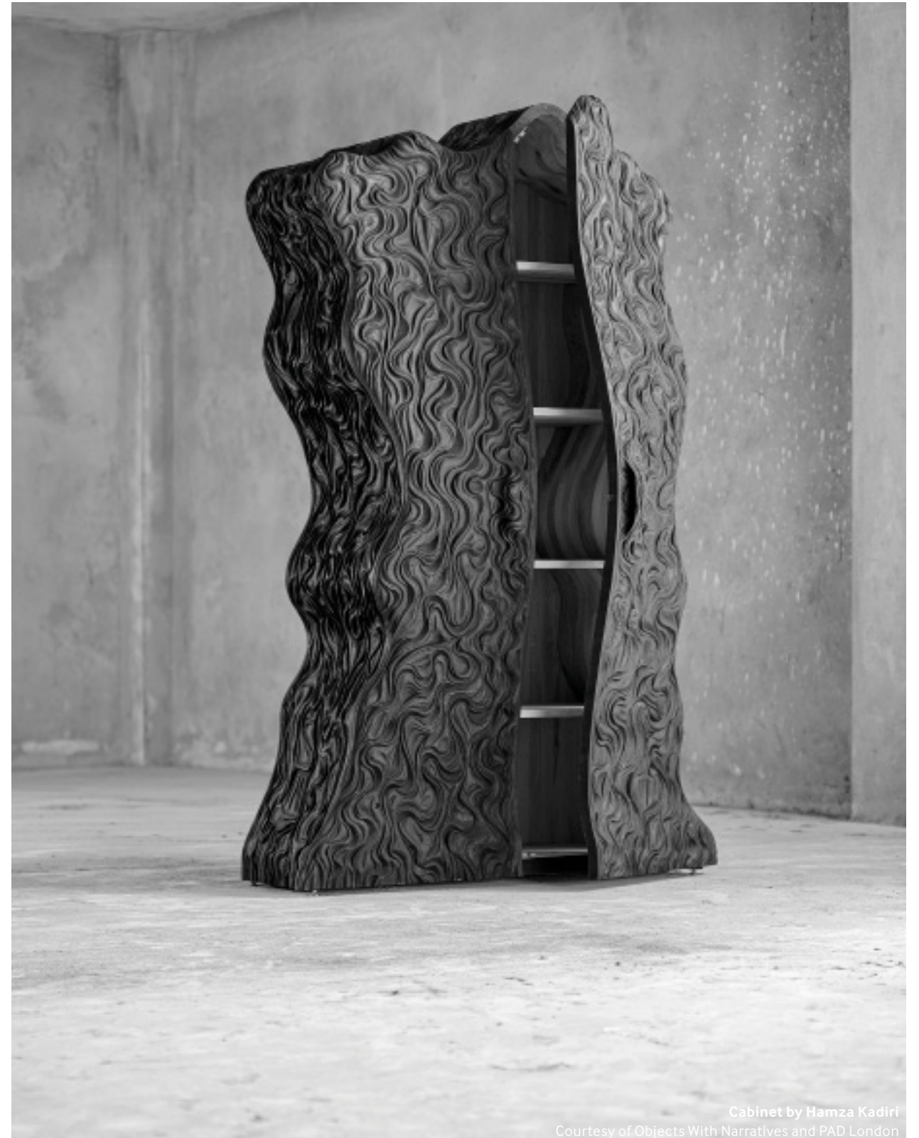
Cabinet by Hamza Kadir Courtesy of Objects With Narratives and PAD London