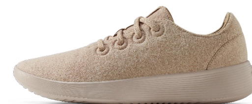
Allbirds Women's Wool Runner Go Trainers £115