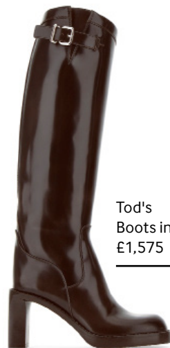
Tod's Boots in Leather £1,575