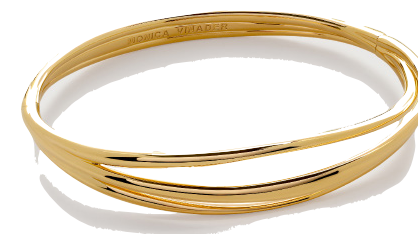
Monica Vinader 18k Gold Vermeil Nura Wrap Bangle