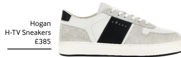
Hogan H-TV Sneakers £385