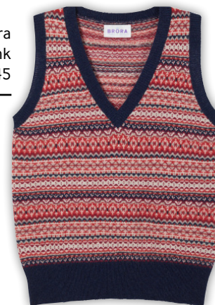
Brora Cashmere Fair Isle Tank £345