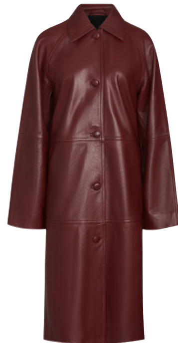
Reformation Veda Beck Leather Trench £748