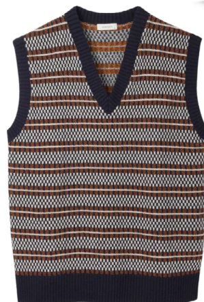
Sirplus Navy Grit Fair-Isle Vest £150