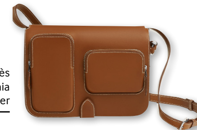
Hermès Equipier Bag in Veau Barenia Leather