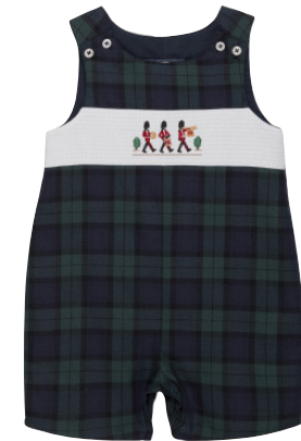
Trotters Marching Band Smocked Romper £50