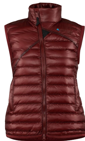
Klättermusen Lopt Vest £289