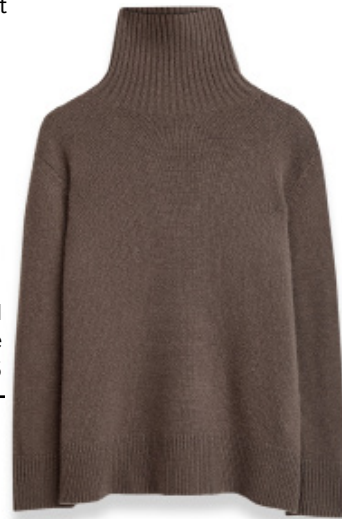
JOSEPH High Neck Cashmere £695