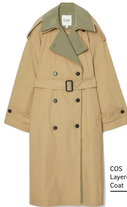
COS Layered Double-Breasted Trench Coat