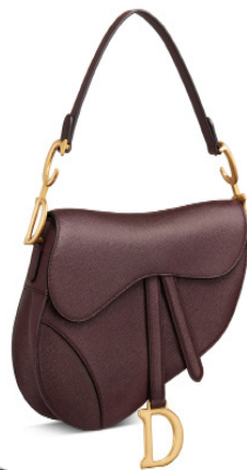
Dior Saddle Bag in Amaranth Grained Calfskin £3,450