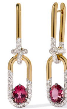
Anoushka Knuckle Dust Tourmaline and Diamond Earrings £13,500