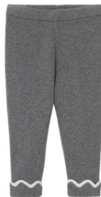
Jacadi Baby Girl Knitted Trousers £32