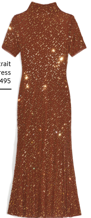
self-portrait Brown Square Rhinestone Mesh Midi Dress £495