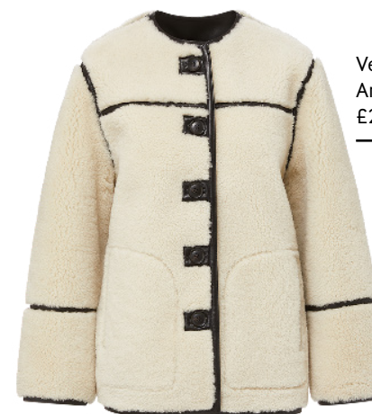
Veronica Beard Anya Reversible Shearling Coat £2,298