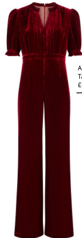
ASPIGA Tallulah Velvet Jumpsuit £250