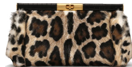
Dolce & Gabbana Marlene Bag in Leopard Print Goatskin £3,700