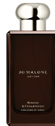
Jo Malone London Hinoki Cedarwood Cologne £160