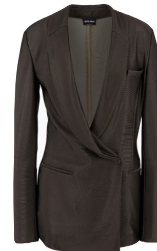
Giorgio Armani Single-Breasted Jacket £1,900