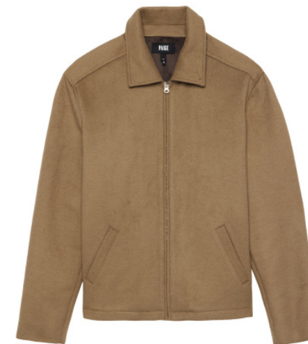
PAIGE Wilerson Jacket £375