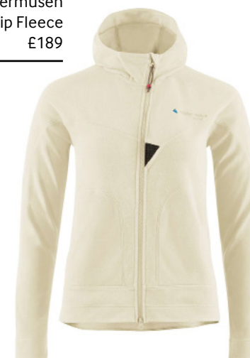
Klättermusen Sigyn Hooded Zip Fleece £189