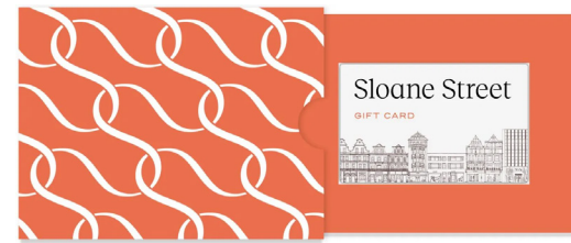
Sloane Street Gift Card £25-£500