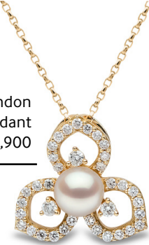
Yoko London Petal Pearl and Diamond Pendant £1,900