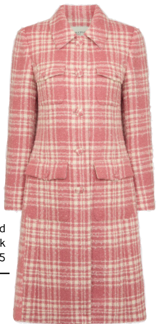
Really Wild The Lady Check Wool Coat in Pink £675