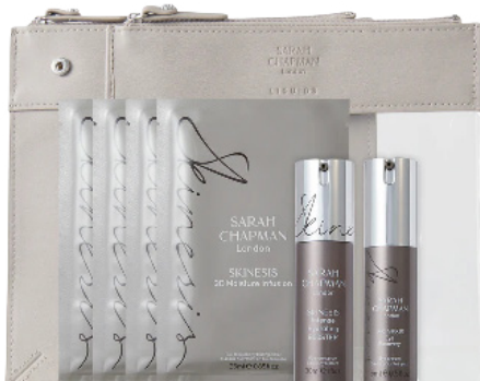
Sarah Chapman The Super Hydration Set £162