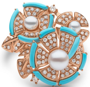
Yoko London Cleopatra 18K Gold Freshwater Pearl Diamond and Turquoise Ring £11,000