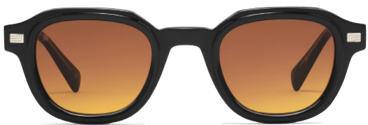
Jimmy Fairly The Napoli Men's Sunglasses £135