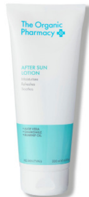
The Organic Pharmacy After Sun Lotion £22