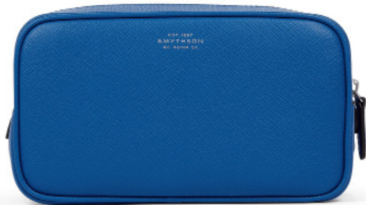
Smythson Washbag with Double Zip in Panama, Cerulean £335