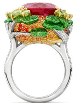
Boodles Tourmaline African Sunset Ring £85,000