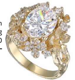
Anabela Chan Golden Posy Diamond Ring £1,190