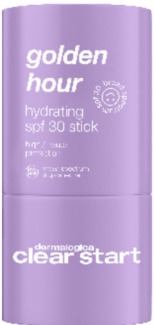
Dermalogica Golden Hour Hydrating SPF30 Stick £29