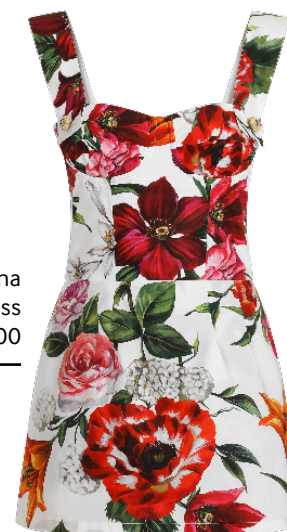
Dolce & Gabbana Flower-Print Poplin Dress £1,600