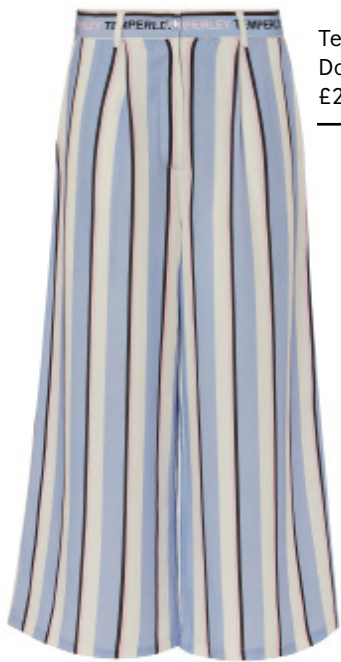
Temperley London Dominique Trousers £207