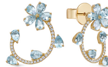
Kiki McDonough Petal Diamond Curl with Blue Topaz Flower Earrings £2,900