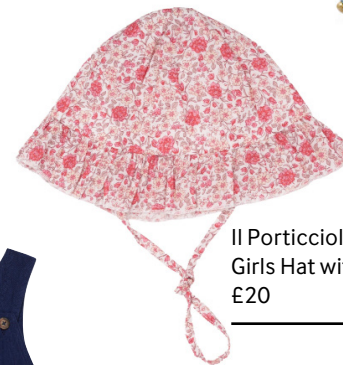
Il Porticciolo Girls Hat with Red Flower £20