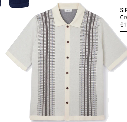
SIRPLUS Cream Woven Panel Jacquard Polo £150