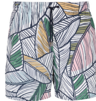
Giorgio Armani Mare Swim Trunks £590