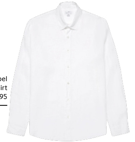
Sunspel Linen Shirt £195