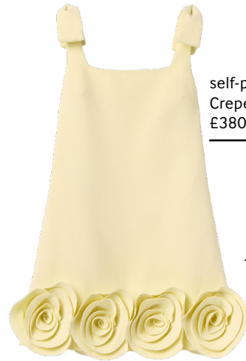
self-portrait Yellow Crepe 3D Flower Mini Dress £380