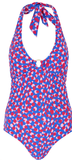
Aspiga Abstract Cheetah Halter Neck Swimsuit £105