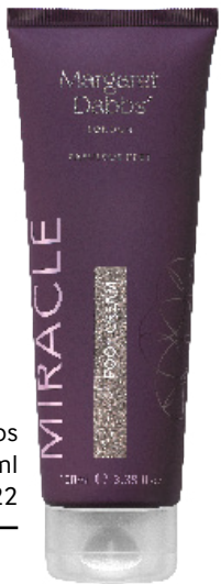
Margaret Dabbs Miracle Foot Cream 100ml £22