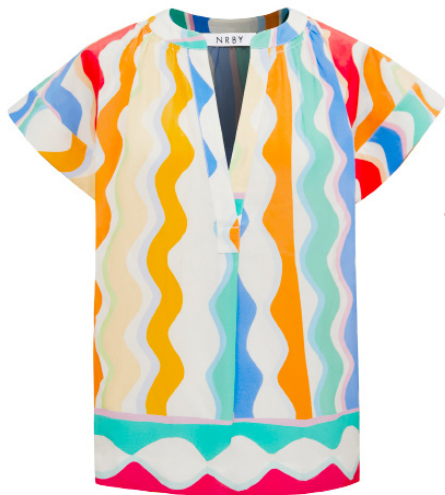
NRBY Summer Silk Wave Print Top £160