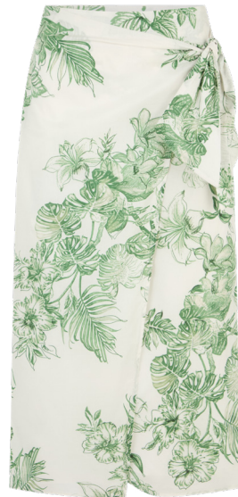
Really Wild Flora Tie Skirt £245