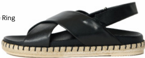
Jigsaw Cross Strap Espadrille Sandal £170