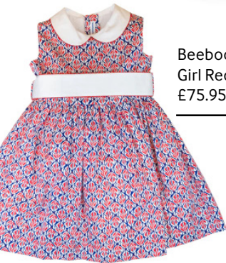
Beeboon Girl Red & Navy Leaves Sleeveless Dress £75.95