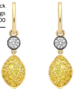
Jessica McCormack Fruit Salad Lemon Drop Sapphire & Diamond Gypset Hoop Earrings £7,000