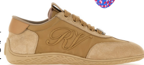
Roger Vivier Viv Low Sneakers in Suede £890