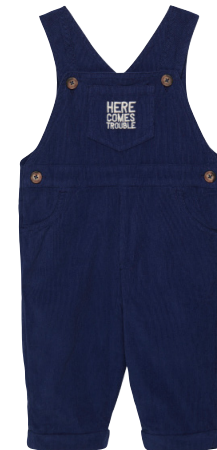
Trotters 'Here Comes Trouble' Dungarees £62