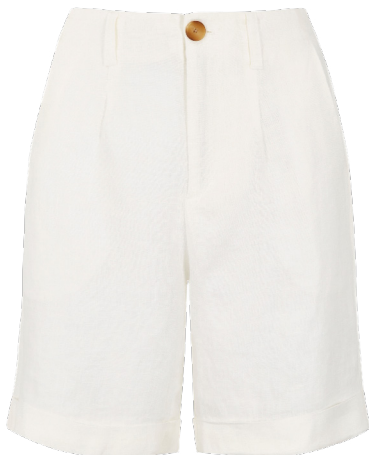
Dubarry Maryland Women's Linen Shorts £129