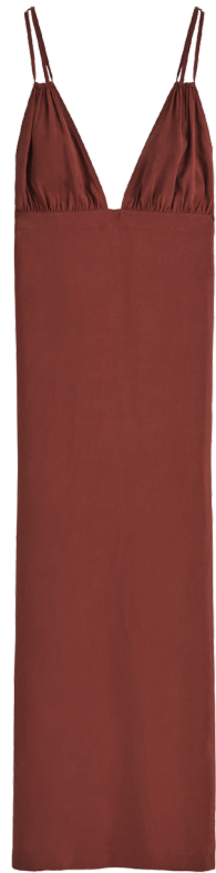
COS Gathered V-Neck Maxi Dress £95

Bank holiday heroes for a luxurious long weekend