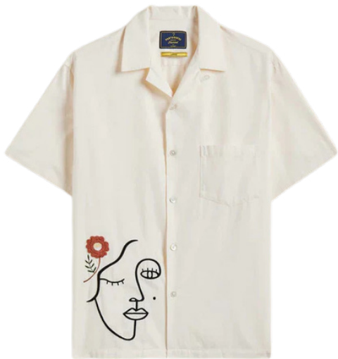
London Beach Co. Face Embroidery Shirt £130