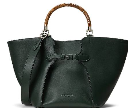
Ralph Lauren Calfskin Tote in Green £3,000