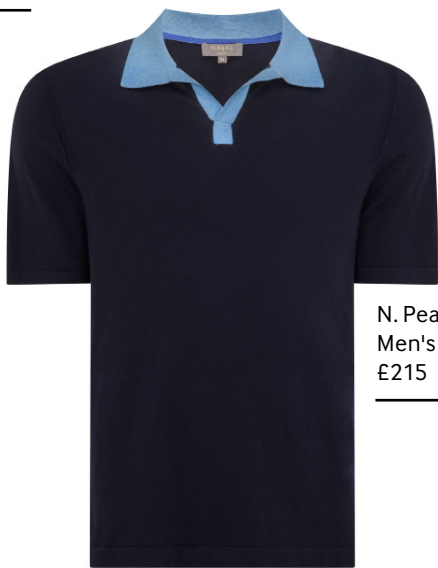
N. Peal Men's Polo Cotton Cashmere T-Shirt in Navy Blue £215