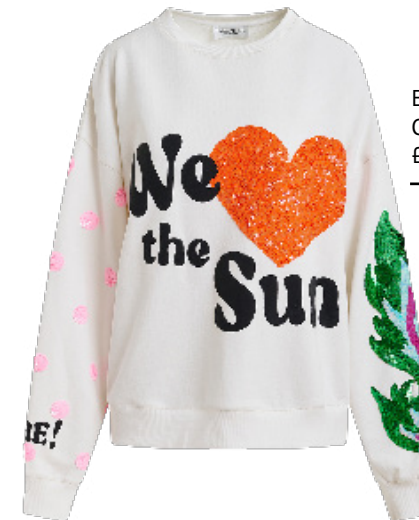
Essentiel Antwerp Cotton Sweatshirt with Sequin Embellishments £240