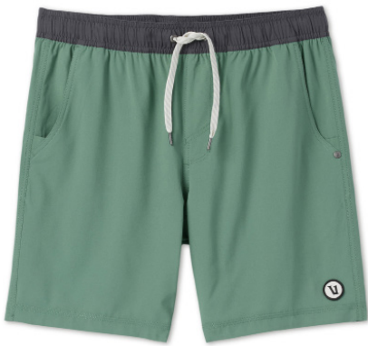
Vuori Men's Kore Short in Hedge Green £75