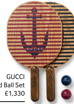
GUCCI Wooden Beach Racket and Ball Set £1,330