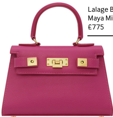
Lalage Beaumont Maya Mignon Caribou Peony £775