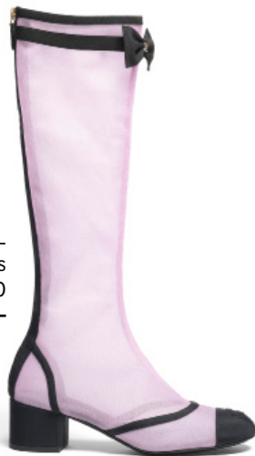
CHANEL High Boots £1,570