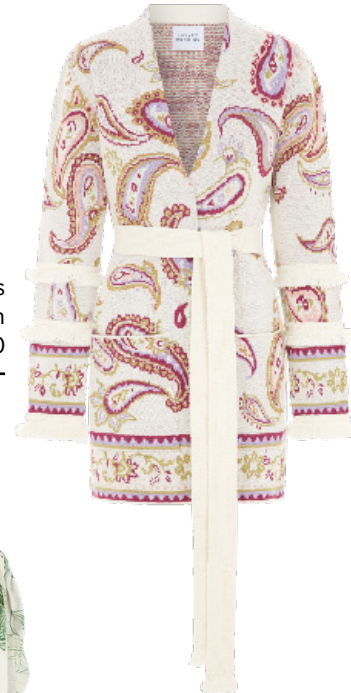
Hayley Menzies Jimi Paisley Cardigan Cream £350