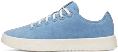
Allbirds Wool Cruiser in Light Blue - Launching 9 September £100