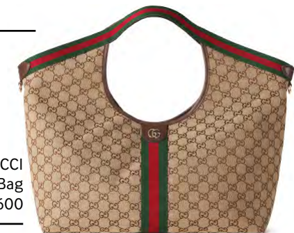
GUCCI Giglio Large Tote Bag £1,600