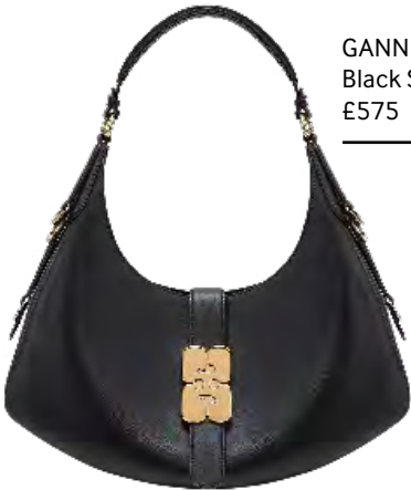
GANNI Black Small Kat Bag £575