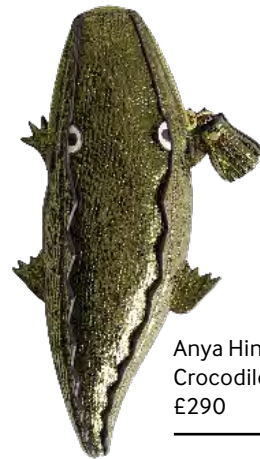
Anya Hindmarch Crocodile Pencil Case £290