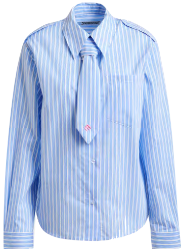
Essentiel Antwerp Blue and White Striped Shirt with Tie £180