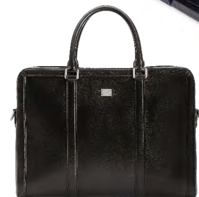
Dolce & Gabbana Calfskin Briefcase £1,900