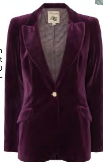
Temperley London Clove Jacket £700