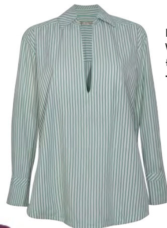
Free People We The Free August Striped Pullover £118