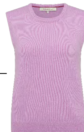
Really Wild The Highgrove Round Neck Tank £345