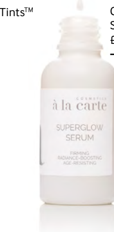
Cosmetics à la Carte Superglow Serum £70