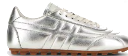
Hogan Olympia Sneakers £385