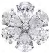
Anabela Chan Diamond Marguerite Daisy Earrings £1,490