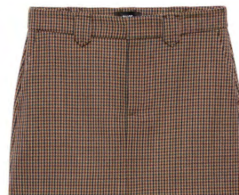
PAIGE Bobbi Skirt £245