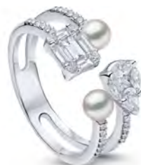
Yoko London Baby Glitz Akoya Pearl & Multi Diamond Open Ring £5,000