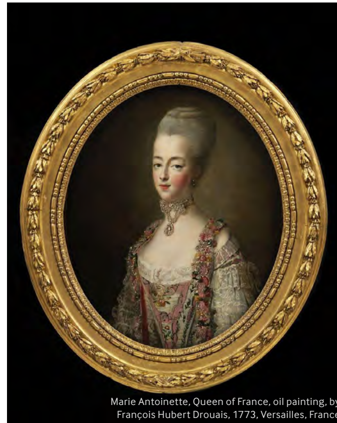
Marie Antoinette, Queen of France, oil painting, by François Hubert Drouais, 1773, Versailles, France

Opulence, power and style converge in this landmark exhibition, tracing the enduring influence of Marie Antoinette. From haute couture to revolutionary statements, it offers a rare glimpse into her legacy through over 250 years of design, fashion, film and art. A complex fashion icon whose youth, notoriety and elegance continue to fascinate, she remains one of history's most stylish, and ill-fated, queens.