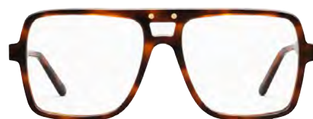
Jimmy Fairly The Nax Glasses £135