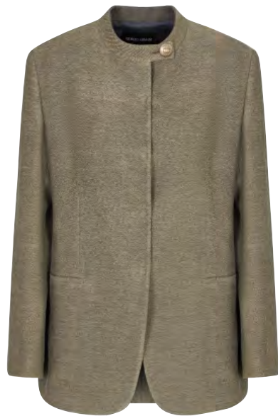
Giorgio Armani Silk Beige Jacket £2,900

Back to Business - September staples for a stylish reset