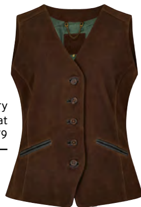
Dubarry Greville Ladies Tailored Leather Waistcoat £279