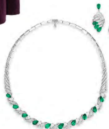
Boodles Emeralds and White Diamonds Scroll Earrings and Necklace £POA