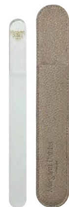
Margaret Dabbs London Crystal Nail File with Cover £20