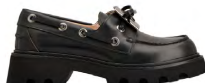
Roger Vivier Viv' Rangers Truck Boat Shoes £1,125