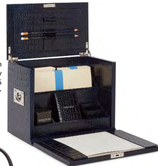
Smythson Stationery Bureau in Mara Navy £1,995