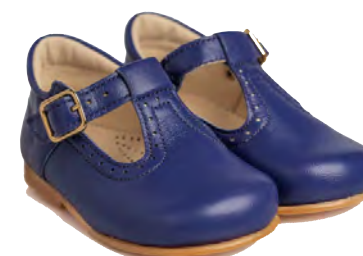
Beeboon Classic Navy Leather T-Bar Children's Shoes £45.95