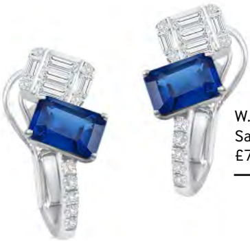
W. Salamoon & Sons Sapphire & Diamond Hoops £7,000