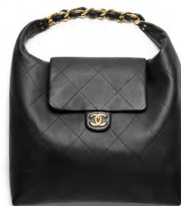
CHANEL Hobo Bag £6,475