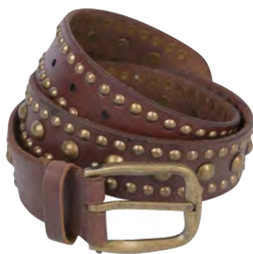
Free People We The Free Sola Stud Belt £58