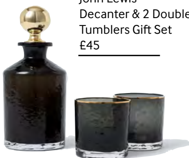
John Lewis Decanter & 2 Double Old Fashioned Tumblers Gift Set £45