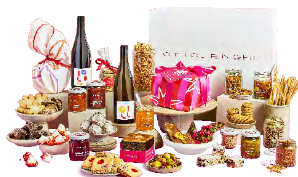
Ottolenghi Ultimate Hamper £370