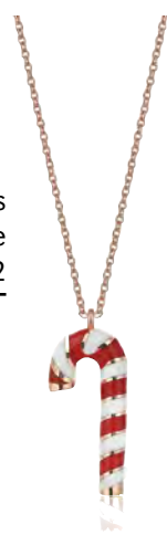
Reis Candy Cane Necklace £272