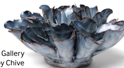
Saatchi Gallery Blue Flower by Chive £42.50