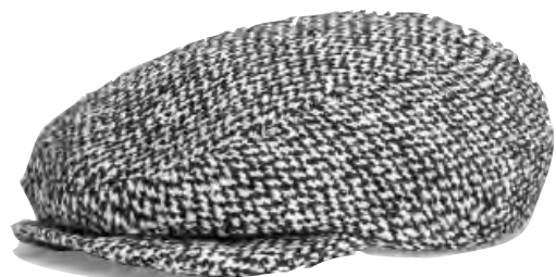
DOLCE & GABBANA Wool Blend Dotted Flat Cap £365