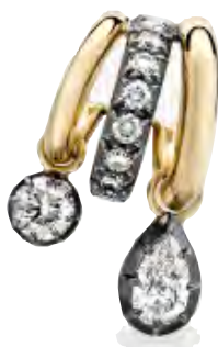
Really Wild Blair Silk Skirt in Truffle £280