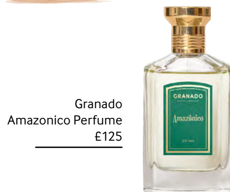
Granado Amazonico Perfume £125