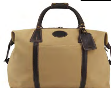
Pickett London Classic Large Canvas Holdall £635