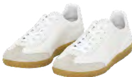
ARKET Leather Sneaker £160