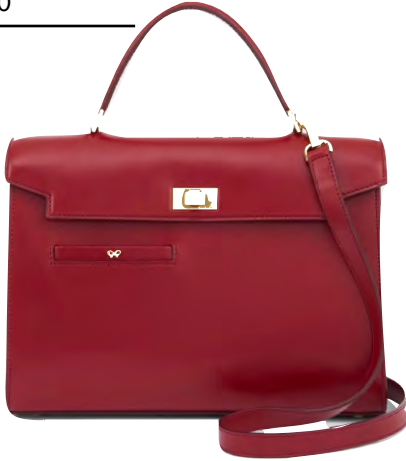
Anya Hindmarch Vampire Mortimer Top Handle Handbag £1,750