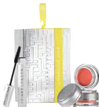
Trinny London The Effortless Glow Makeup Set £32