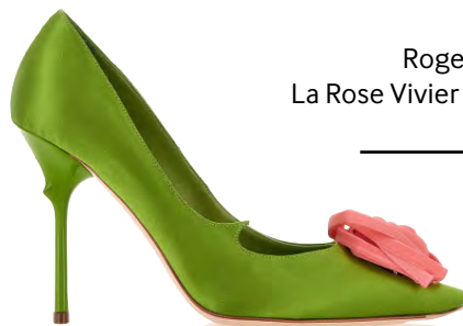
Roger Vivier La Rose Vivier Pumps £1,310