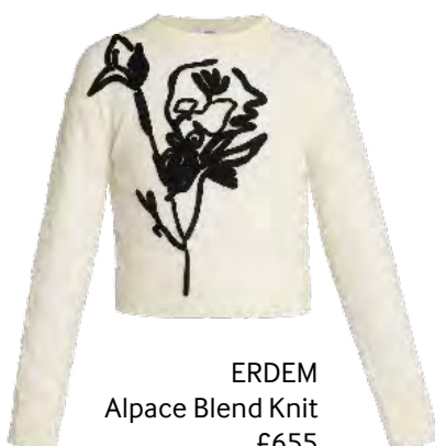
ERDEM Alpaca Blend Knit £655