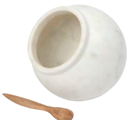
The White Company Marble Salt Cellar with Spoon £50