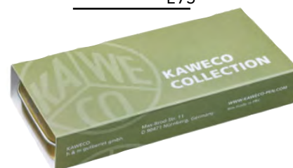
Papersmiths Kaweco AL Sport Fountain Pen £75