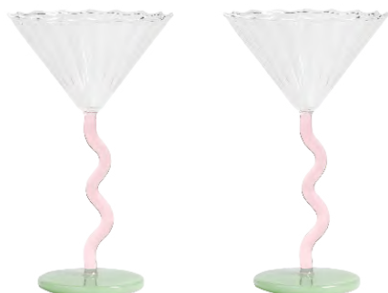
John Lewis Amsterdam Curved Coupe Glasses £45