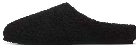
Allbirds Natural Black Fluff Slippers £570