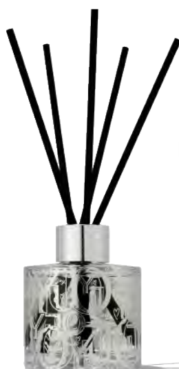
Space NK Winter Pine Diffuser 100ml £28