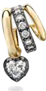
Jessica McCormack Multi-Shape Diamond Tripset Hoops £15,000