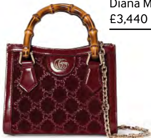
GUCCI Diana Mini Tote Bag £3,440