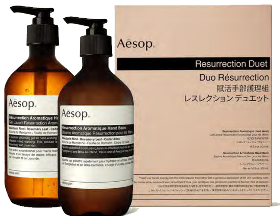
Aesop Resurrection Duet £103