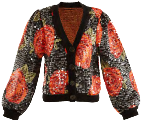
FARM Rio Latin Roses Sequin Knit Cardigan £310