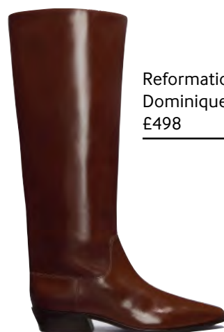
Reformation Dominique Knee Boot £498