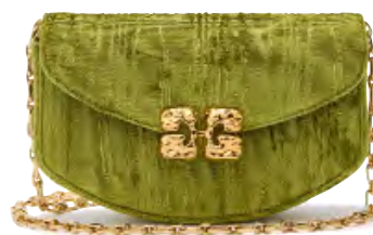
GANNI Lulu Wallet on Chain Velvet Moire £550