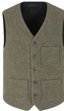
Giorgio Armani Wool Waistcoat £1,400