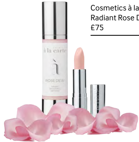
Cosmetics à la Carte Radiant Rose Duo £75