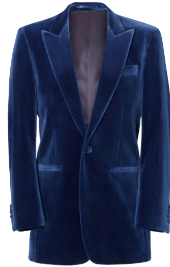
Penhaligon's Luxury Luna Gift Set £220