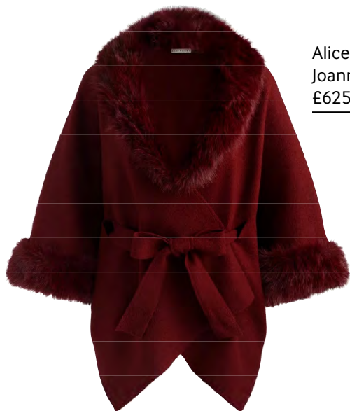
Alice + Olivia Joanne Sweater Coat in Oxblood £625