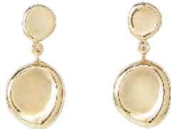
JOSEPH Bean Drop Earrings £95