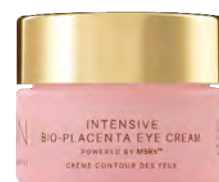
MZ Inte £18