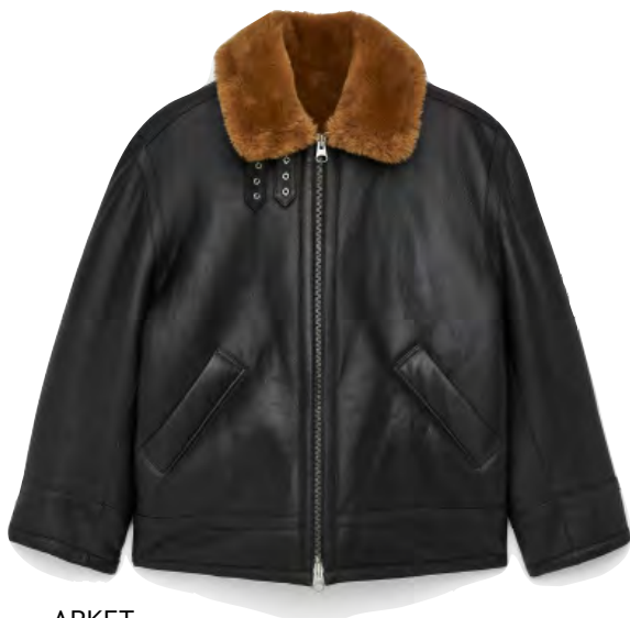
ARKET Shearling Leather Jacket £570