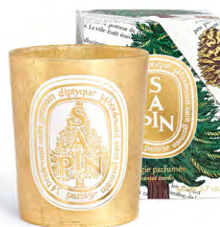
Diptyque Limited Edition Class £72