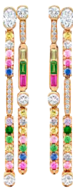
Boodles 'Play of Light' Earrings £23,700