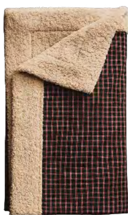
Zara Home Christmas Pet Throw £39.99