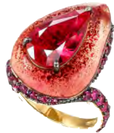
Anabela Chan Ruby Beetroot Elixir Ring £1,490