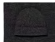
Sunspel Cashmere Gift Set £320