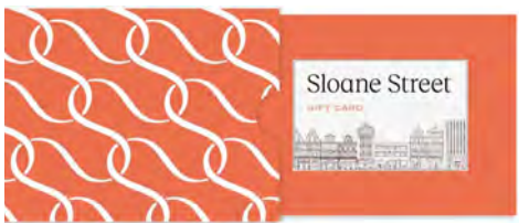
Sloane Street Gift Card sloanestreet.co.uk From £50