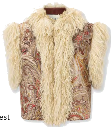
Maksu ERICA Vest £198