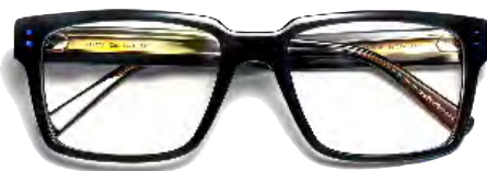
Tom Davies Glasses Wide Optical TD773 £330