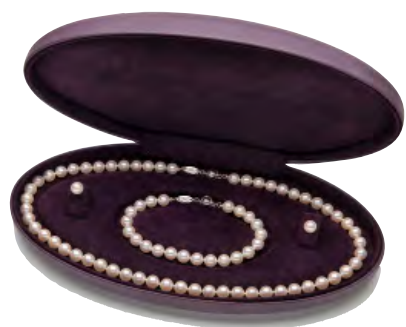
Yoko London Classic AA Akoya Pearl Necklace, Bracelet & Earring Set £5,300