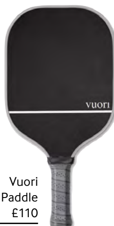
Vuori Pickleball Paddle £110