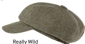
Really Wild Baker Boy Hat in Sage £95