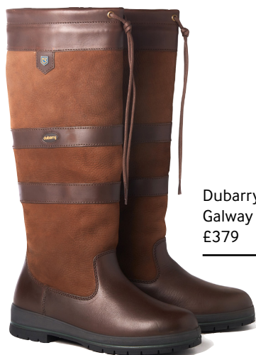
Dubarry of Ireland Galway Boots £379