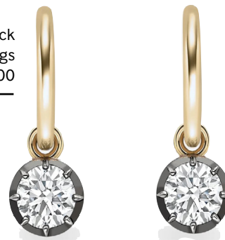
Jessica McCormack 0.40ct Diamond & Blackened Gold Gypset Hoop Earrings £5,500