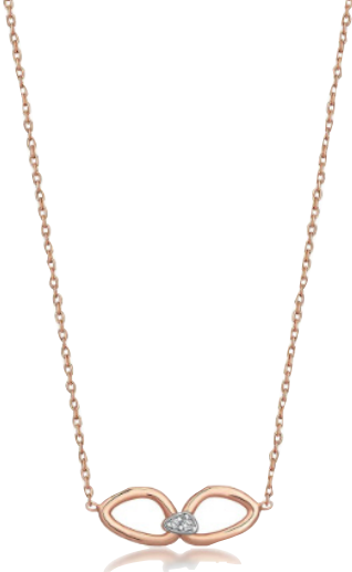
Reis Connection Little Necklace £470