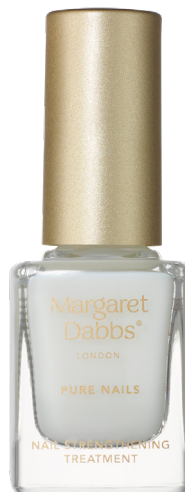
Margaret Dabbs Nail Strengthening Treatment in colour King's Road £16