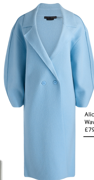
Alice + Olivia Waverly Coat £795