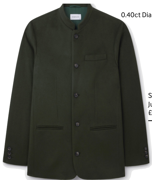
Sirplus Juniper Green Cashmere Nehru Jacket £695