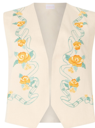
Cabana Loretta Caponi x Cabana Rose Denim Gilet, Butter £650