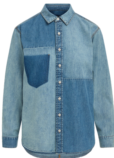
Veronica Beard Dalma Denim Button-Down Shirt £398