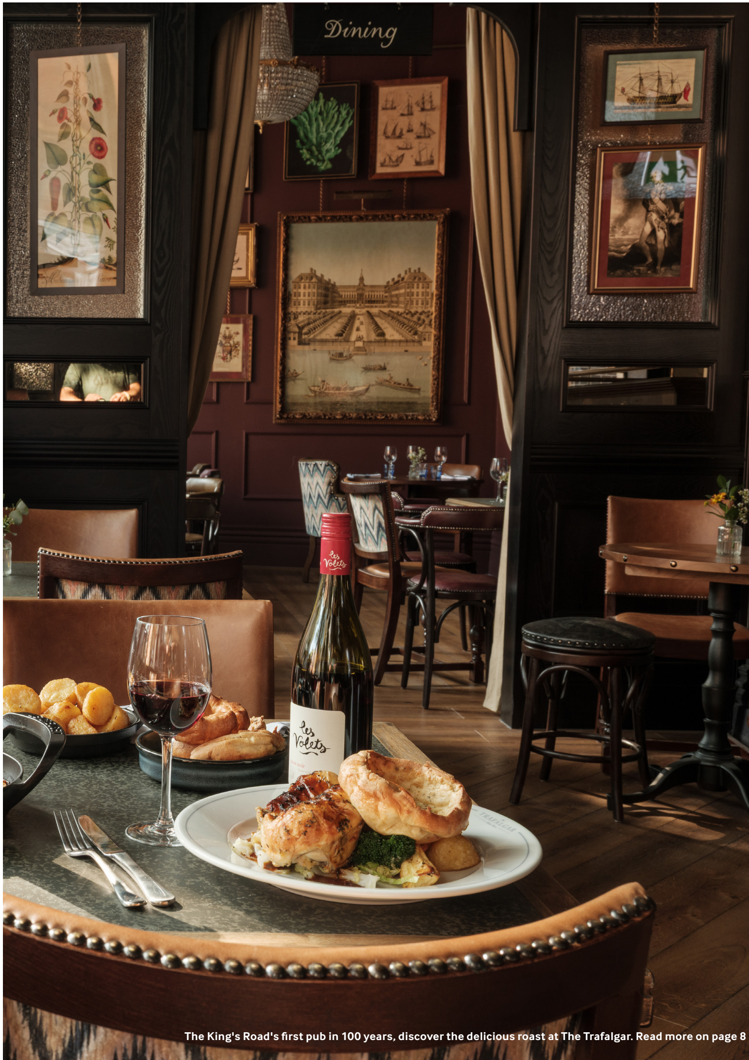
The King's Road's first pub in 100 years, discover the delicious roast at The Trafalgar. Read more on page 8