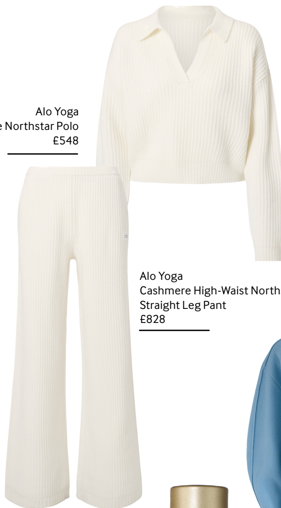
Alo Yoga Cashmere Northstar Polo £548