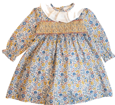
Beeboon A Girl D'Anjo Liberty Hand Smocked Dress £112.95