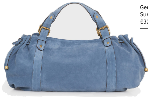
Gerard Darel Suede 24H bag in Chambray £325

'Fresh start fashion' – elevated everyday pieces to perfect your wardrobe