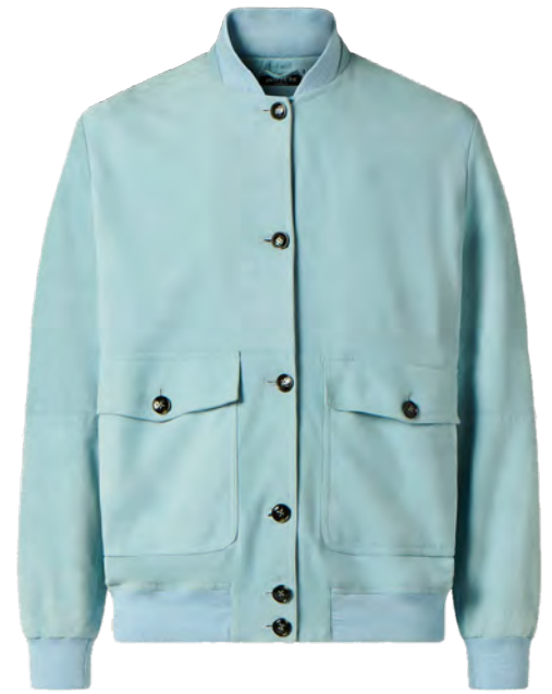
Kiton Suede Jacket in Azure Lambskin £10,300