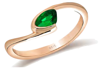
REIS Self Bond Green Ring £500