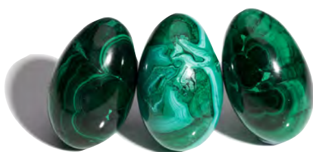
Cassandra Goad Gemstone Egg Malachite £525