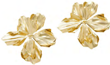
John Lewis Textured Flower Stud Earrings, Gold £16