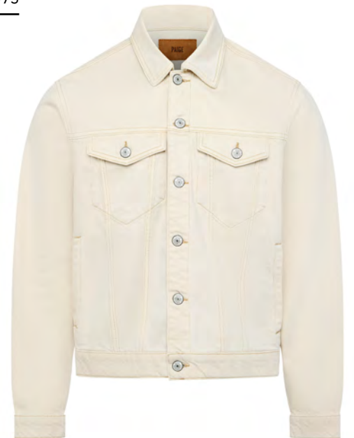
PAIGE Erickson Jacket in Ecru Natural £325