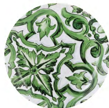
Dolce & Gabbana Casa Soup Plates, Set of 2 £265