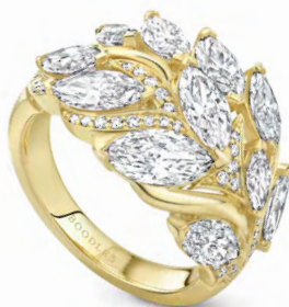
Boodles Lion White Diamond and 18 Carat Yellow Gold £27,000