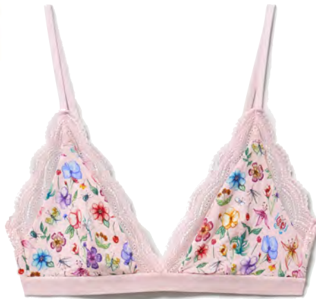
Stripe and Stare Triangle Lace Bra - Ethereal Wildflower Pink £35