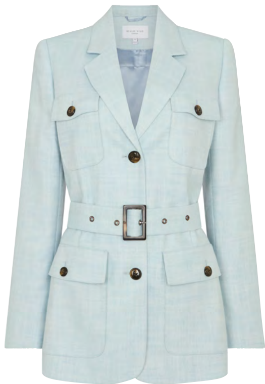
Really Wild Meryl Safari Jacket £595

LUXURY • ACCESSORIES • PERSONAL SHOPPING • EXPERIENCES