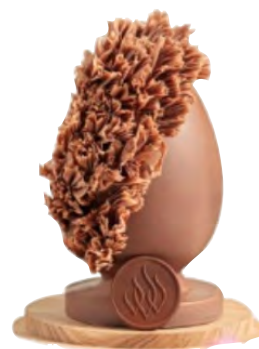
Jumeirah Carlton Tower Chocolate Easter Egg - Small £22