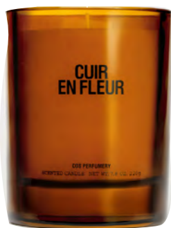
COS Perfumery Scented Candle £35