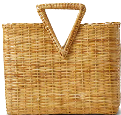
Veronica Beard Vesper Basket Tote £195