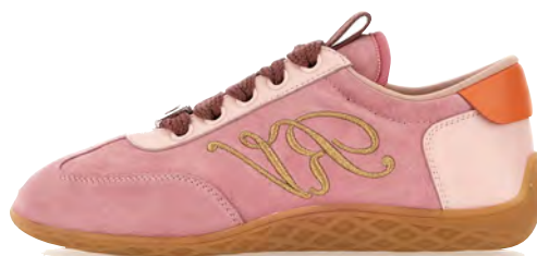
Roger Vivier Viv Low Sneakers in Pink Suede £890