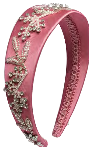
ERDEM Textured Satin Headband, Posie £395