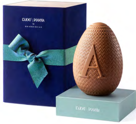
Armani/Dolci Chocolate, Peach and Salted Hazelnuts Easter Egg £79