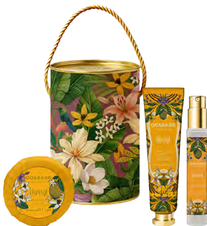
Granado Scented Gift Set - Neroli £41