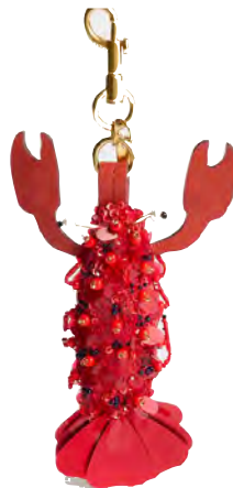
Anya Hindmarch Lobster Charm £220