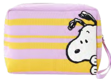
Essentiel Antwerp Jinche Purse £160