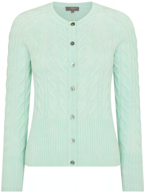
N.Peal Myla Cable Cashmere Cardigan, Mint Green £365

Needle and Thread Amara Round Neck Ruffle Gown Lemon Sorbet £490