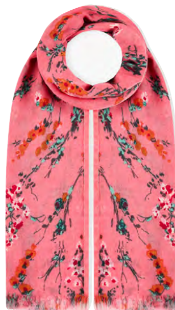
Brora Botanical Pure Wool Scarf, Coral £119