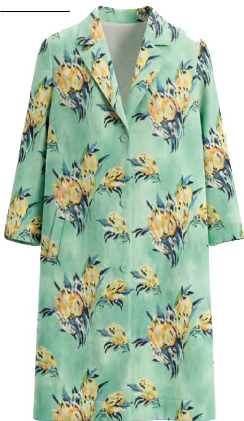
NRBY Elsie Linen Tulip Print Coat £250