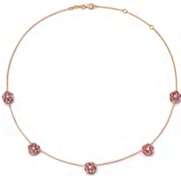
Kiki McDonough Pink Tourmaline and Diamond Necklace £4,500