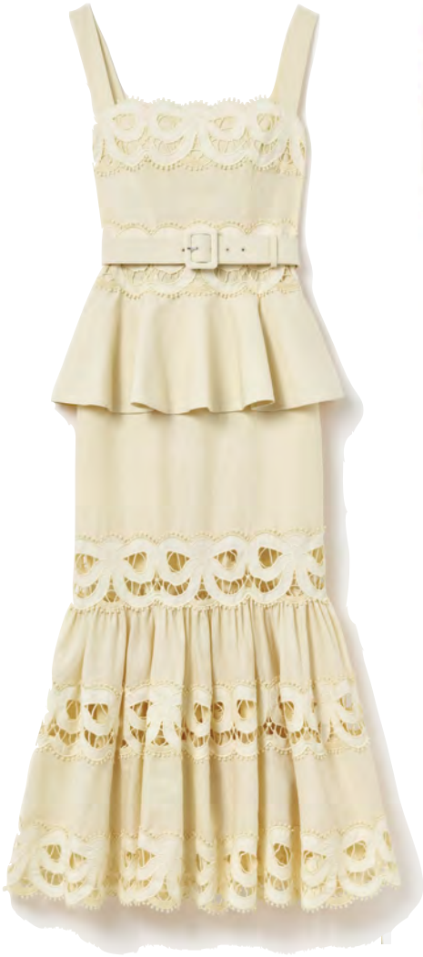
Self Portrait Linen Peplum Midi Dress £420