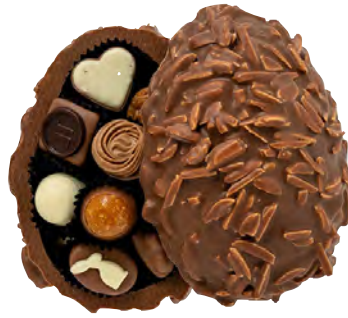
Laderach Rocher Easter egg with pralines £72