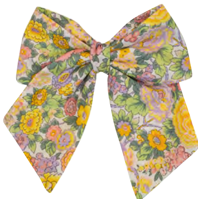
BeeBoon Girl Elysian Day Liberty Long Bow Clip £10