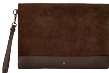
Dubarry Millymount Ladies Suede Clutch - Cigar £99