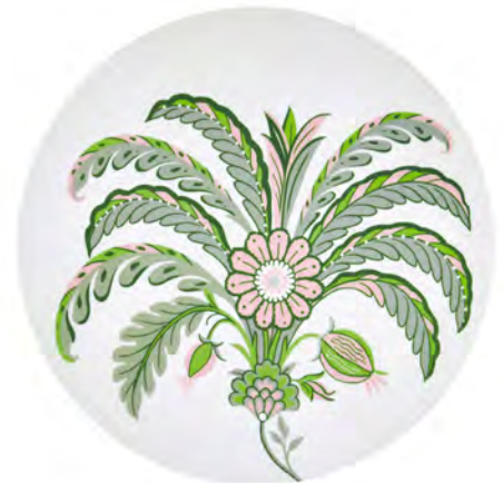
Addison Ross Palm Beach Green Placemats - Set of 4 £86